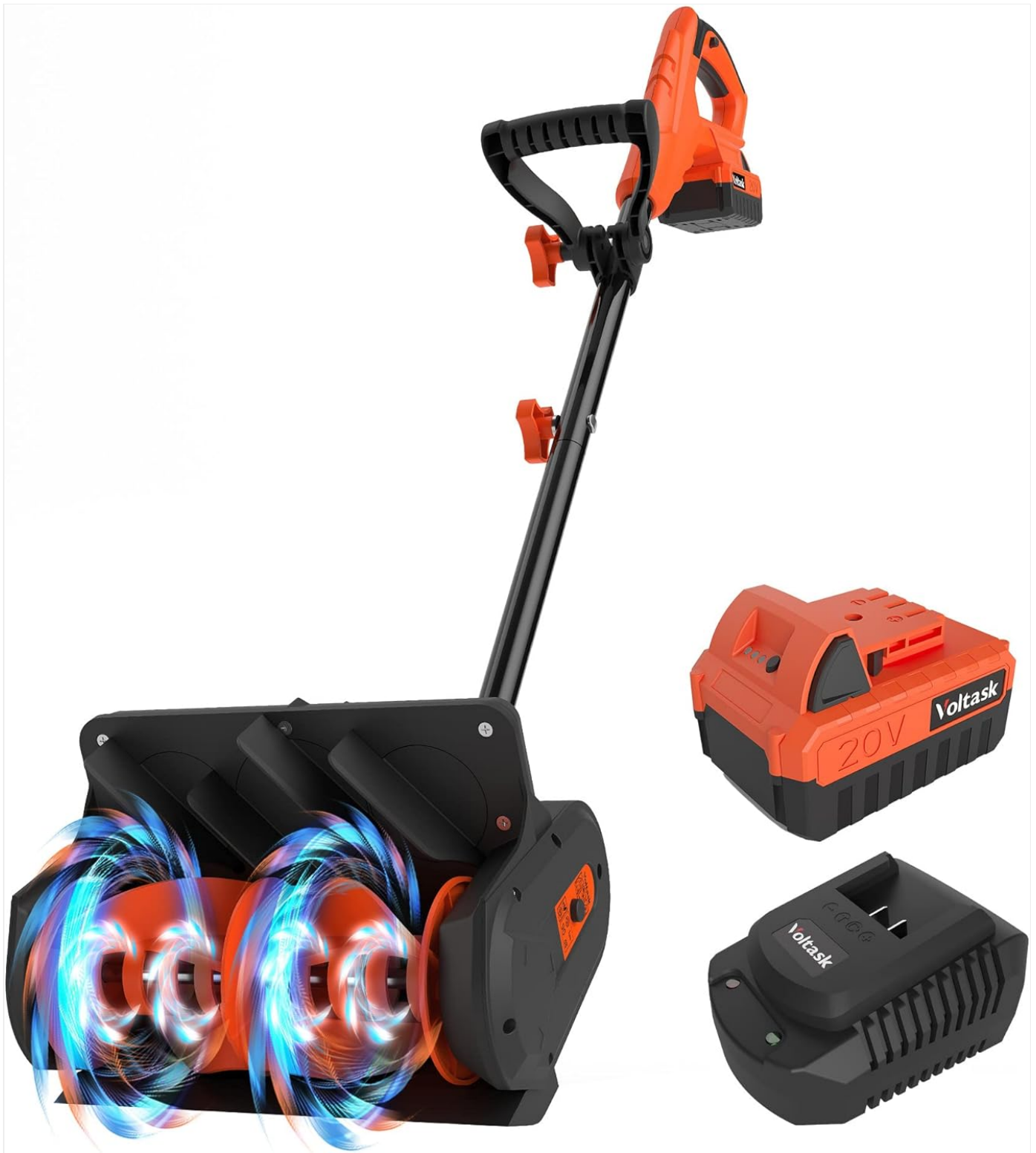
Image 1.1: The VOLTASK 11.8-Inch 20V Cordless Snow Shovel, including the main unit, 20V battery, and quick charger.