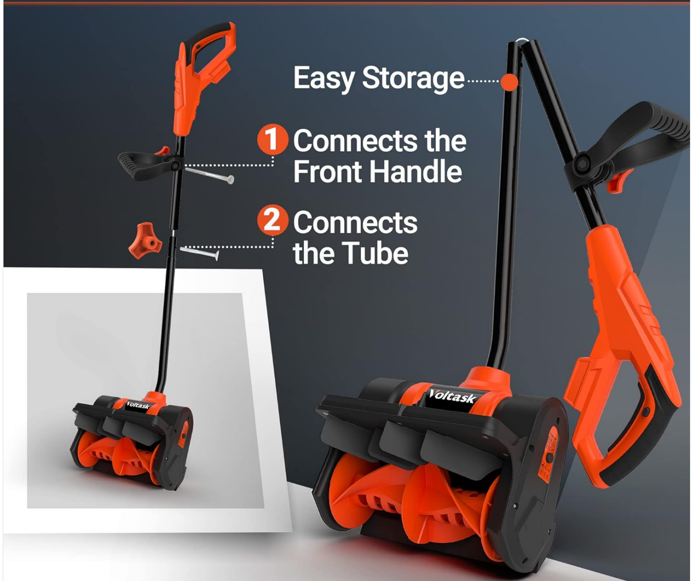
Image 4.1: Visual guide for the two-step assembly process of the snow shovel.

Once assembled, ensure all connections are tight and secure before proceeding to battery installation.