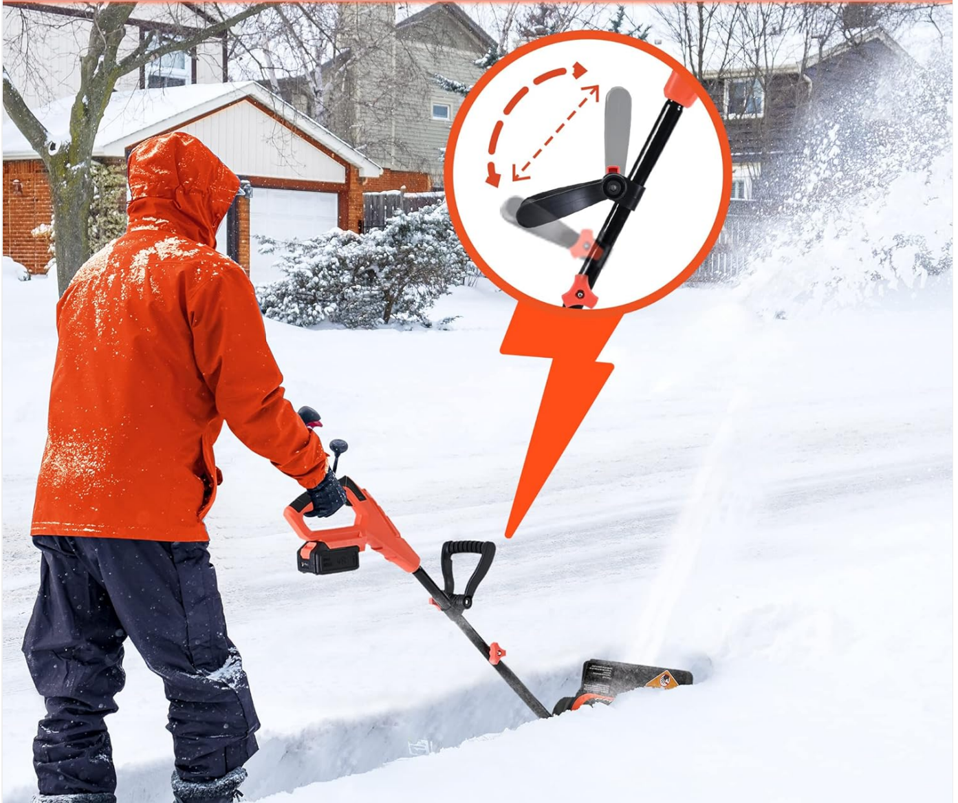
Image 5.5: Illustrates the adjustable handle feature for ergonomic use.

Feel free to adjust its height and angle into different direction