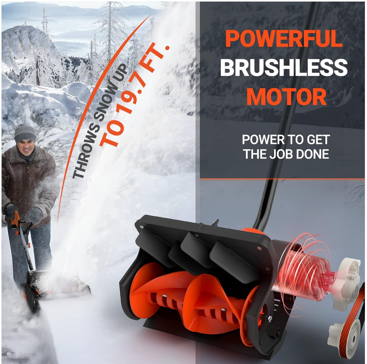
Image 5.3: Shows the snow throwing distance and highlights the brushless motor.