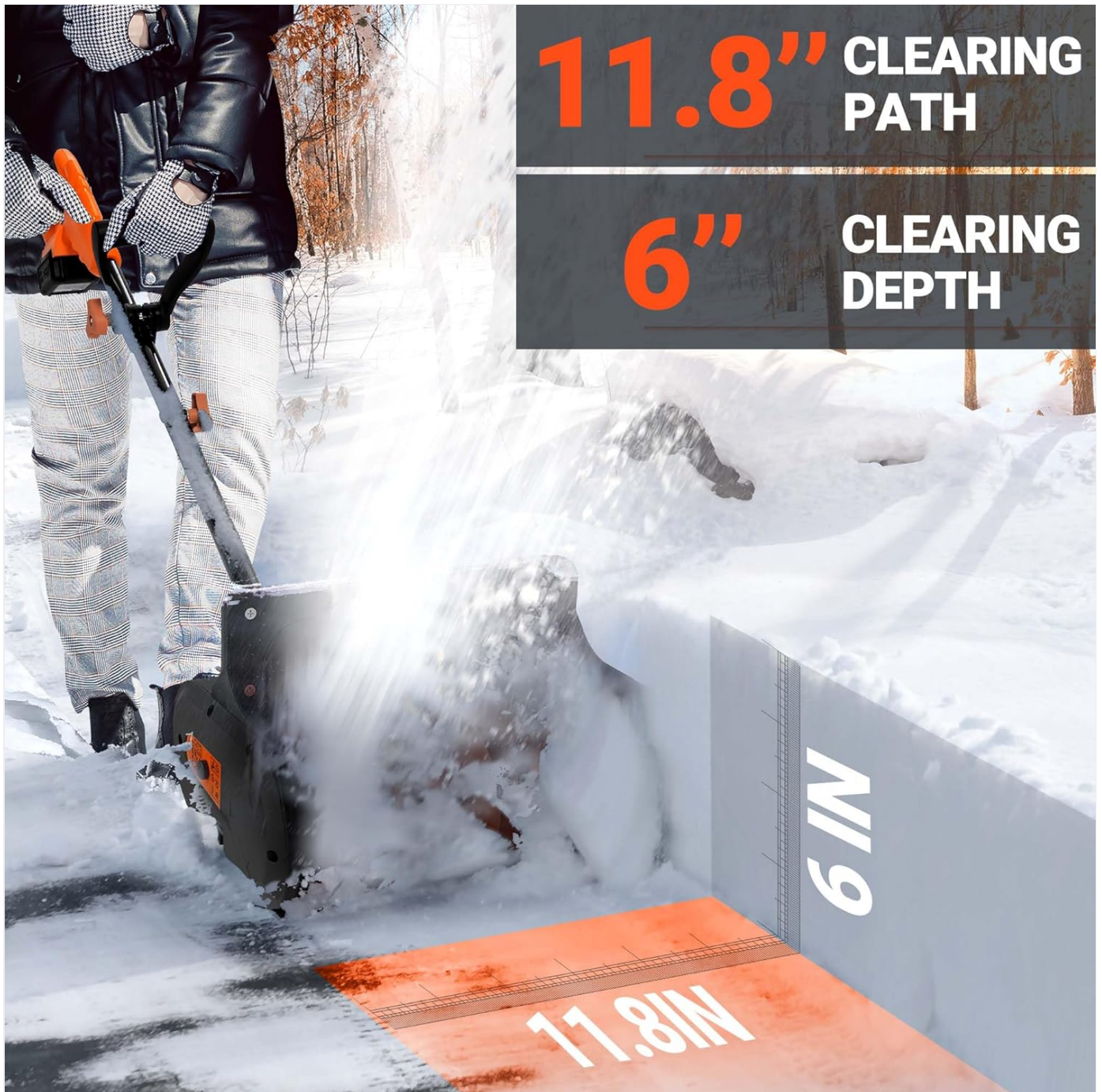
Image 5.1: Demonstrates the snow shovel's clearing capabilities, showing the width and depth of snow removal.