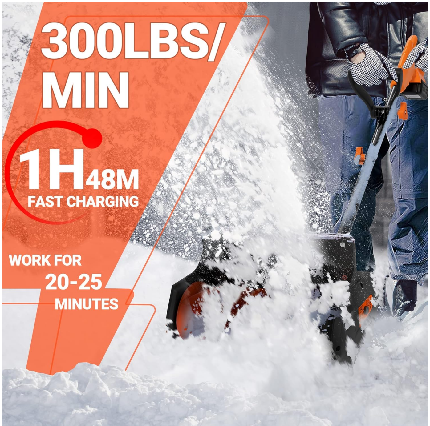
Image 5.4: Details the performance metrics of the snow shovel, including snow removal rate and battery life.