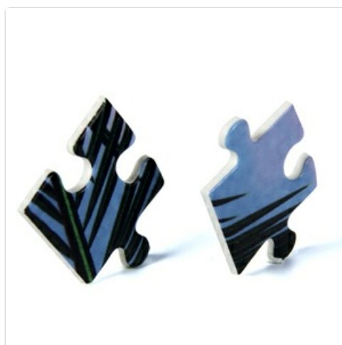
Figure 4: Two puzzle pieces demonstrating the secure and precise interlocking fit.