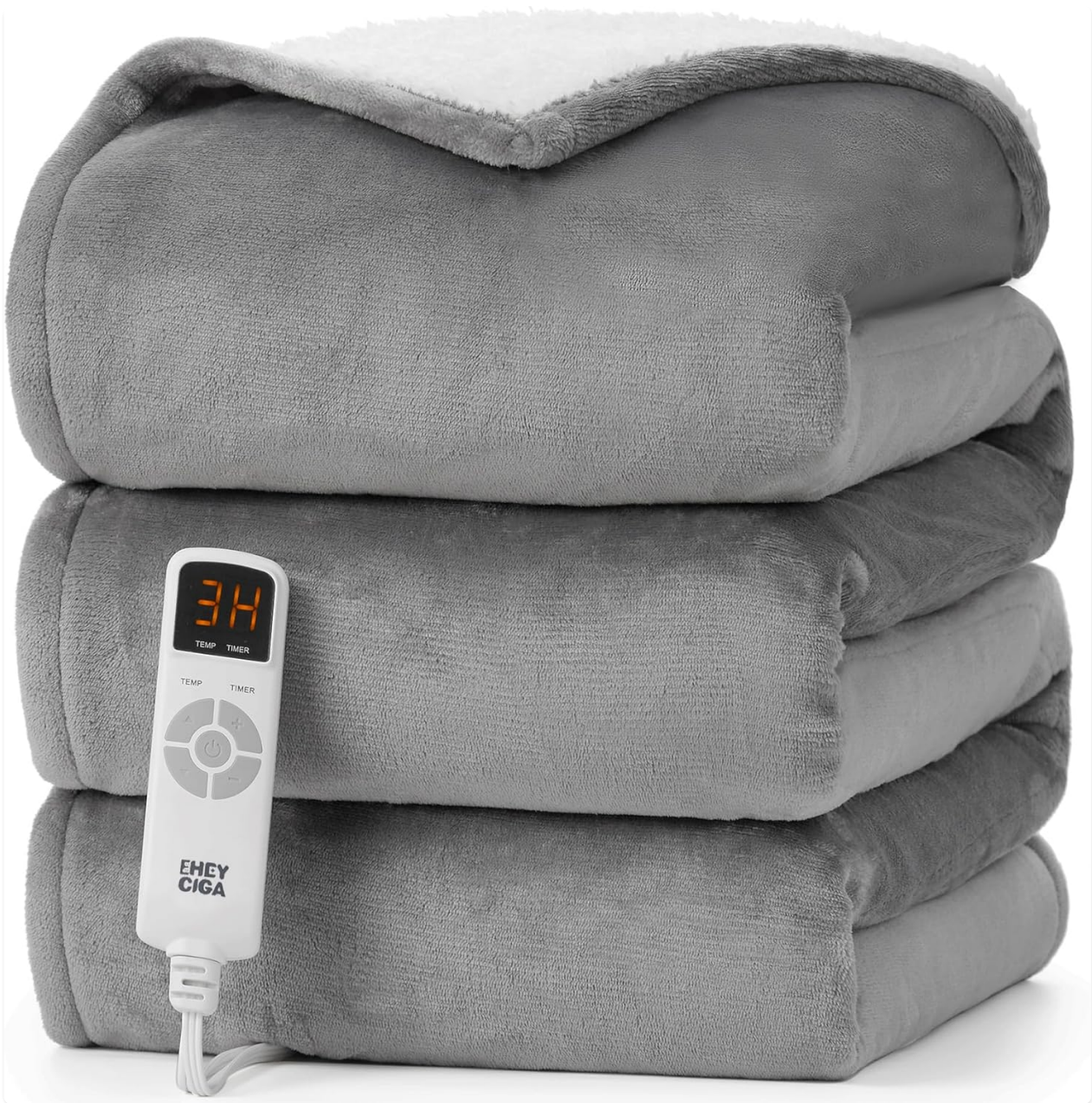
Image 1.1: The EHEYCIGA Heated Blanket Electric Throw, folded with its digital controller visible.