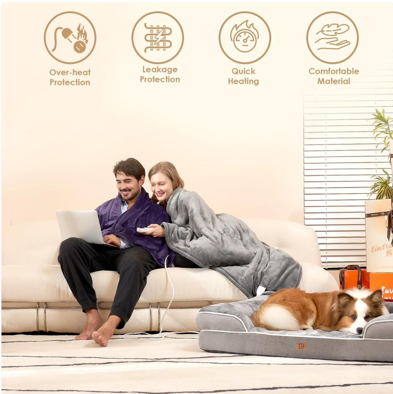
Image 2.1: Icons illustrating key safety and comfort features of the heated blanket.