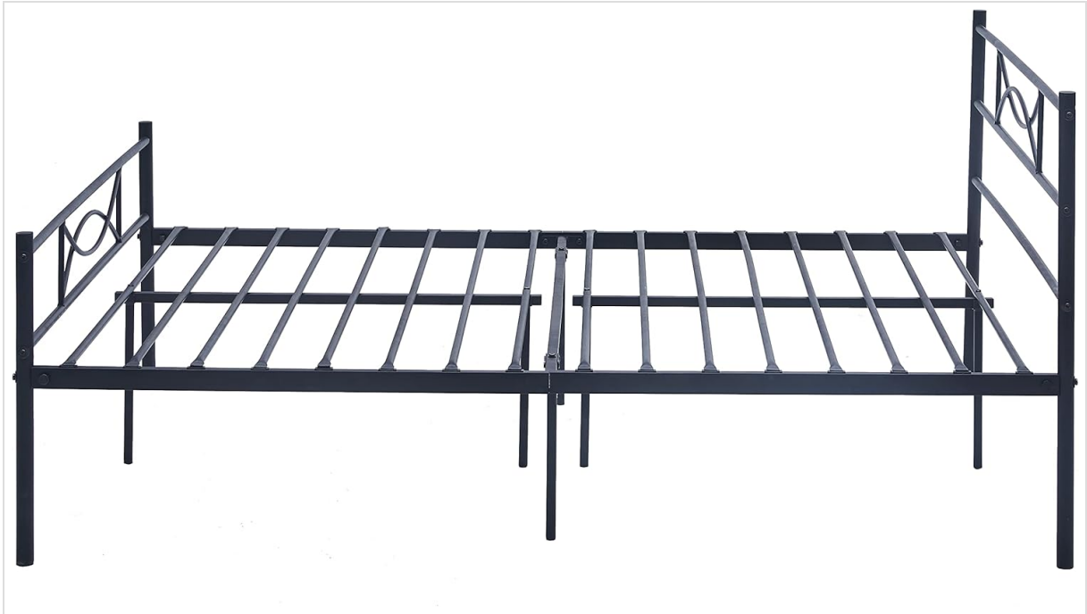
HJhomeheart Full Size Metal Platform Bed Frame fully assembled without a mattress, showcasing the metal slat foundation. This image illustrates the complete frame structure and slat system.