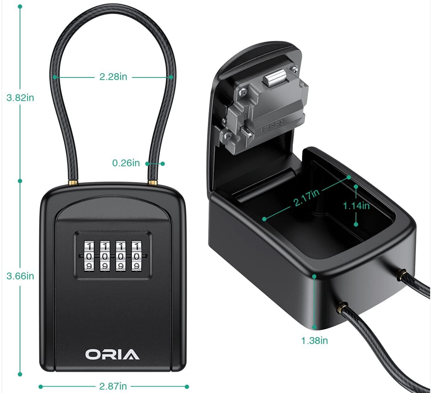
Image: Detailed dimensions of the ORIA Key Lock Box, showing its height, width, and depth for both the exterior and interior storage space.