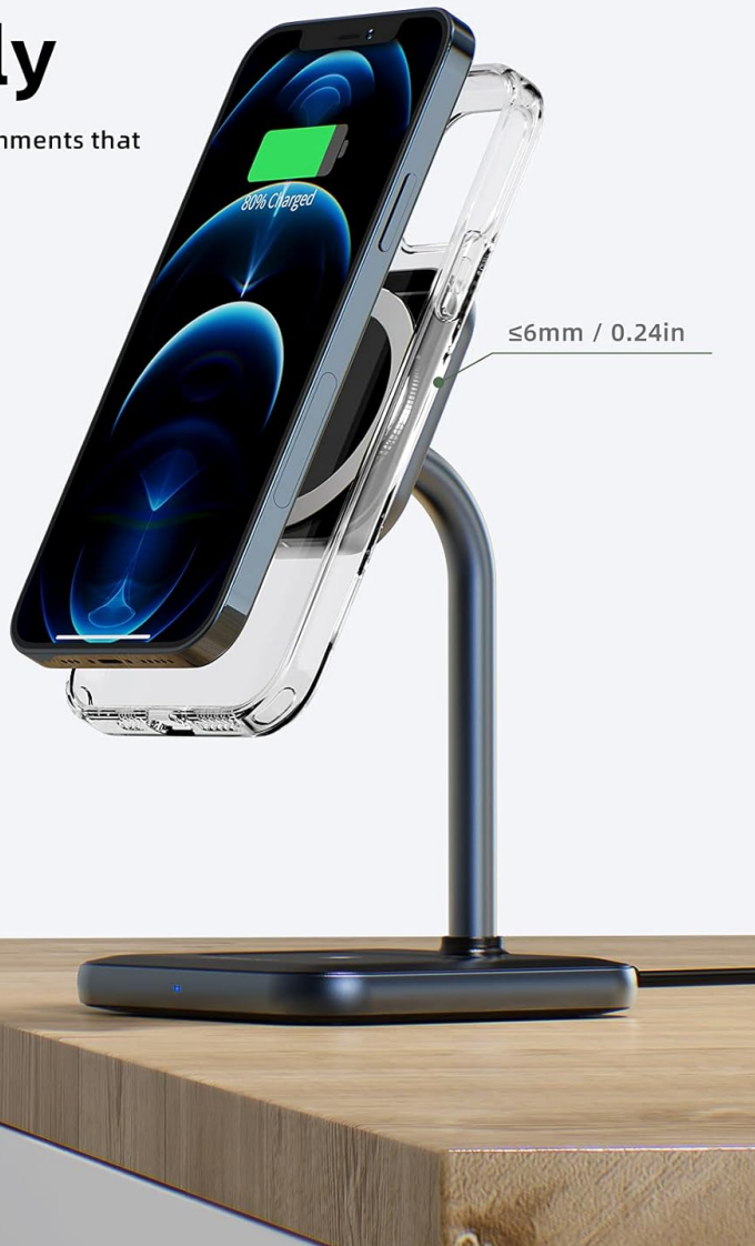
Figure 5: Guidance on using MagSafe-compatible cases and avoiding metallic or magnetic attachments that interfere with wireless charging.

Video 2: Demonstrates the magnetic attachment and charging of an iPhone on the stand.