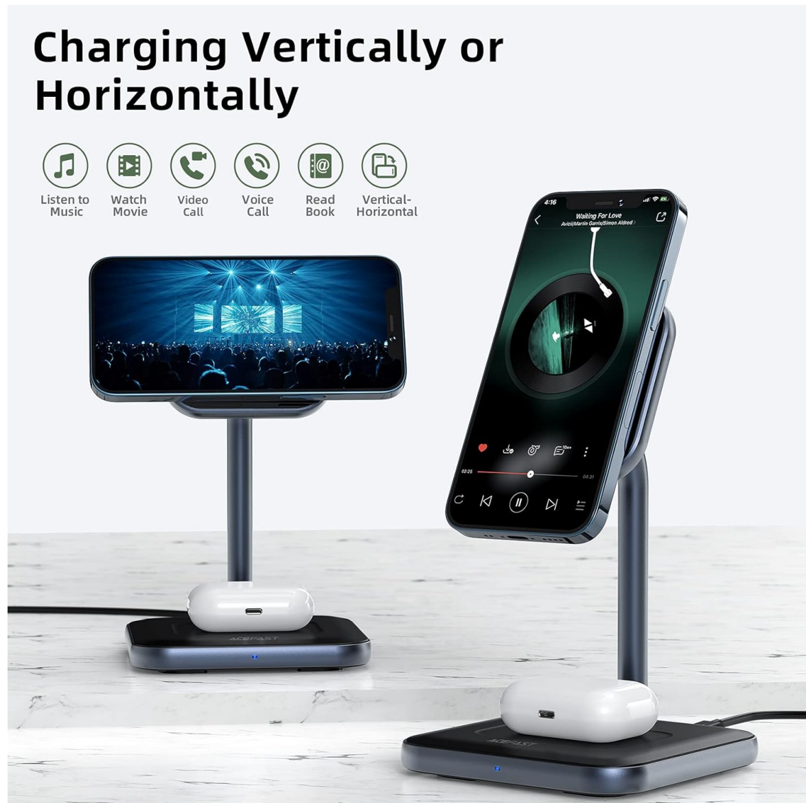
Figure 4: The magnetic charging area allows for both vertical and horizontal phone placement.