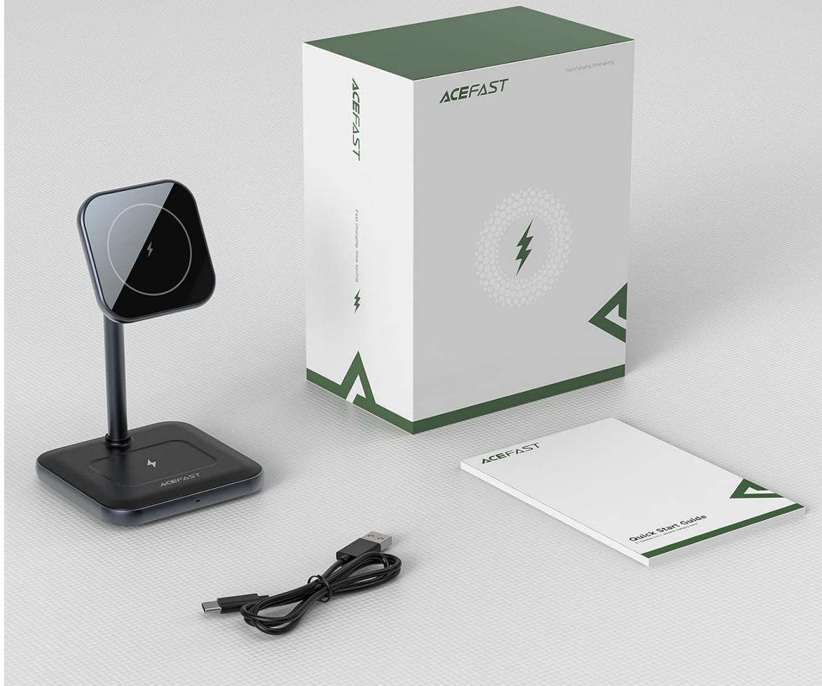
Figure 2: The retail packaging and included items for the ACEFAST E1 charging stand.