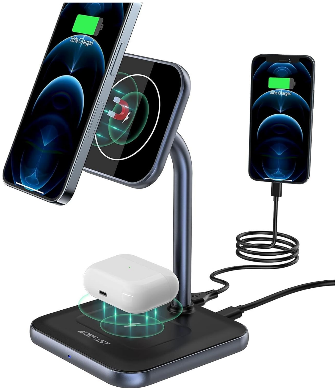
Figure 1: ACEFAST E1 2-in-1 Magnetic Wireless Charging Stand in use, charging an iPhone and AirPods.