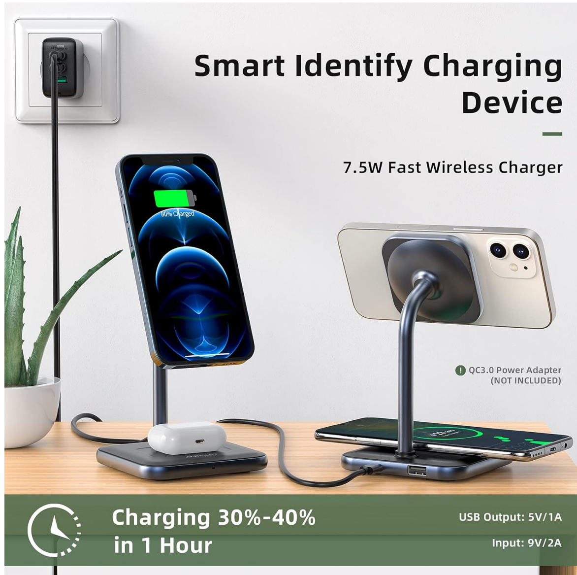
Figure 9: Visual representation of device compatibility for the charging stand.