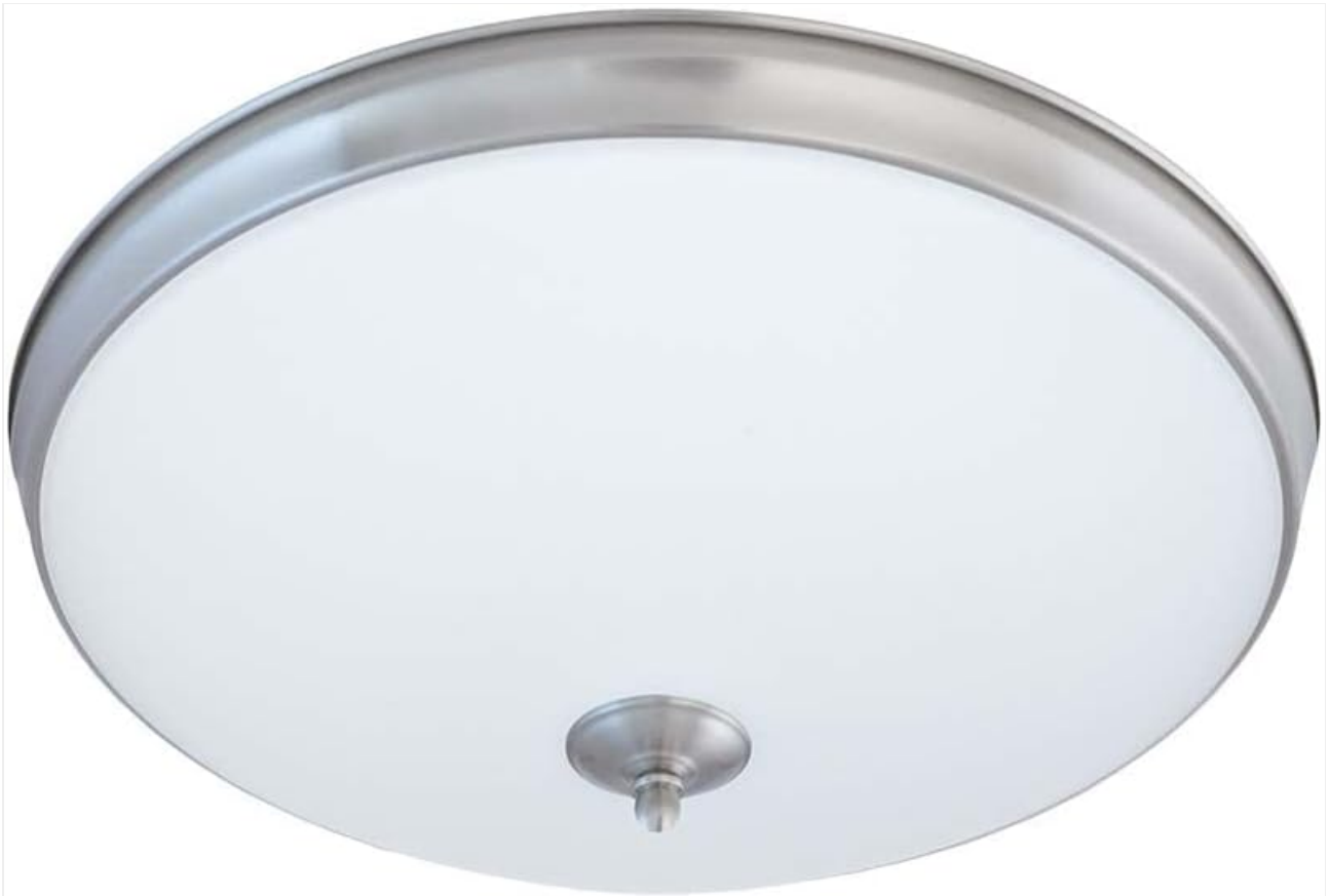
Image: The Good Earth Lighting Legacy 15-inch LED Flush Mount fixture, showcasing its satin nickel finish and frosted opal glass diffuser.

The Good Earth Lighting Legacy 15-inch LED Flush Mount fixture is designed to provide efficient and stylish illumination for various indoor spaces. This second-generation model features a satin nickel finish with a frosted opal glass diffuser, offering 1500 lumens of 3000K bright white light. It is dimmable and boasts a long-lasting integrated LED light source with a 50,000-hour rated lamp life.