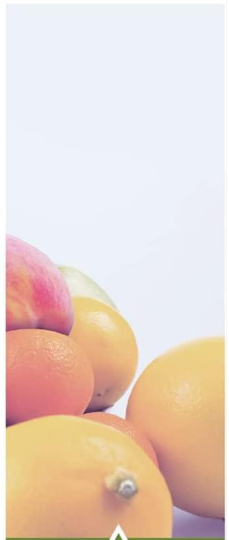
CRI 50-70: Fair

Image: Illustration demonstrating the 80-90 CRI (Color Rendering Index) of Good Earth Lighting ceiling fixtures, which produces excellent natural light.