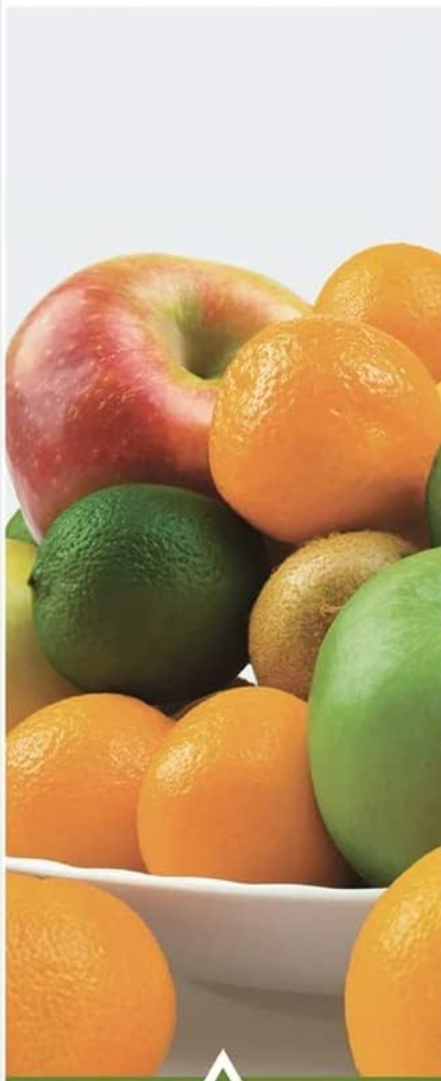
CRI 90: Excellent