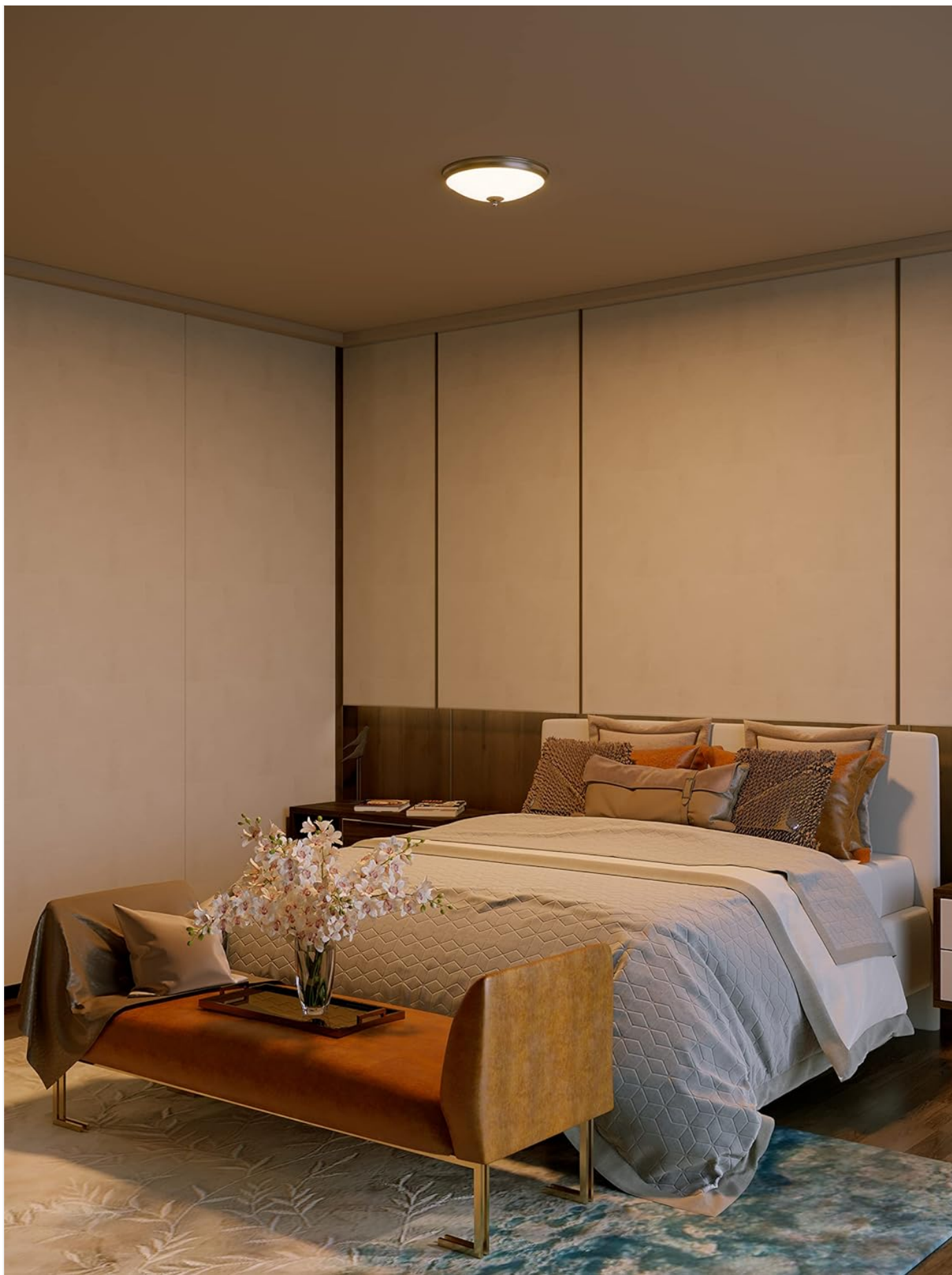
Image: The Legacy LED Flush Mount fixture installed in a bedroom, demonstrating its integration into a living space.