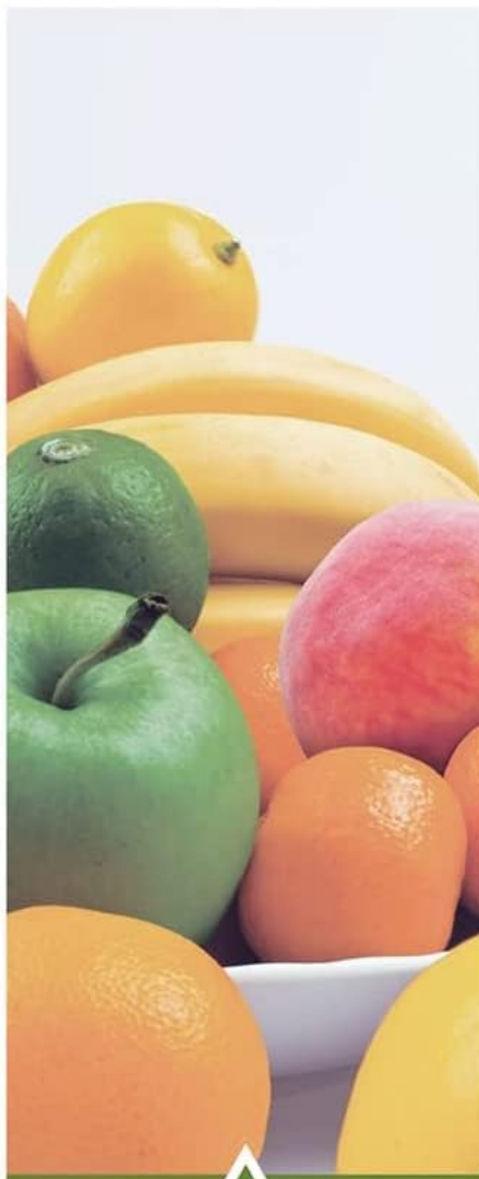
CRI 80: Good