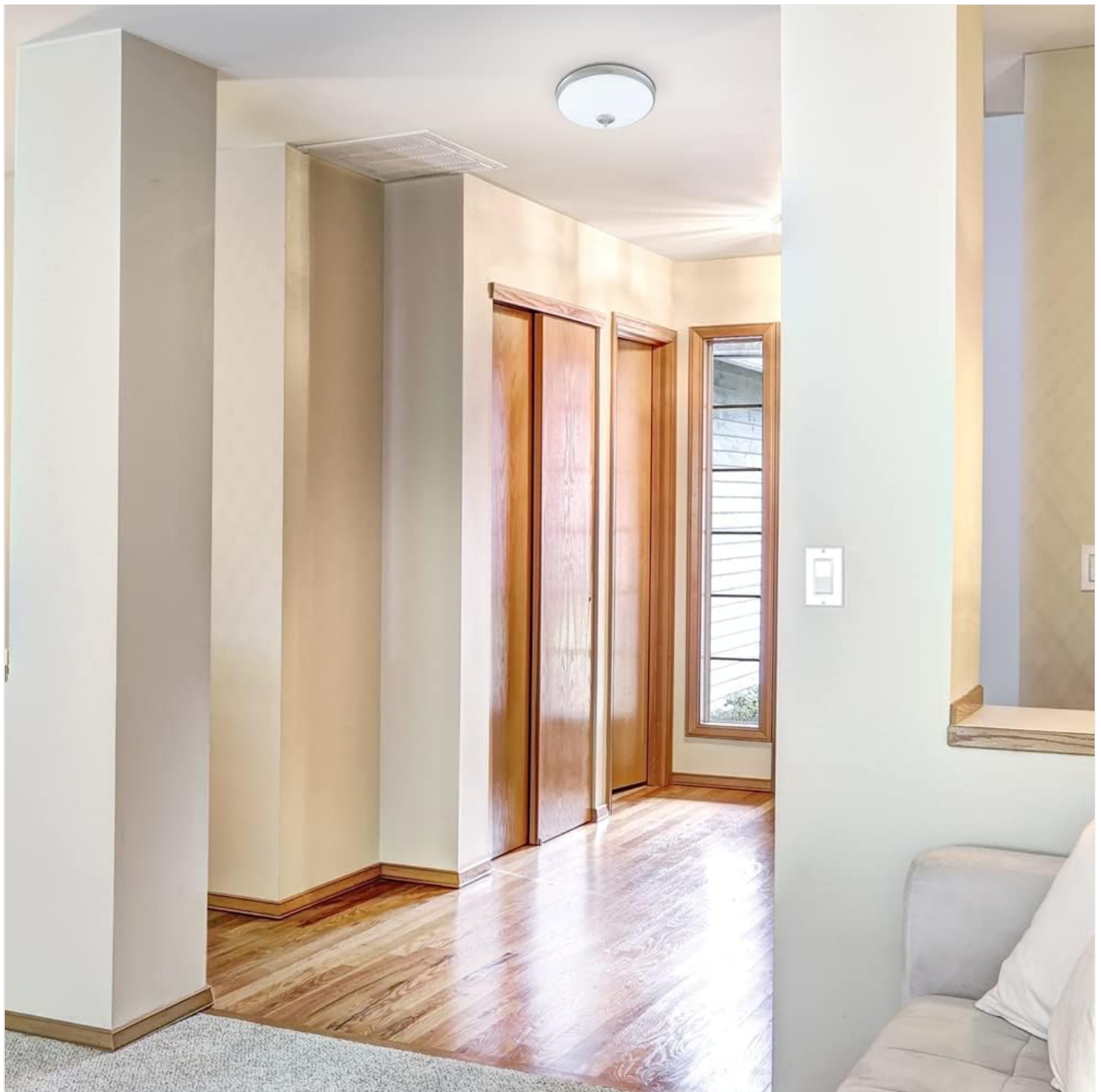
Image: The Legacy LED Flush Mount fixture installed in a hallway, showing its suitability for various areas.