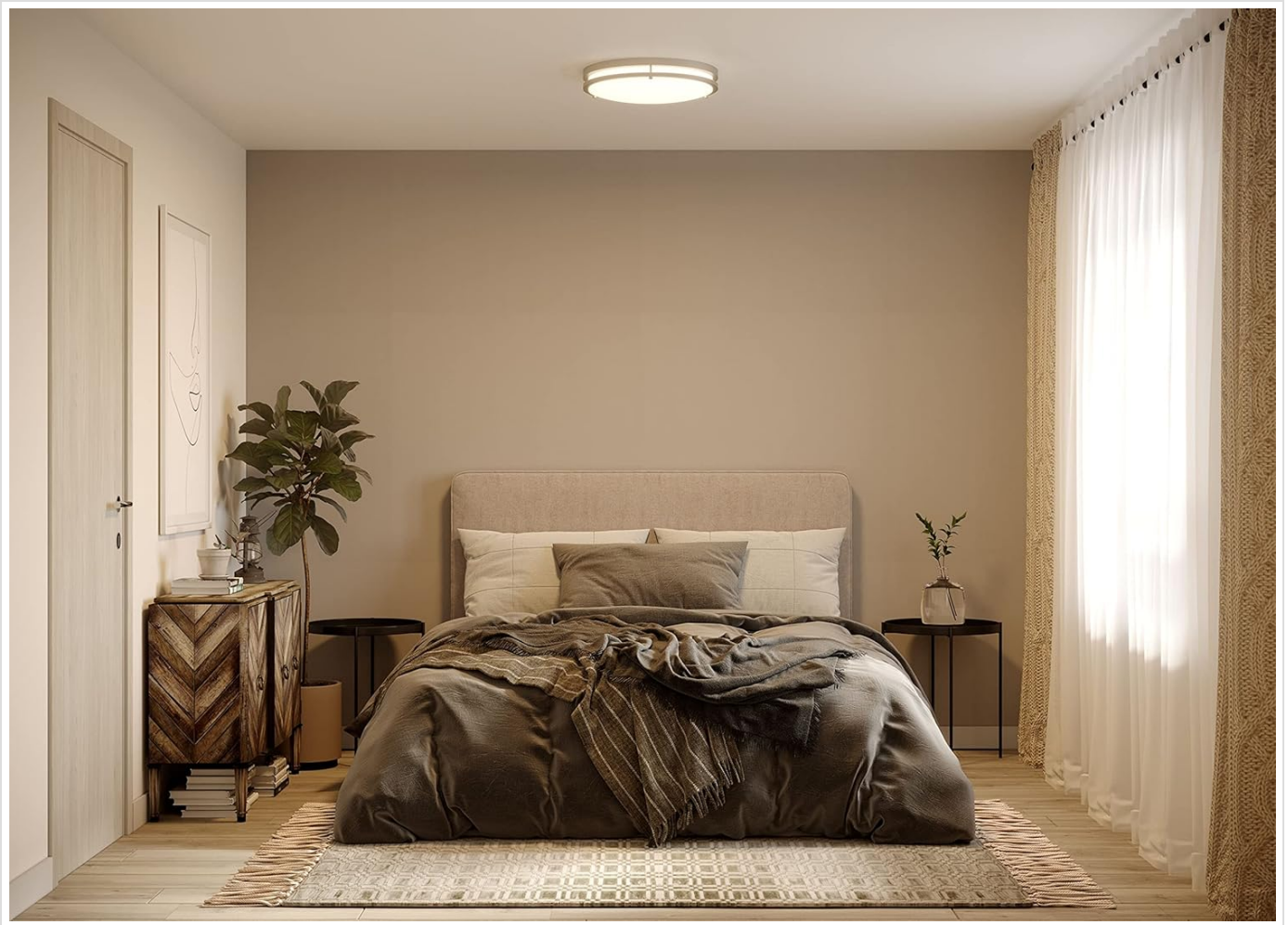
Image: The Jordan 11-inch LED Flush Mount fixture installed on a ceiling in a bedroom, providing ambient lighting.