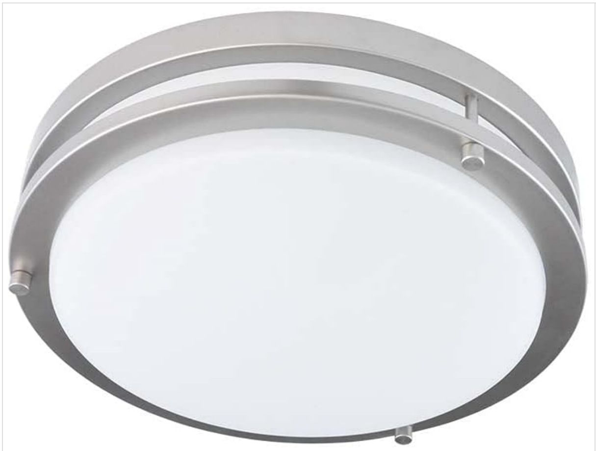
Image: Good Earth Lighting Jordan 11-inch LED Flush Mount fixture in satin nickel finish.