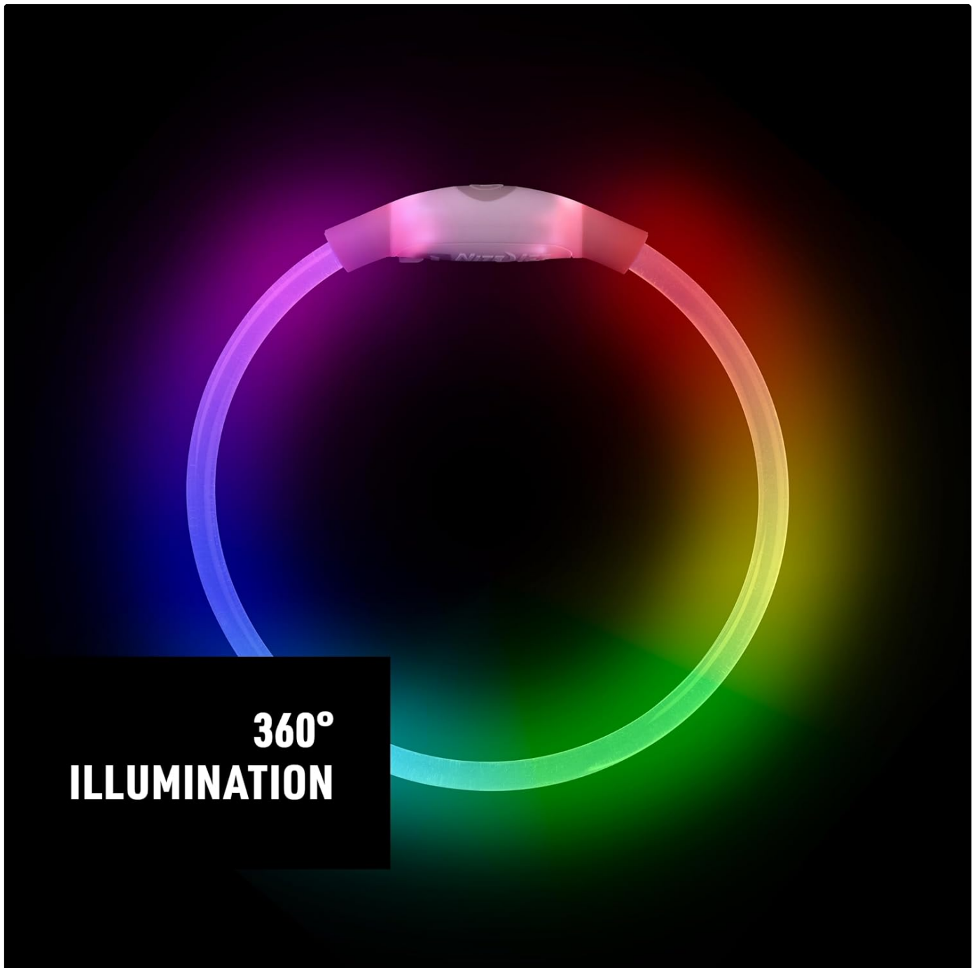
Figure 4.2: The necklace offers 360-degree illumination for enhanced visibility in the dark.