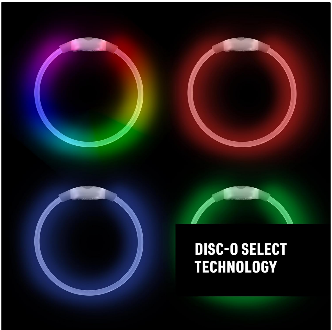
Figure 4.1: The necklace features Disc-O Select technology, allowing you to choose from multiple colors or a color-changing mode.