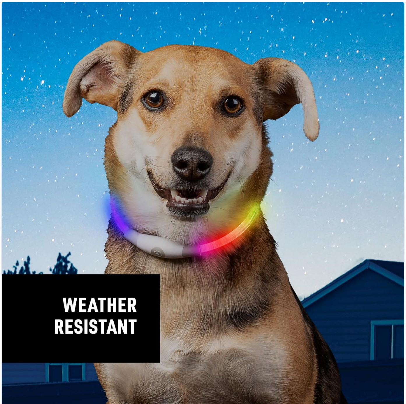
Figure 4.3: The weather-resistant design ensures the necklace can be used in various outdoor conditions.

Your browser does not support the video tag.