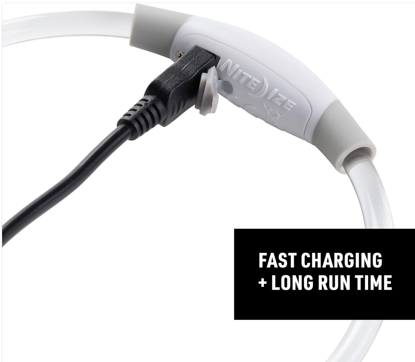
Figure 3.2: The necklace features a Micro USB port for convenient recharging, offering fast charging and long run time.

Your browser does not support the video tag.