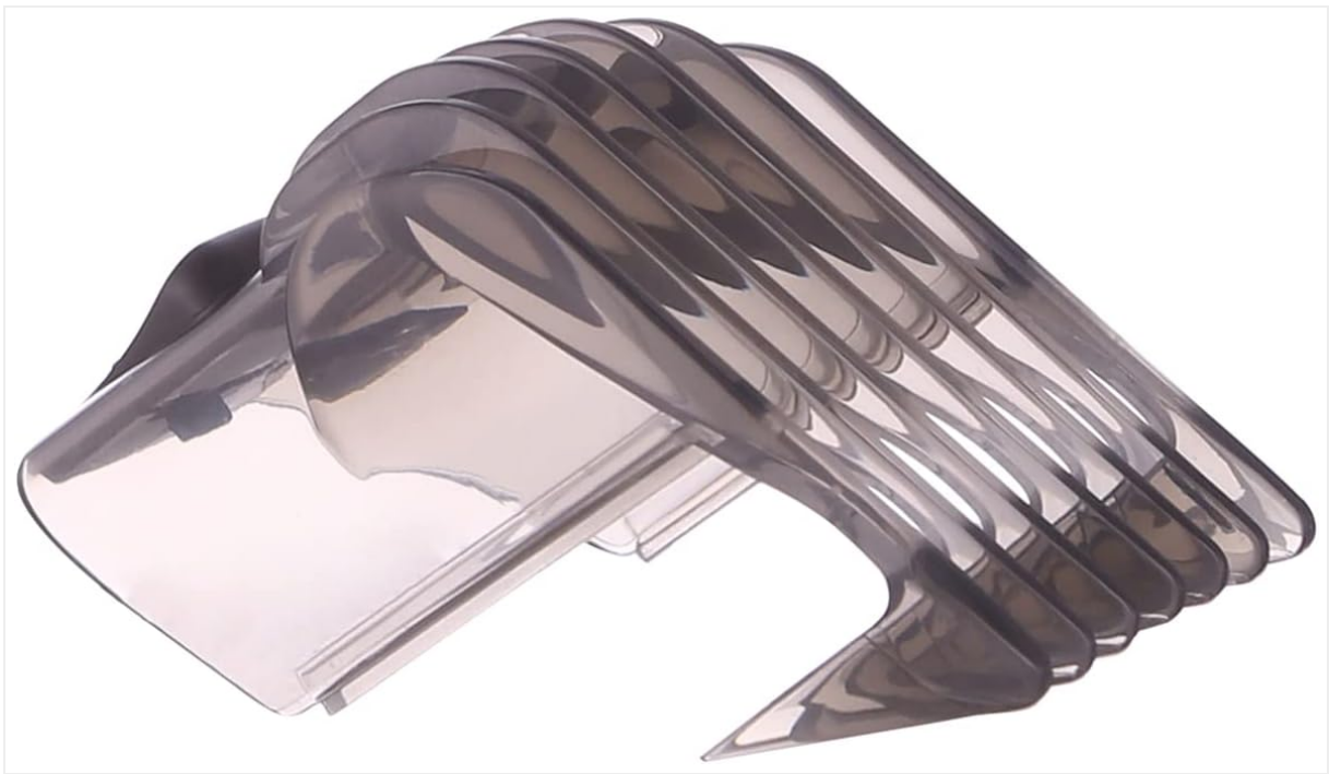
Figure 2.3: Another view of an adjustable comb attachment, showing its design.