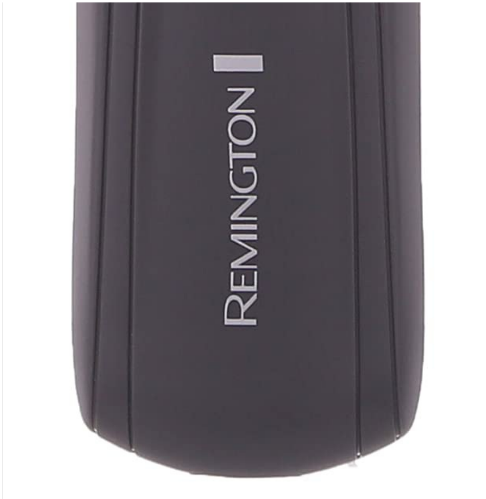
Figure 2.1: Rear view of the Remington HC5156 Hair Clipper, showing the power button and product information.