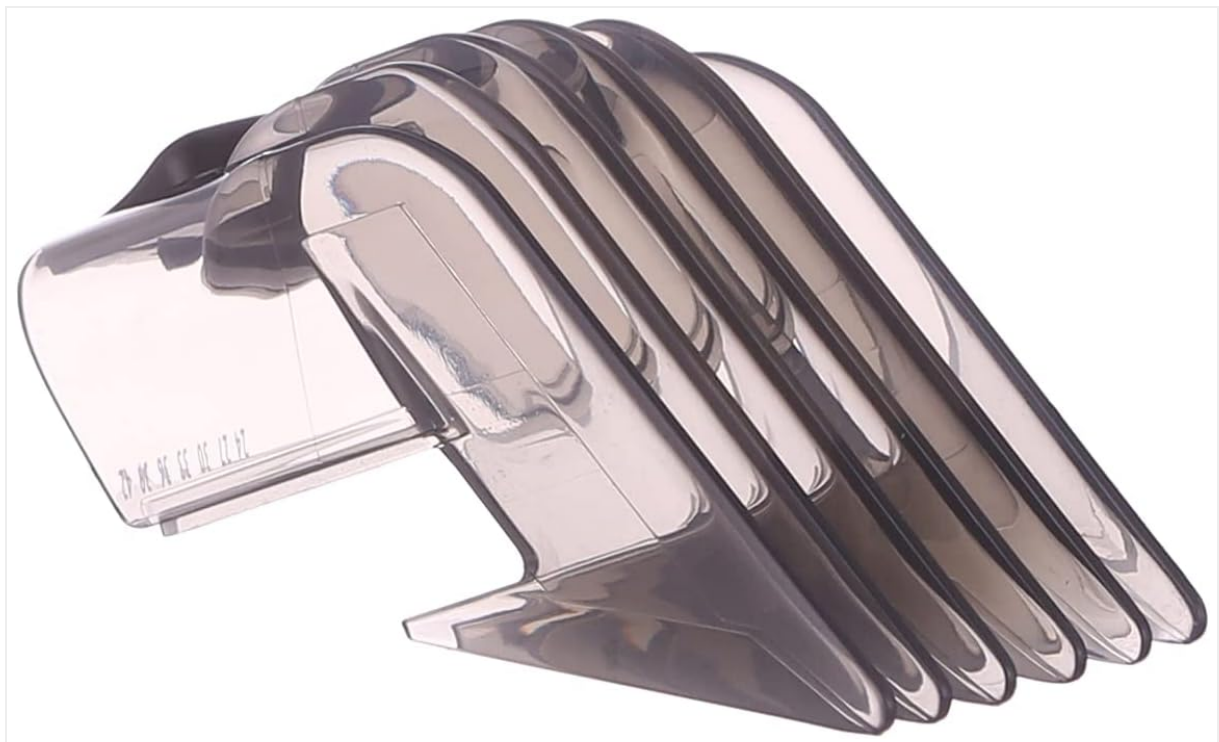
Figure 2.2: One of the adjustable comb attachments for the hair clipper.