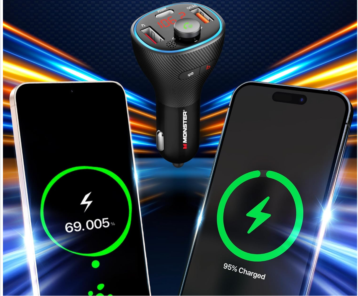
Image: Two smartphones, one charging via USB-C PD and the other via USB-A, connected to the Monster FM Transmitter, illustrating its dual fast-charging capabilities.