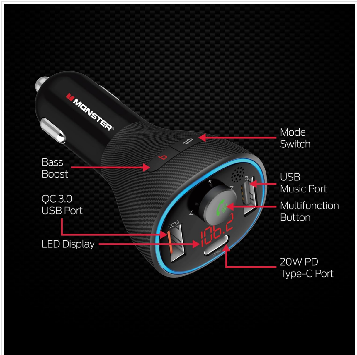
Image: A detailed diagram illustrating the various components of the Monster FM Transmitter, including the Bass Boost button, QC 3.0 USB Port, LED Display, Mode Switch, USB Music Port, Multifunction Button, and 20W PD Type-C Port.