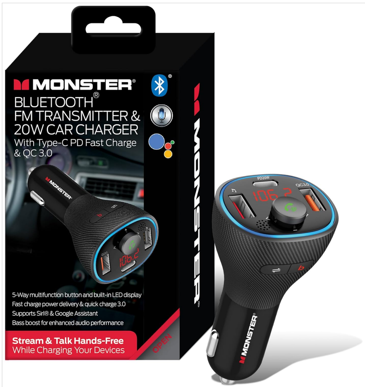
Image: The Monster Bluetooth FM Transmitter shown alongside its retail packaging, highlighting its compact design and key features.