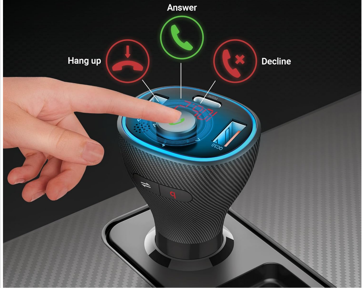
Image: The Monster FM Transmitter securely plugged into a car's cigarette lighter socket, displaying its active LED screen and illuminated ports.