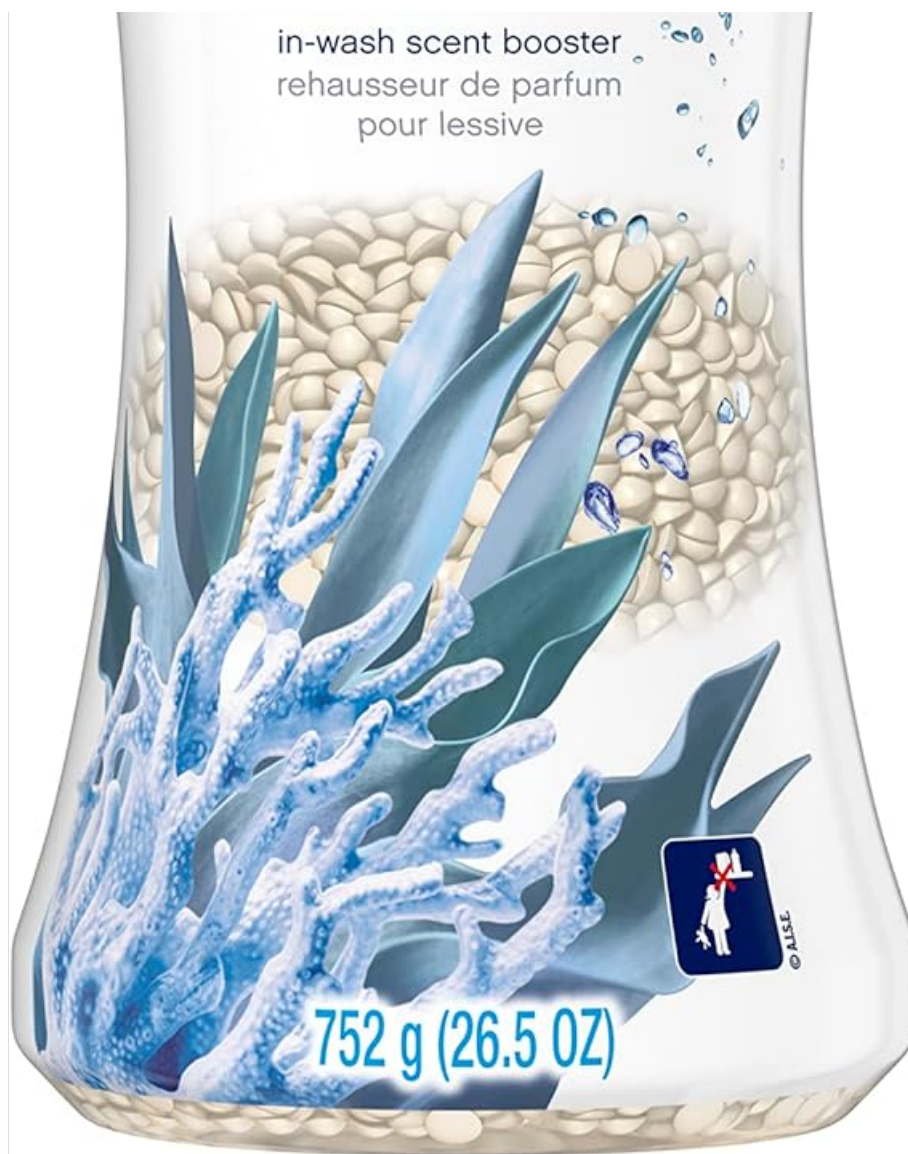
Figure 1.1: Downy Light Laundry Aroma Booster, Ocean Mist. This image shows the product bottle, highlighting its light scent and long-lasting freshness.