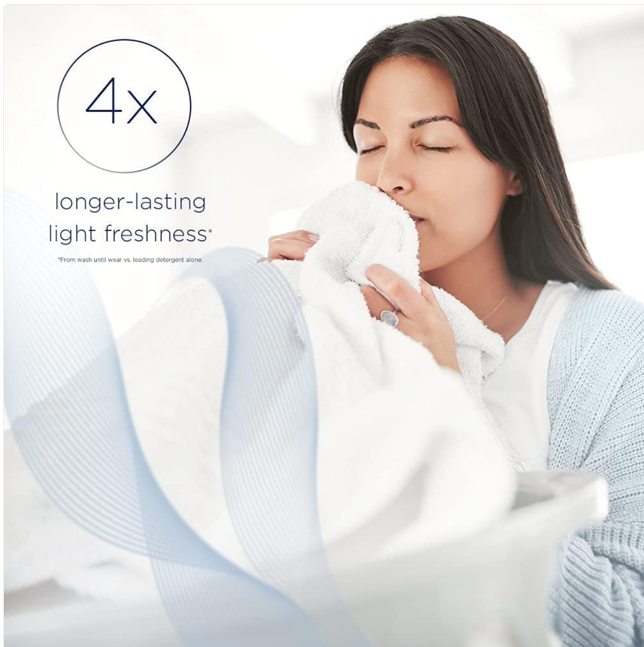
Figure 4.1: Enjoying long-lasting freshness. This image depicts the result of using the product, highlighting the 4x longer-lasting light freshness it provides.

This product is safe for use with all colors and fabrics. It is compatible with all types of washing machines, including standard and high-efficiency (HE) models.