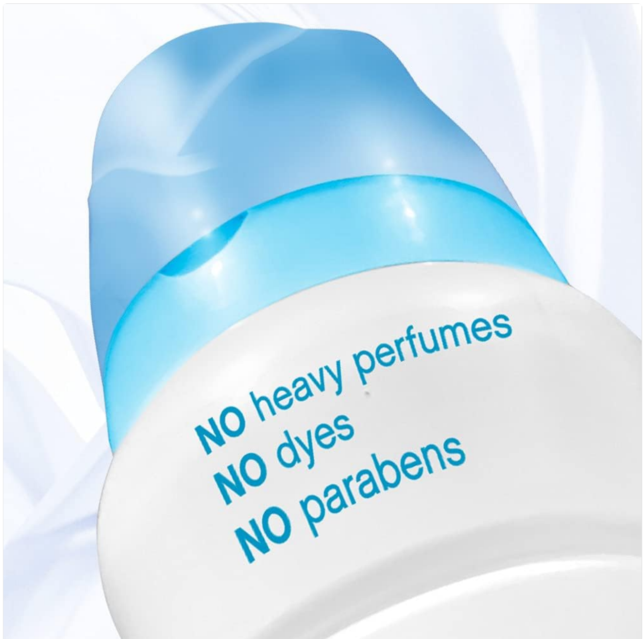
Figure 2.1: Product formulation details. This image emphasizes that the product contains no heavy perfumes, dyes, or parabens, contributing to its light aroma profile.