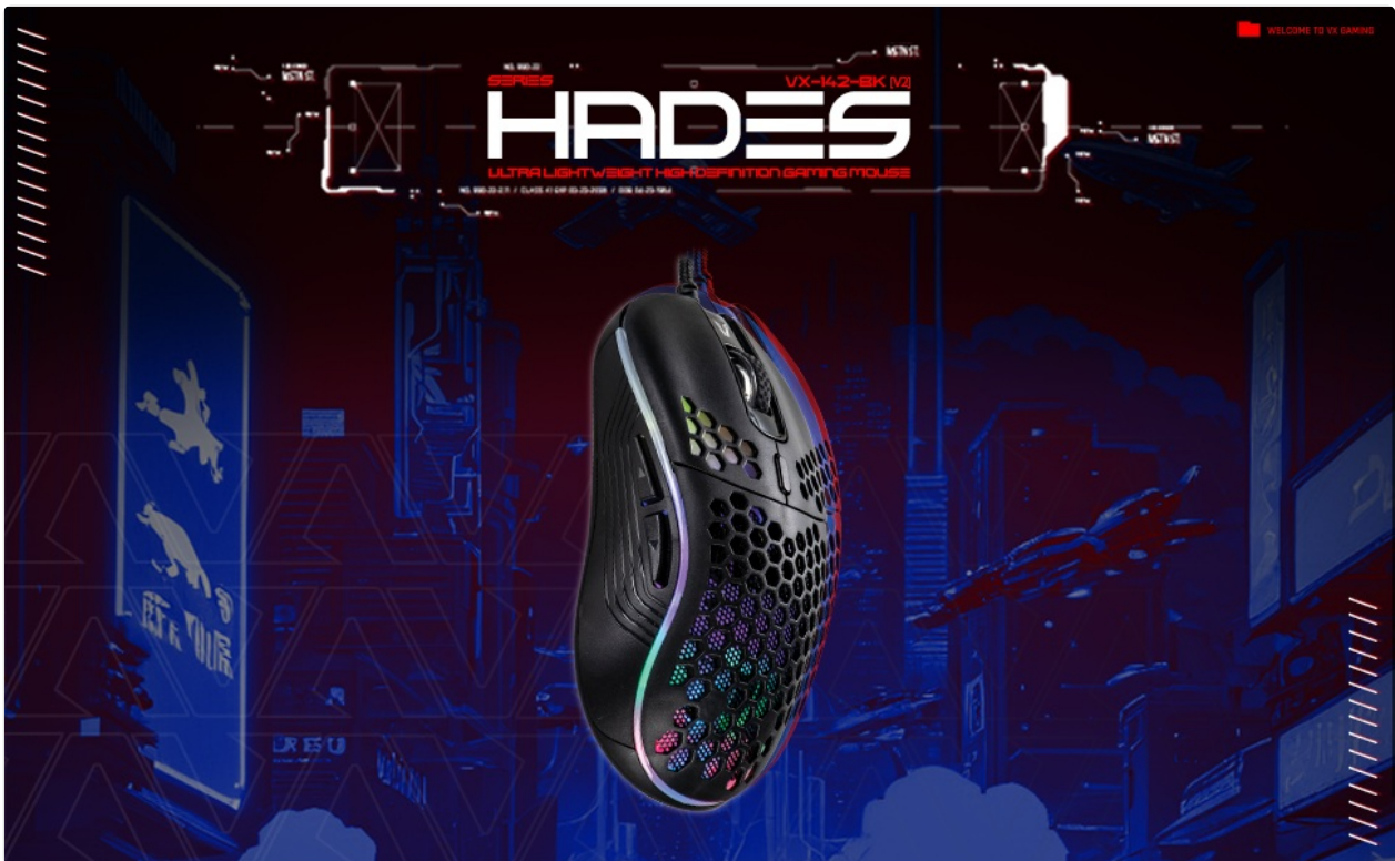
Image 3.1: The gaming mouse highlighting its ultra-lightweight design, honeycomb surface, 7-color rainbow lighting, and 7200 DPI capability.

The Volcano VX Gaming Hades Series mouse features a dynamic 7-color pulse effect for its lighting. This lighting automatically cycles through various colors, enhancing your gaming setup's aesthetic. No manual adjustment is typically required for the pulse effect.