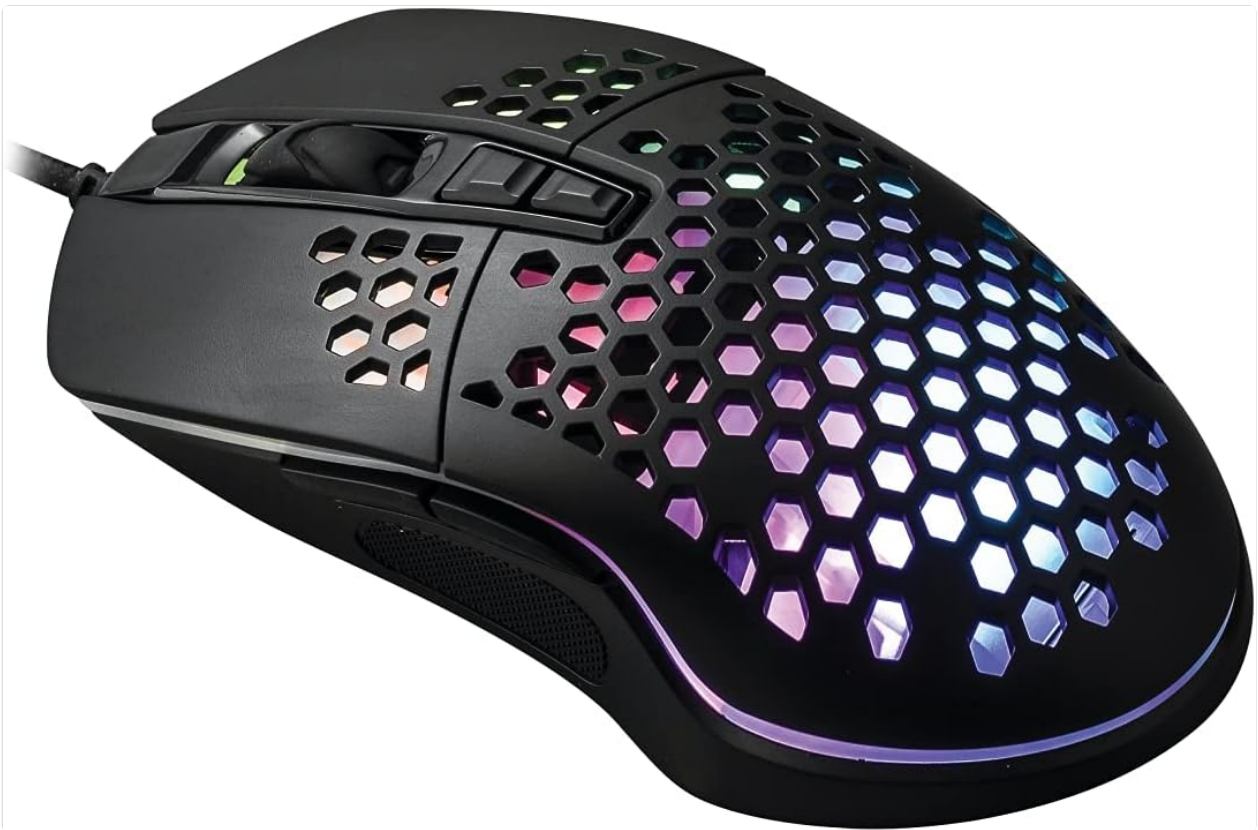
Image 1.1: The Volcano VX Gaming Hades Series Ultra-Lightweight Gaming Mouse, showcasing its ergonomic design and honeycomb shell.