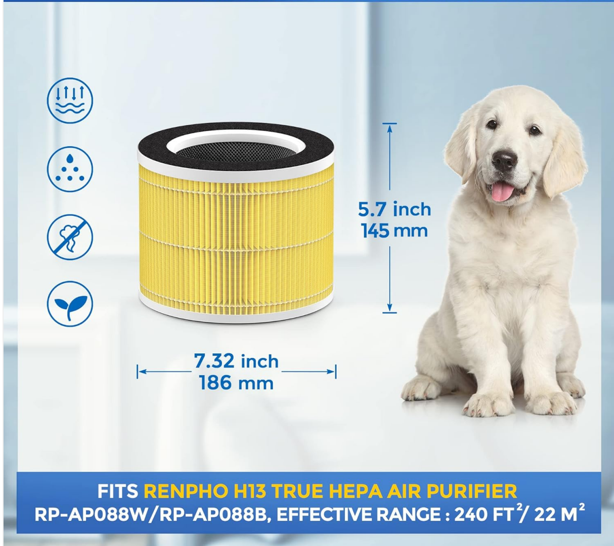
Figure 7.1: Filter dimensions for compatibility verification.