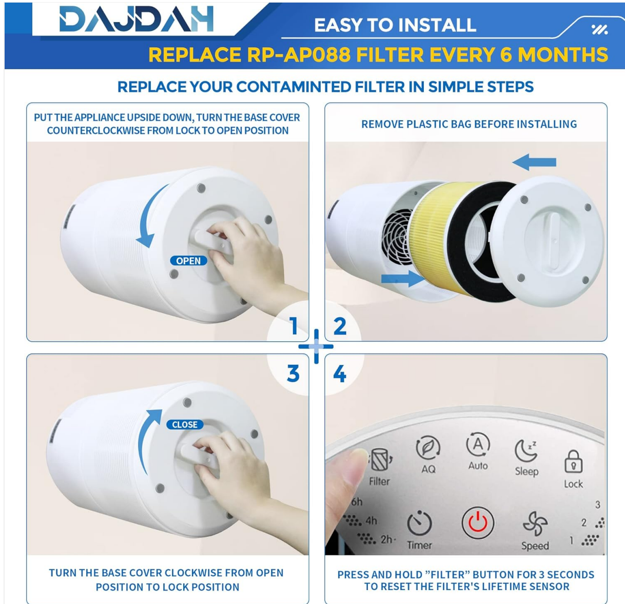
Figure 3.1: Step-by-step guide for filter replacement.