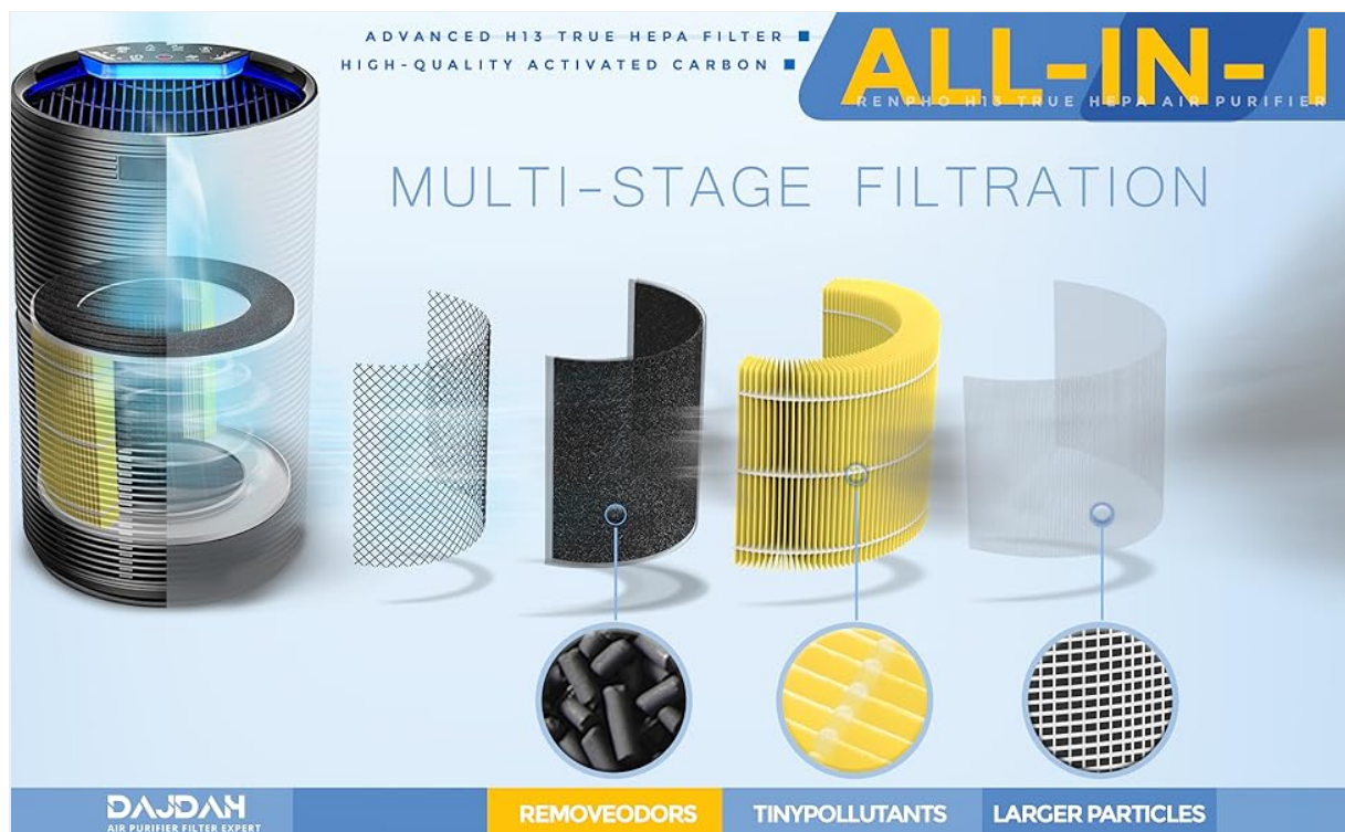
Figure 2.2: Different filter versions and their targeted applications, including pet dander and odors.