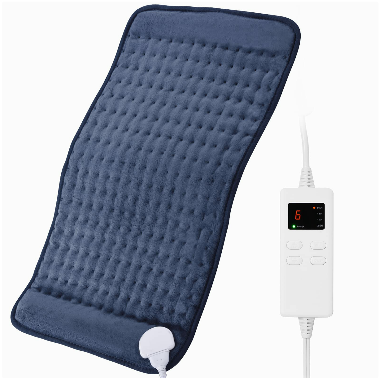
The tobeto Electric Heating Pad provides soothing heat for various body parts.