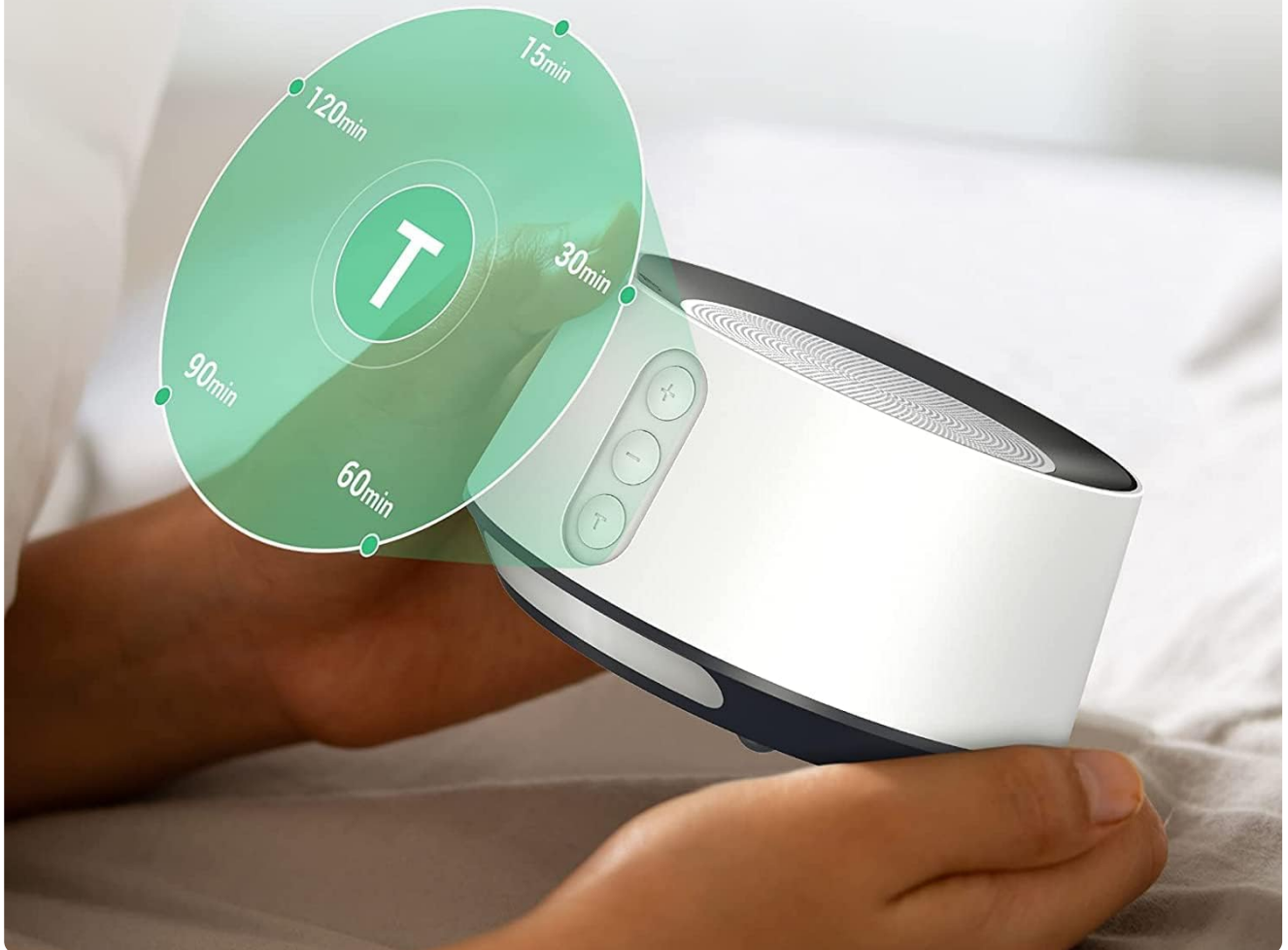
Figure 2.4: Illustration of the auto-off timer options for customized use.