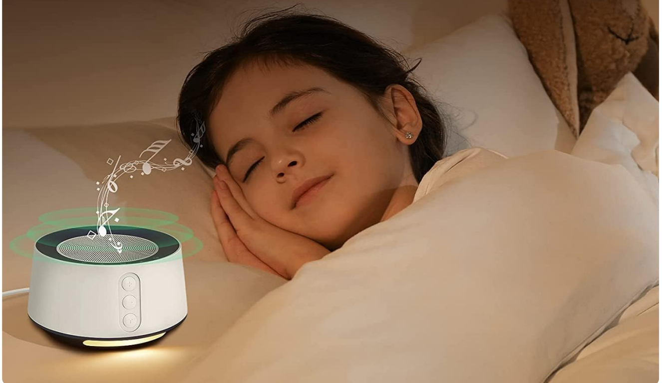
Figure 2.2: The white noise machine providing a calming environment for a sleeping child.