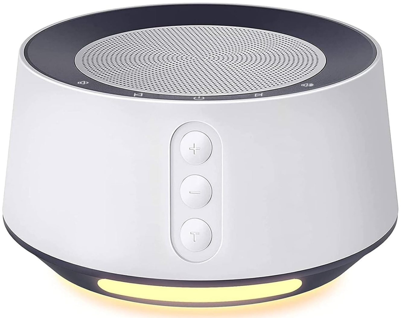
Figure 2.1: Front view of the FITNIV White Noise Machine, showing the speaker grille and control buttons.