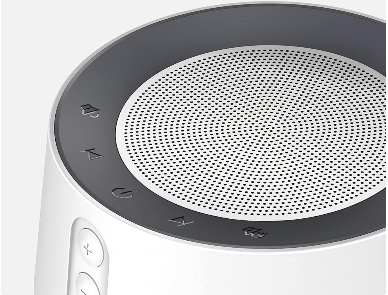
Figure 2.5: The sensitive touch buttons on the top panel for easy control.