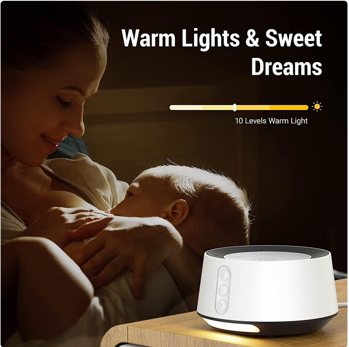
Figure 2.3: The adjustable night light feature, useful for nighttime nursery activities.