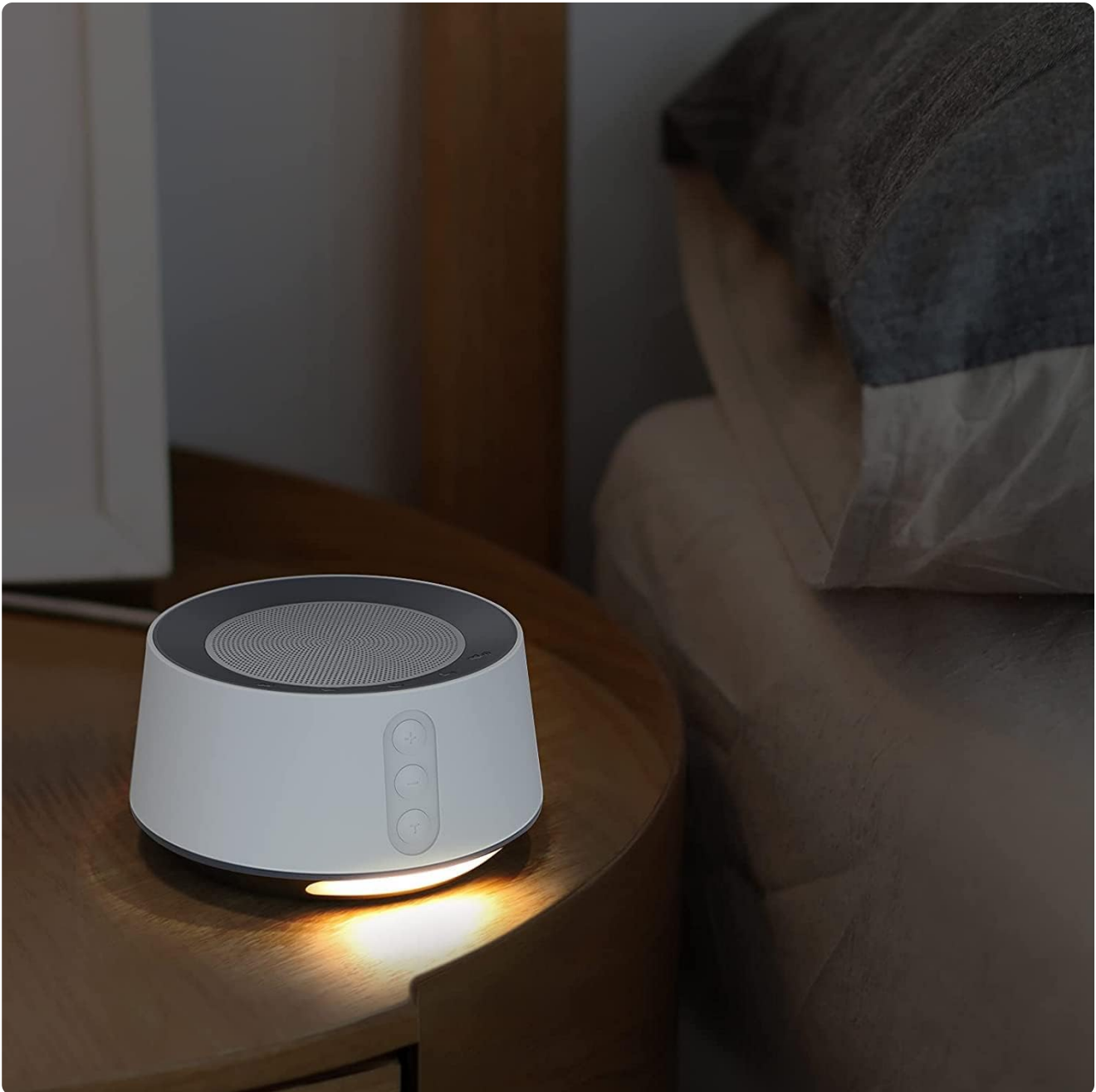
Figure 2.6: The device is powered via a standard electrical outlet using the provided adapter.