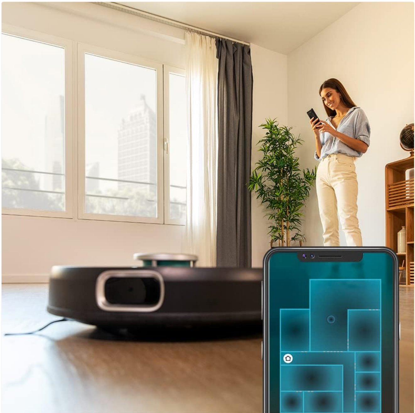
Figure 2.2: A user viewing the cleaning map and controls on the Conga smartphone application, demonstrating remote control capabilities.