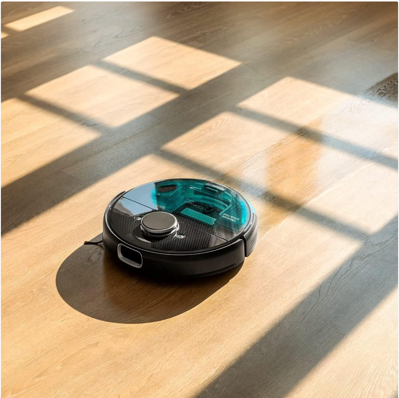
Figure 3.1: The robot vacuum cleaner in operation on a wooden floor, demonstrating its compact design and ability to navigate open spaces.

The robot offers three suction powers (high, medium, low) and three scrubbing levels for wet wiping. These can be adjusted via the smartphone app to suit different cleaning needs and floor types.