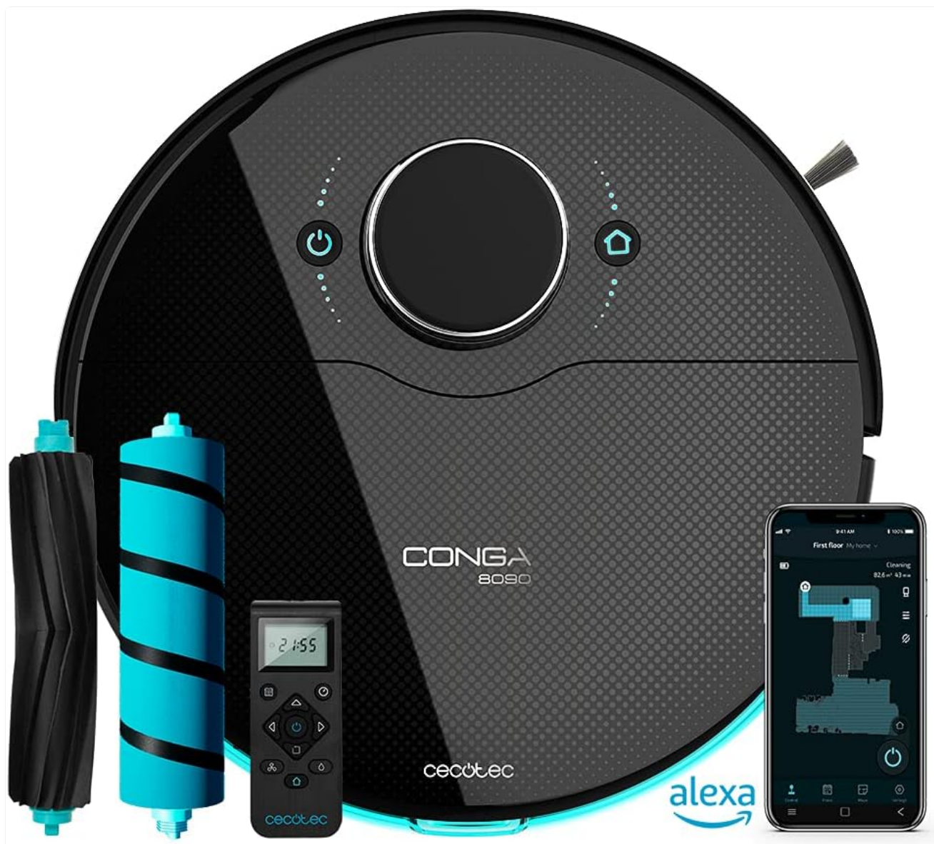
Figure 1.1: The Conga 8090 Ultra robot vacuum cleaner, showcasing its main unit, interchangeable brushes, remote control, and the accompanying smartphone application interface.