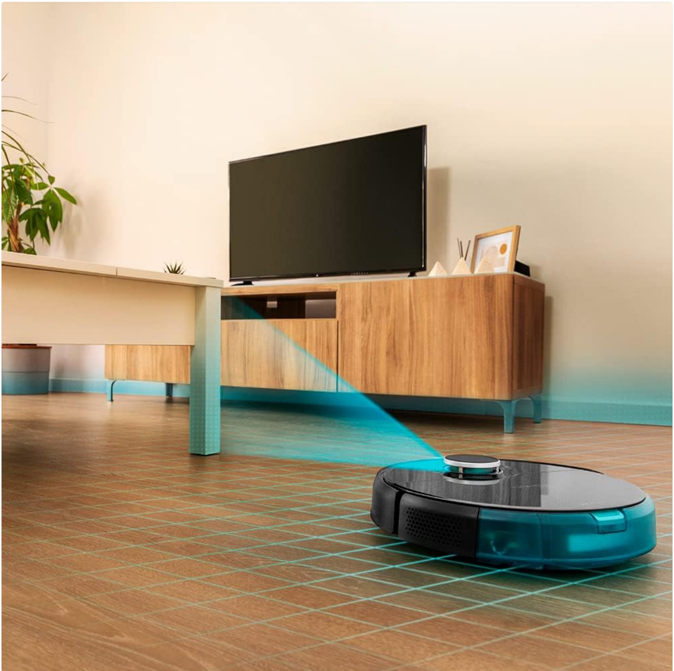
Figure 2.3: The robot vacuum cleaner actively mapping its surroundings using its laser navigation system, indicated by a blue light projection.