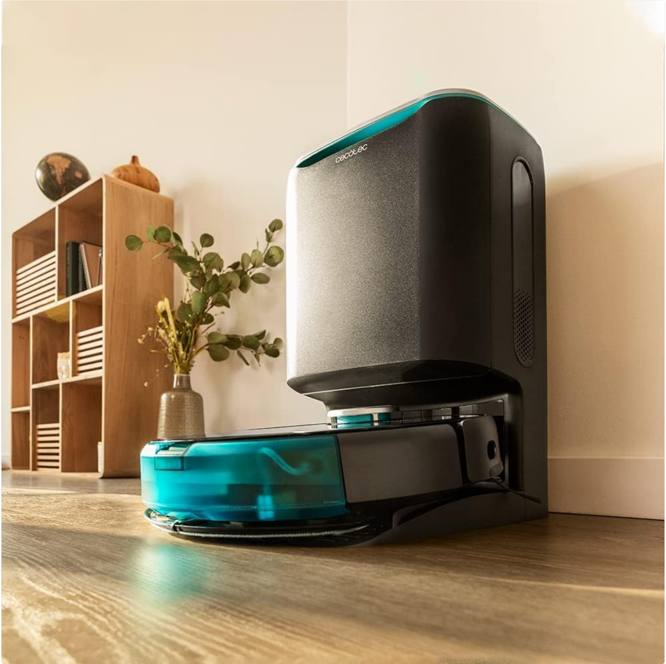
Figure 2.1: The robot vacuum cleaner docked at its charging station, ready for or undergoing charging.

Place the charging base against a wall in an open area, ensuring there are no obstacles within 1 meter to each side and 2 meters in front of the base. Connect the power adapter to the charging base and plug it into a power outlet. Place the robot onto the charging base, ensuring the charging contacts align. The robot will indicate charging status. For first use, fully charge the robot before operation.