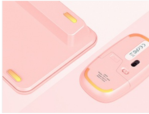
Image: Side profile views of both the PEIOUS mouse and keyboard, emphasizing their ergonomic contours and the keyboard's adjustable tilt for enhanced user comfort.

width) and the mouse (4 inches length, 2.2 inches width, 1 inch height).