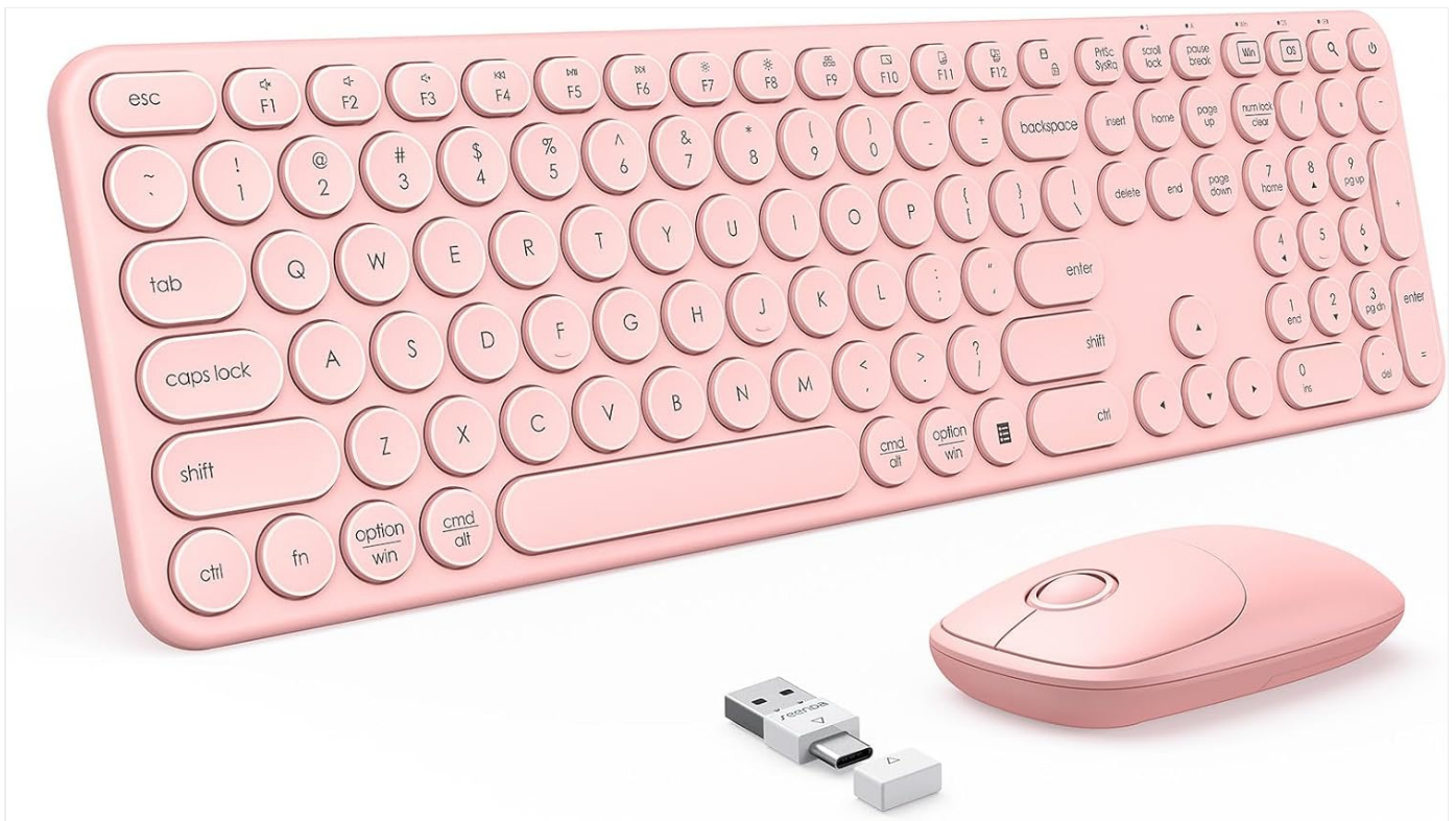
Image: The complete PEIOUS Wireless Keyboard and Mouse Combo in pink, including the keyboard, mouse, and the compact dual USB receiver.