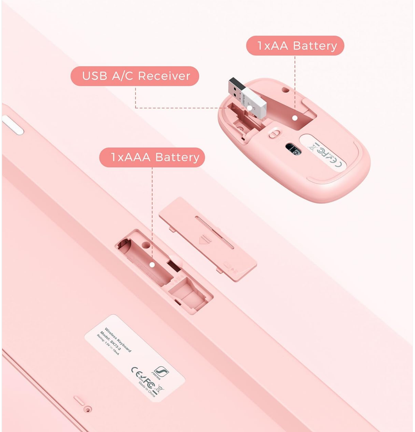
Image: A detailed view showing the battery compartments for both the keyboard (requiring 1 AAA battery) and the mouse (requiring 1 AA battery), along with the location of the USB receiver inside the mouse.