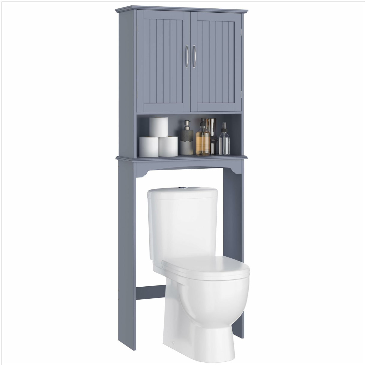
Figure 1: Fully assembled Yaheetech Over-the-Toilet Bathroom Cabinet.