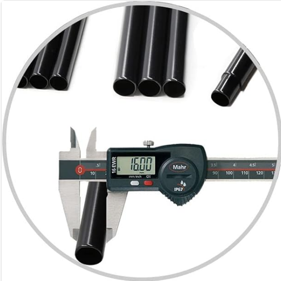
Thickend 16mm diameter metal tube