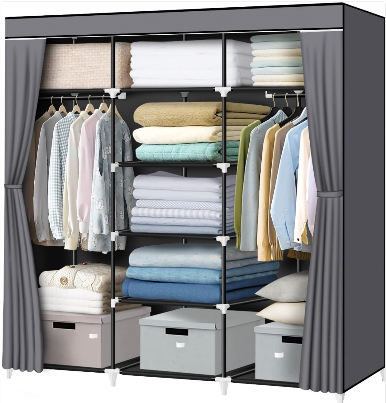
Figure 1.1: Fully assembled LOKEME Portable Closet with fabric cover.