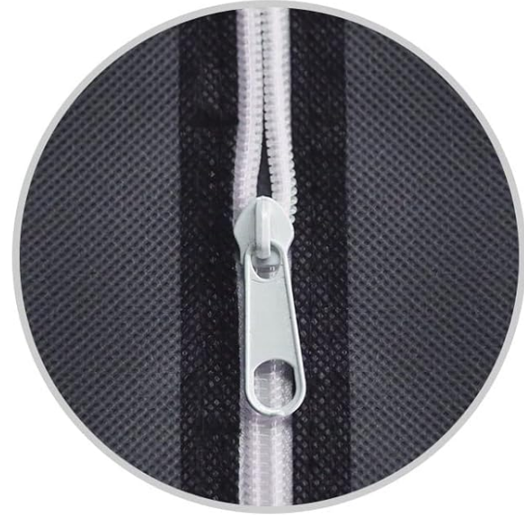
Sturdy T-shaped zipper