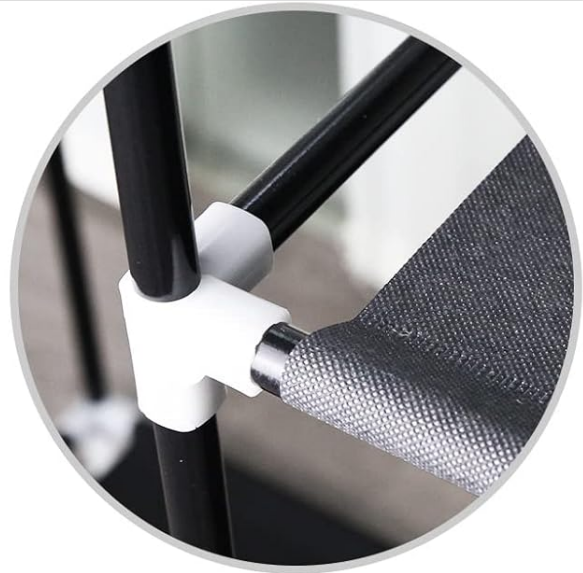
Quality plastic connectors