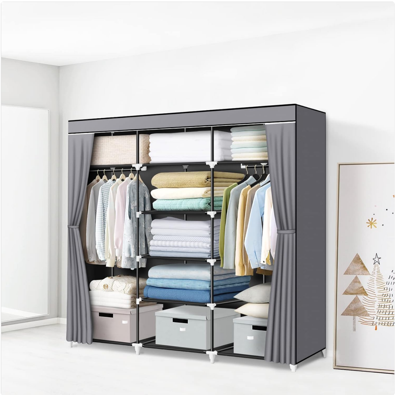
Figure 4.1: Portable closet in a typical room setting, demonstrating its storage capacity.