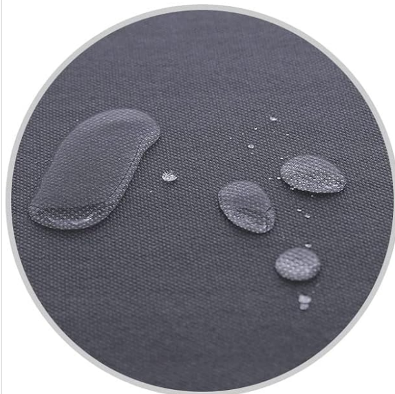
Waterproof fabric tier