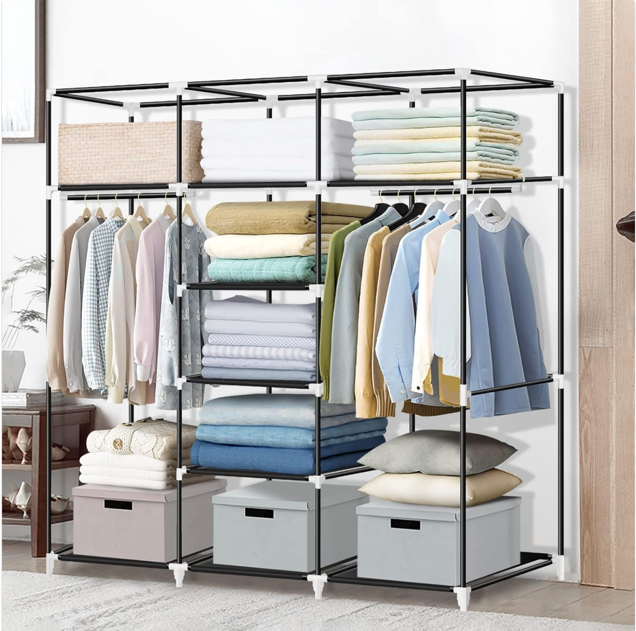
Figure 3.1: Internal frame structure of the LOKEME Portable Closet.