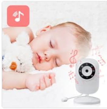
Image: A baby sleeping peacefully with musical notes, illustrating the lullaby feature.