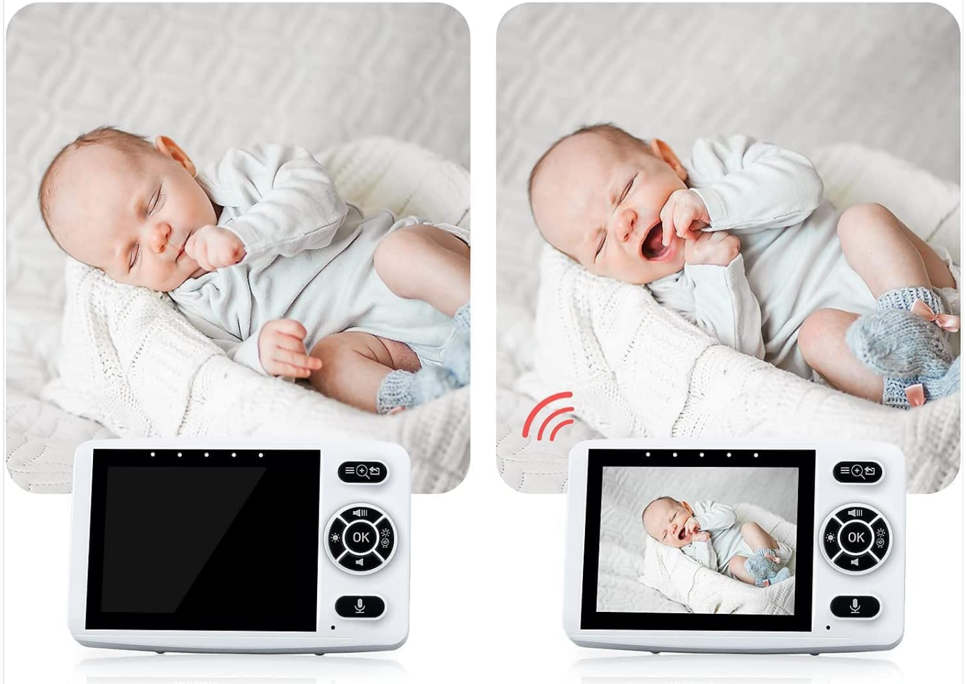
Image: A comparison showing the monitor screen in sleep mode and then automatically waking up when the baby makes a sound, demonstrating the VOX function.

The volume from baby's end reach a certain level, the monitor will be triggered to inform parents.