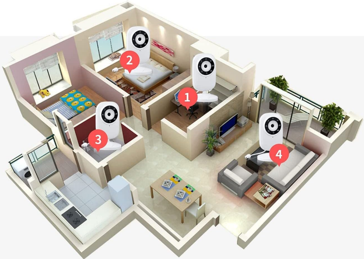
Image: A diagram illustrating how one parent monitor can connect to and switch between up to four baby camera units in different rooms.