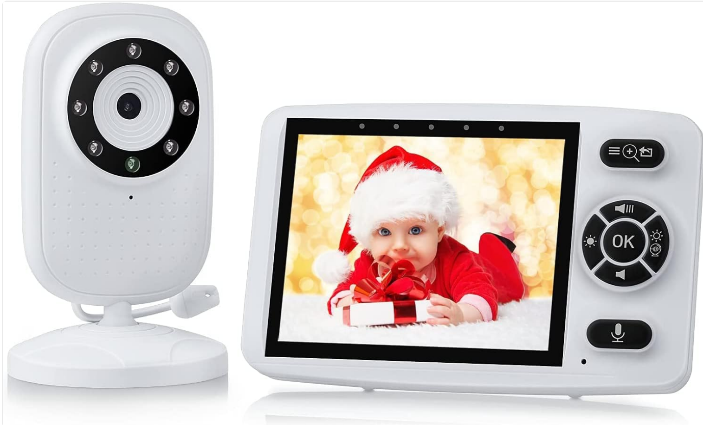
Image: The EYETOO Baby Monitor system, showing the camera unit and the parent monitor unit.

Thank you for purchasing the EYETOO Baby Monitor. This 3.5-inch HD screen video baby monitor provides a secure and private way to monitor your baby, featuring 2.4GHz wireless transmission, two-way talk, infrared night vision, VOX mode, temperature monitoring, and lullabies. Please read this manual carefully before use to ensure proper operation and safety.