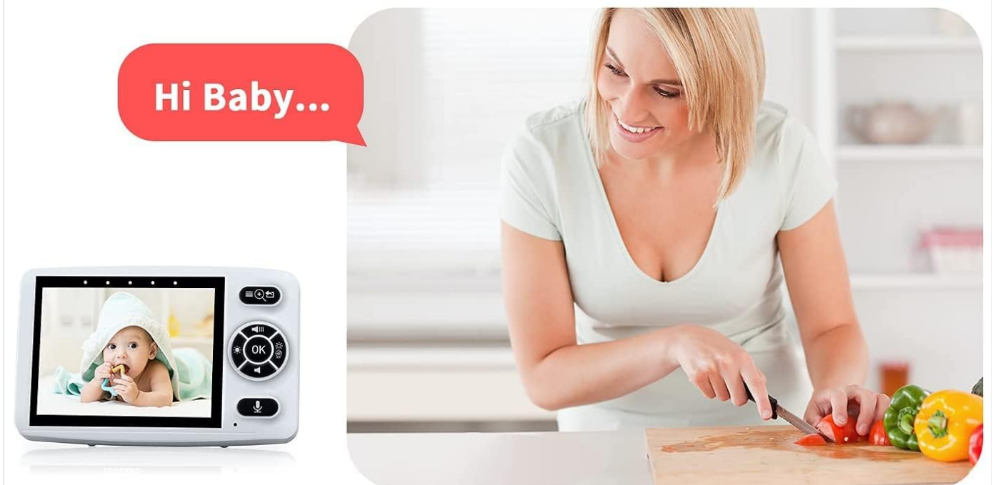
Image: A visual representation of the two-way audio talk feature, showing a baby and a parent communicating through the monitor.

Talk with your baby anywhere and anytime, as if stay with him all the time.