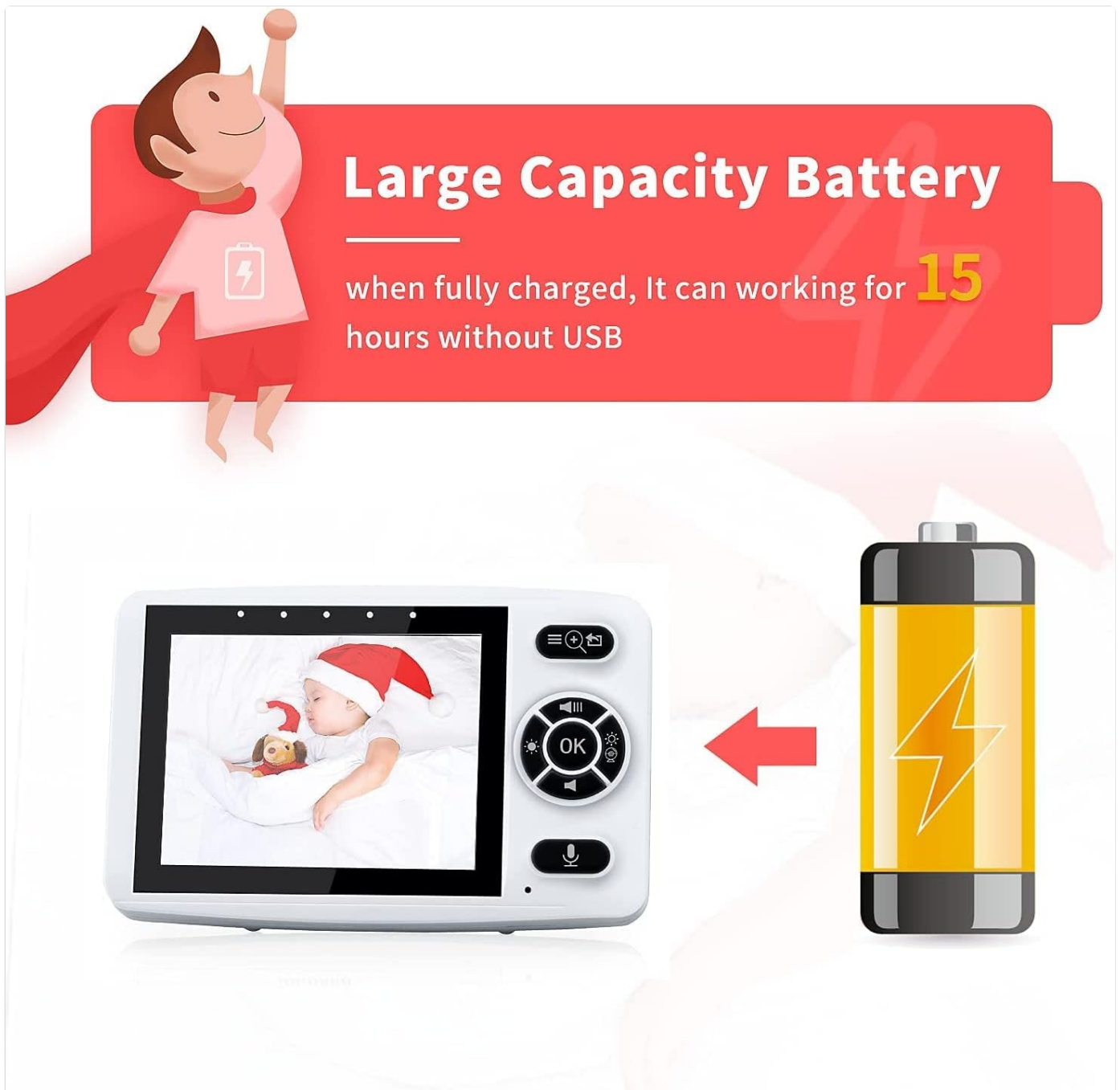
Image: The parent unit connected to its power adapter, illustrating its long battery life.