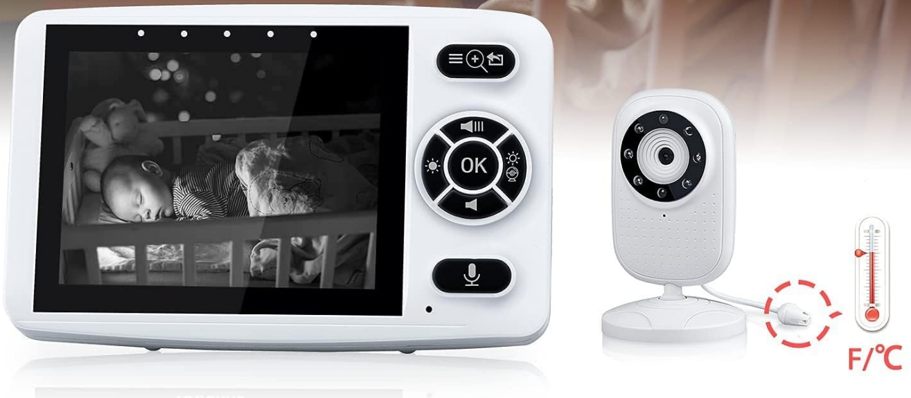
Image: The baby unit camera demonstrating its high-resolution night vision and integrated room temperature monitor.