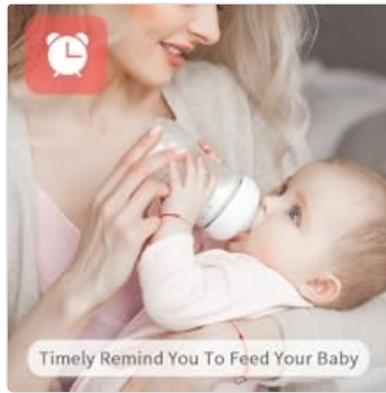
Image: A parent feeding a baby, accompanied by a clock icon, signifying the feeding reminder function.