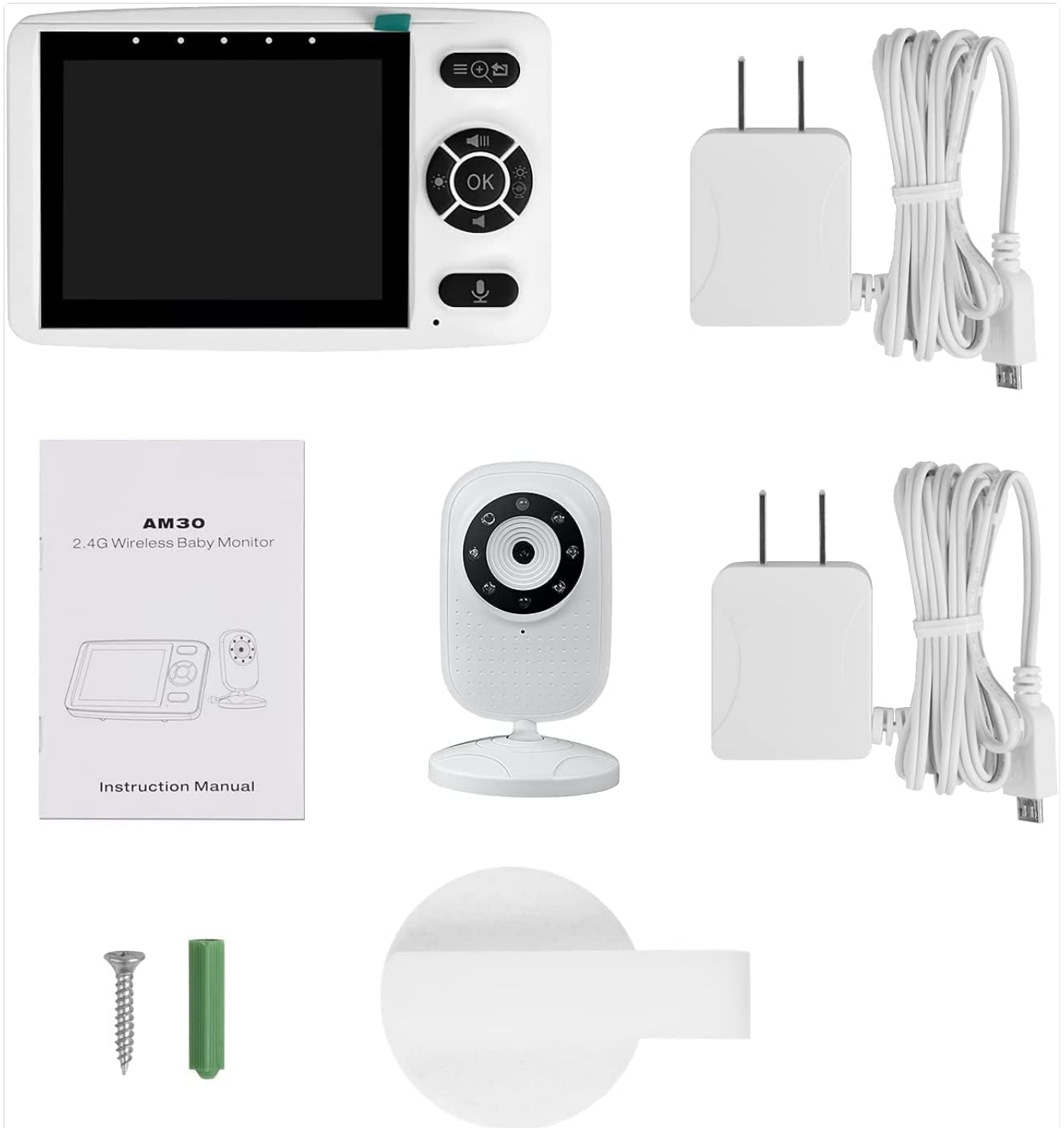
Image: Contents of the product package, including the monitor, camera, power adapters, and manual.