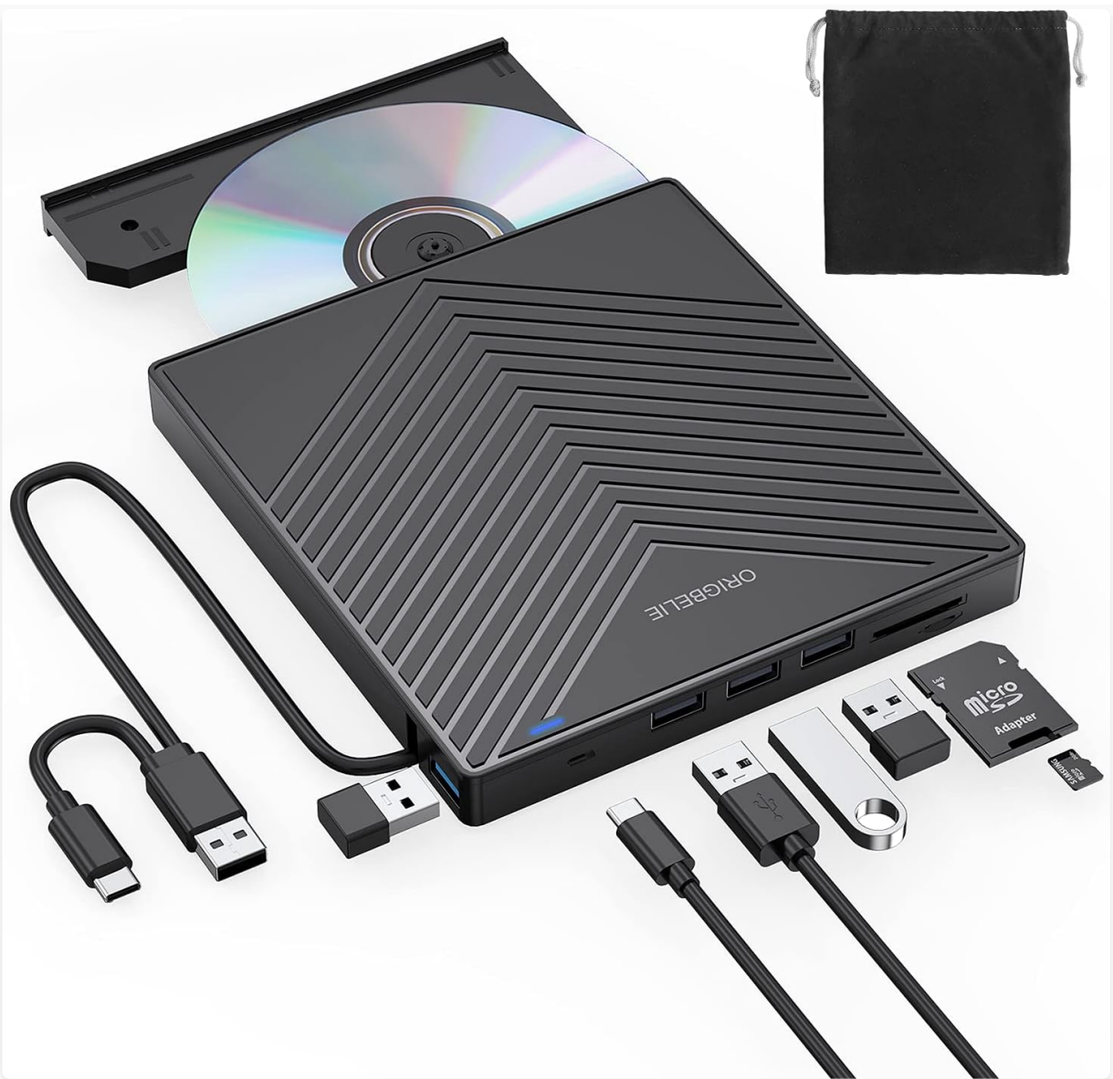
The ORIGBELIE External CD/DVD Drive, showcasing its sleek design and included accessories.