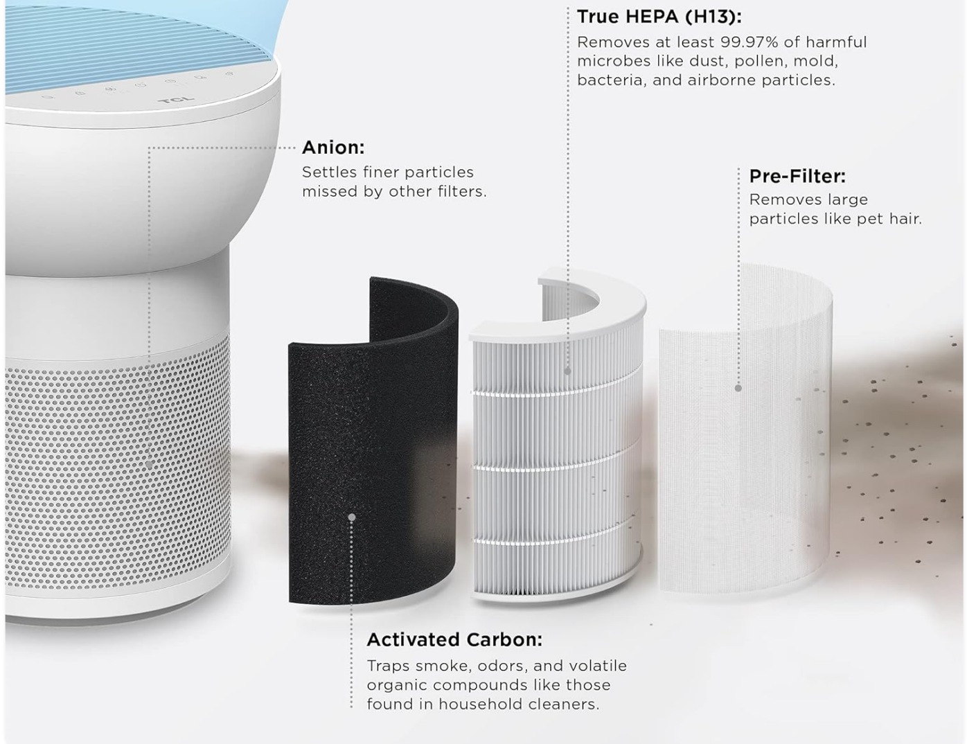
Image: A visual breakdown of the Breeva Shield 4-stage filtration process, detailing the function of each filter layer from pre-filter to anion technology, and the types of pollutants they target.