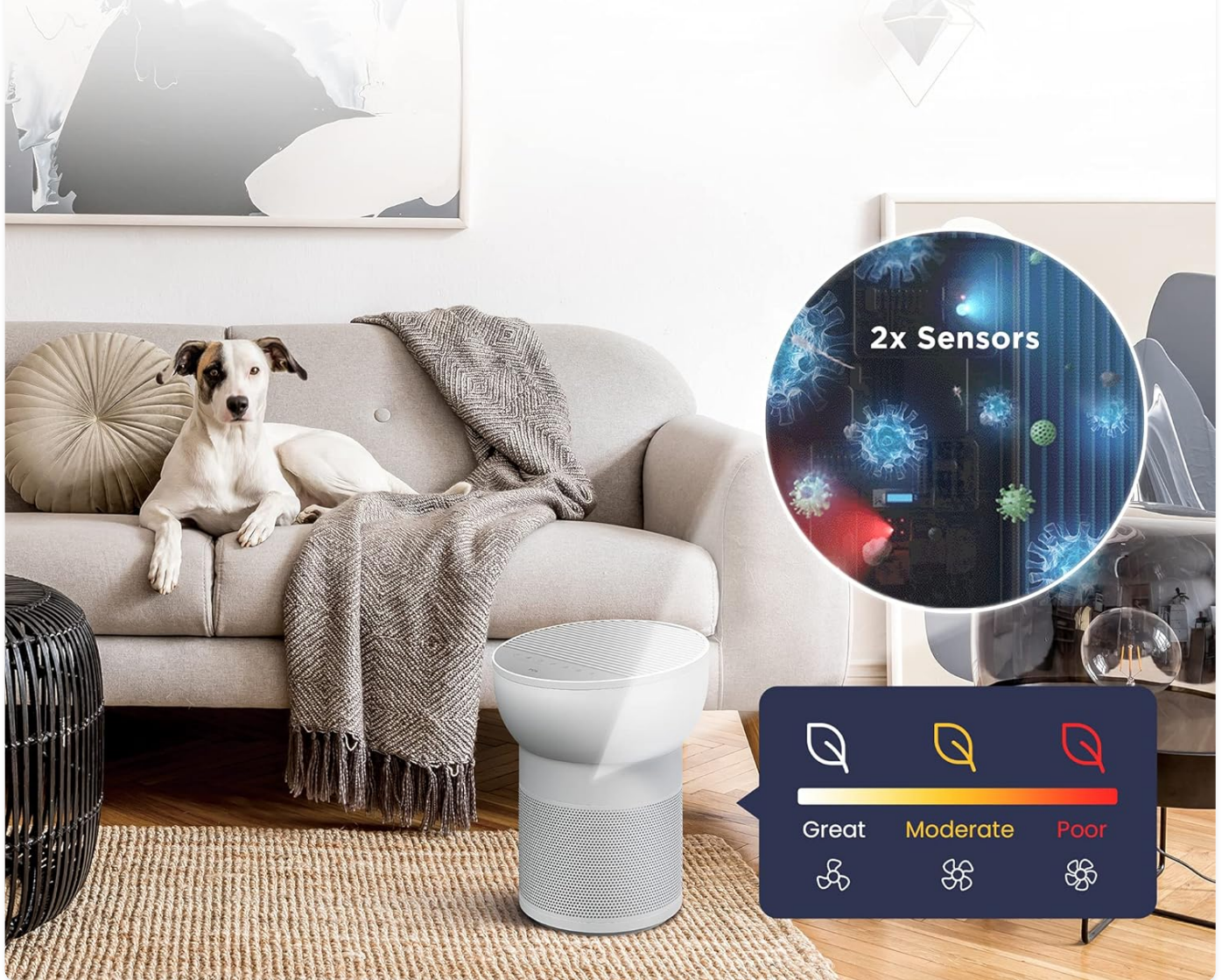
Image: The Breeva A2 in a living room, demonstrating its Auto Shield mode with dual sensors that continuously monitor air quality and automatically adjust fan speed for optimal purification.

Breeva A2 automatically measures the air quality in your home and adjusts the fan speed to protect you and your family using advanced air quality sensors.