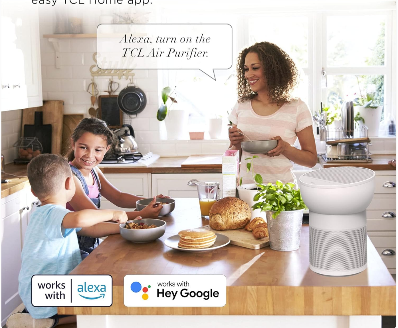
Image: The TCL Breeva A2 in a kitchen setting, illustrating its seamless integration with smart home ecosystems like Alexa and Google Assistant for convenient voice control.