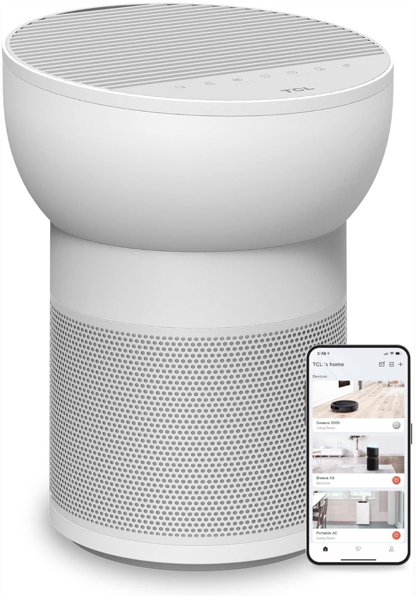
Image: The TCL Breeva A2 Smart Air Purifier, a compact white cylindrical device, shown alongside a smartphone displaying its companion