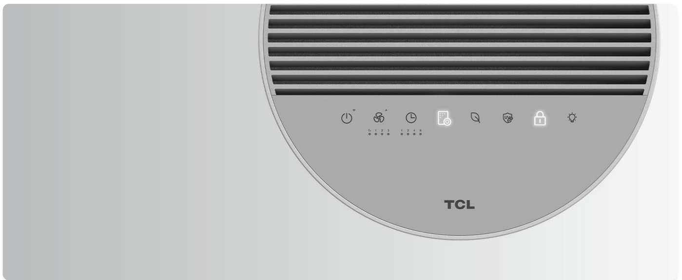
Image: A detailed view of the intuitive touch control panel on the top of the Breeva A2, showing the various function icons for easy manual operation.