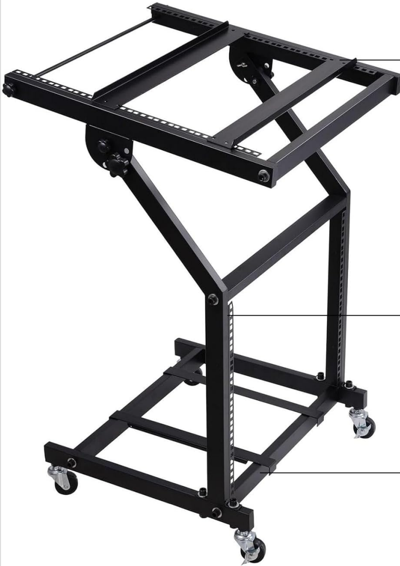
Figure 5.1: Double layer storage design for mixers and other equipment.

Install large equipment here, such as speakers