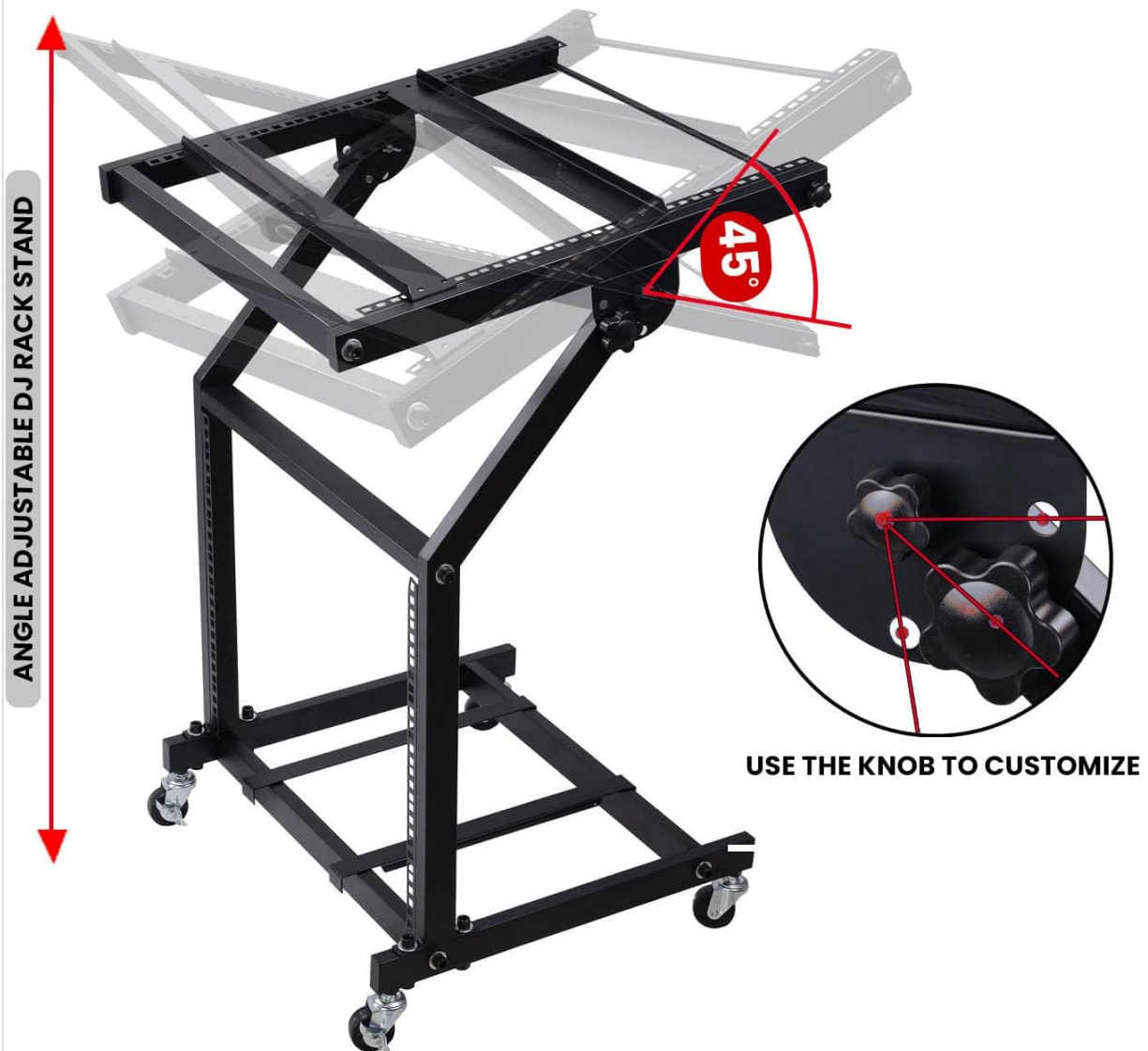
Figure 5.3: Lockable wheels for secure placement.