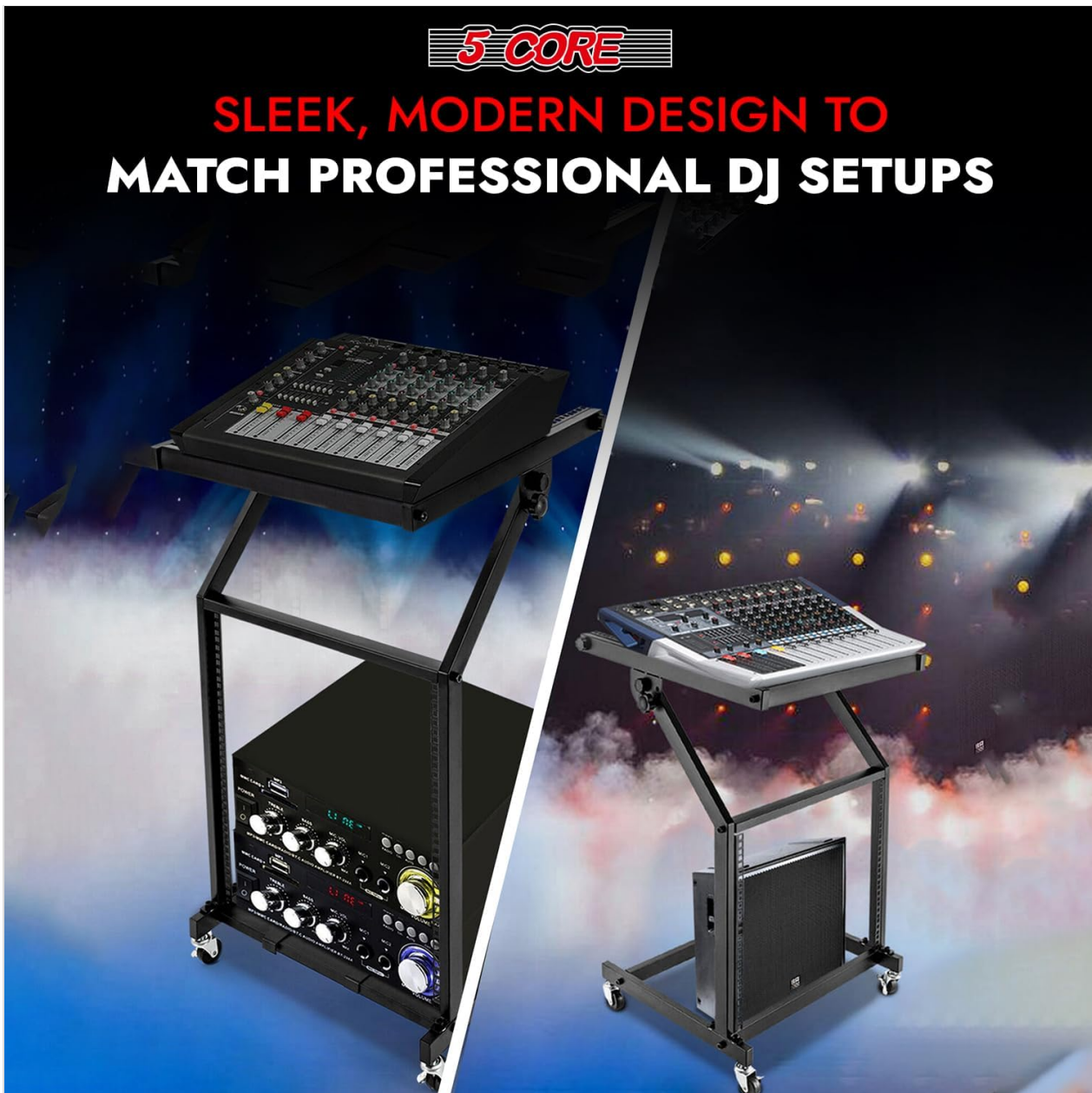
Figure 9.1: Dimension details of the rack stand.