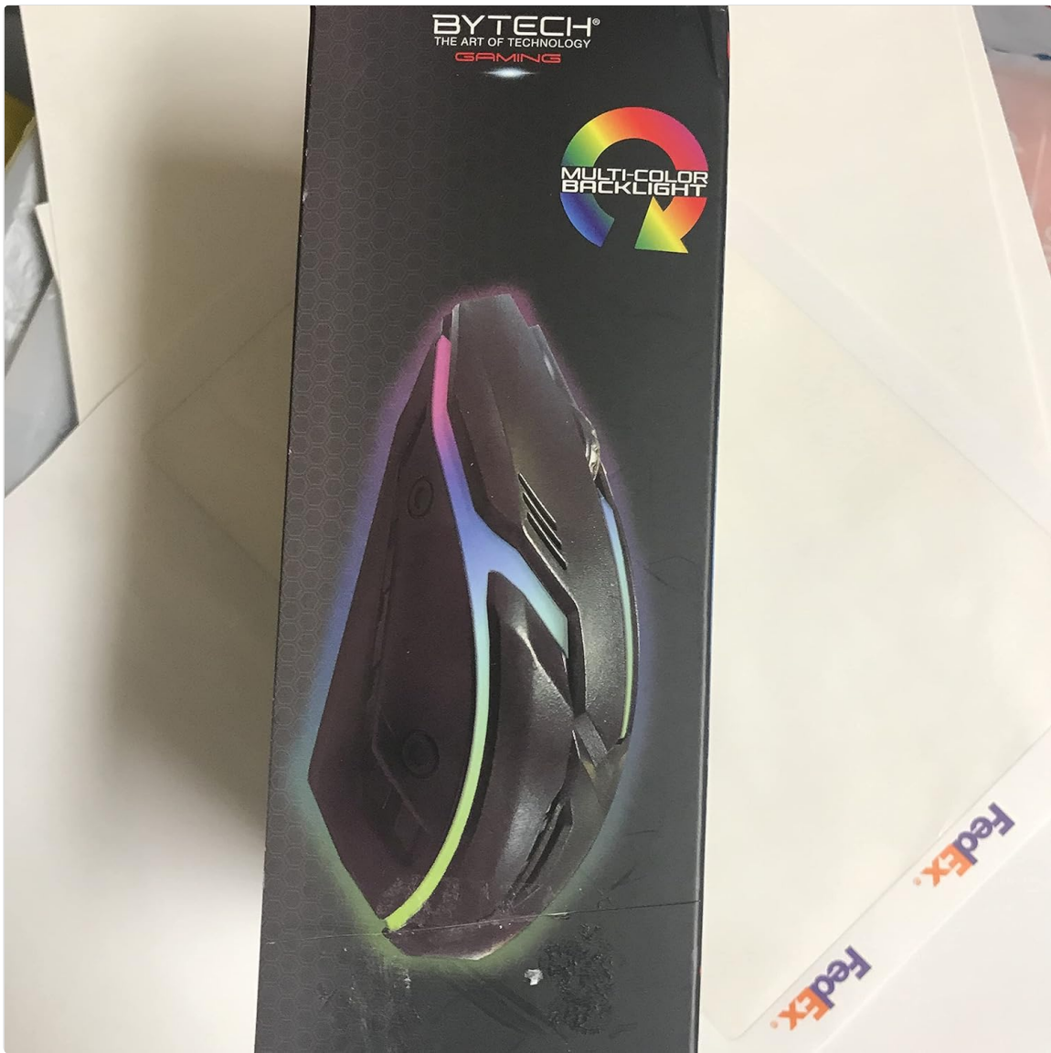
Image: Side view of the Bytech BYMSWR104BK Gaming Mouse retail packaging, showcasing the multi-color backlight effect.