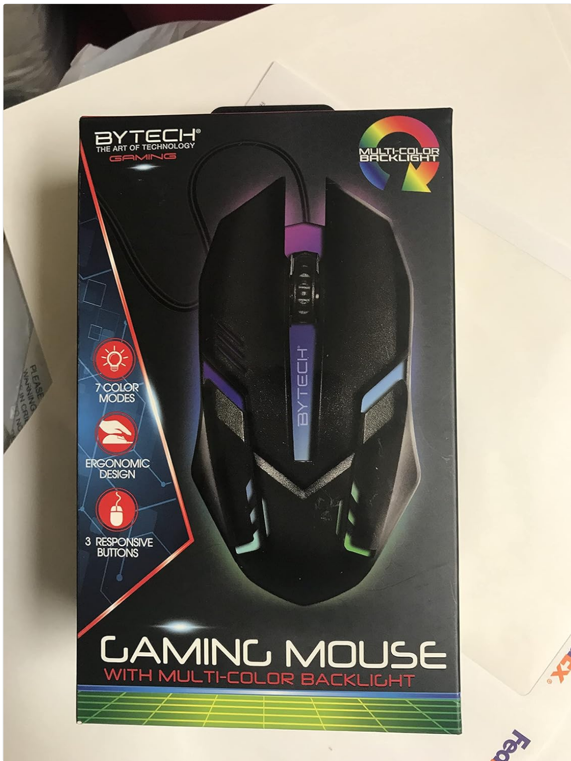
Image: Front view of the Bytech BYMSWR104BK Gaming Mouse in its retail packaging, highlighting its multi-color backlight and ergonomic design.