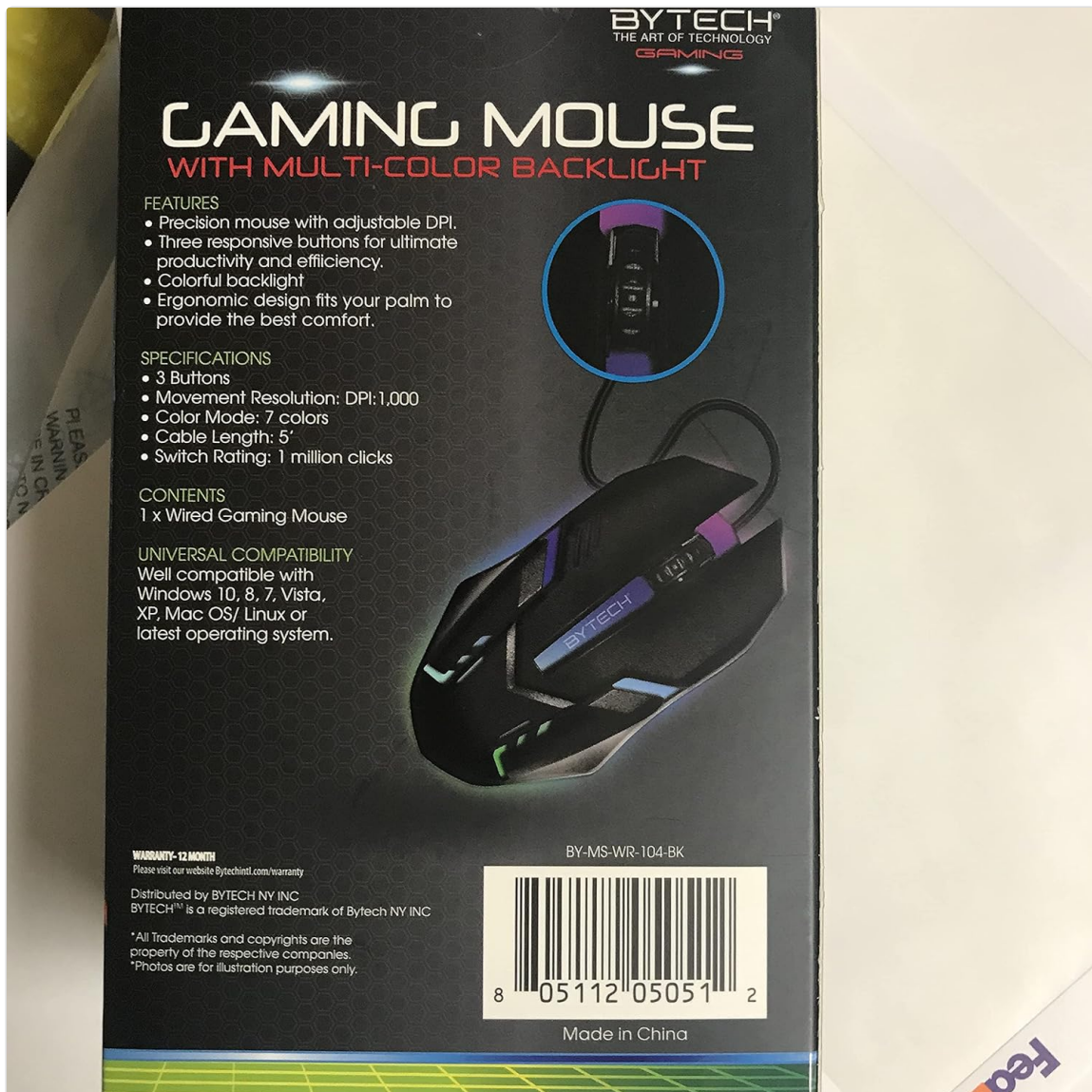
Image: Rear view of the Bytech BYMSWR104BK Gaming Mouse retail packaging, detailing features, specifications, and universal compatibility.