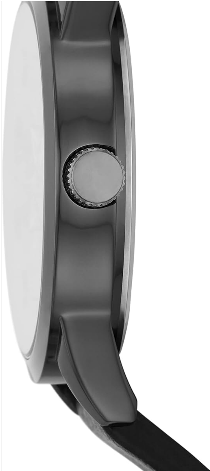
Image: Side view of the watch, highlighting the crown used for setting the time.