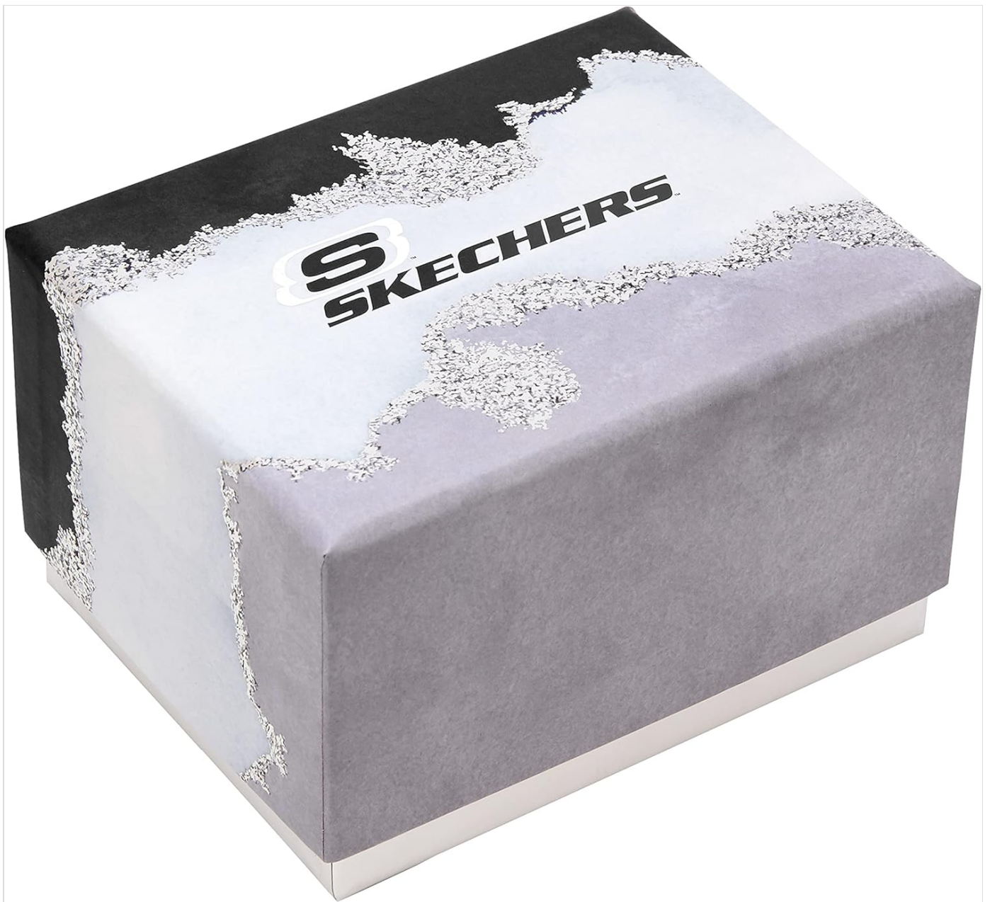
Image: The Skechers watch box, which contains the watch and bracelet accessories.