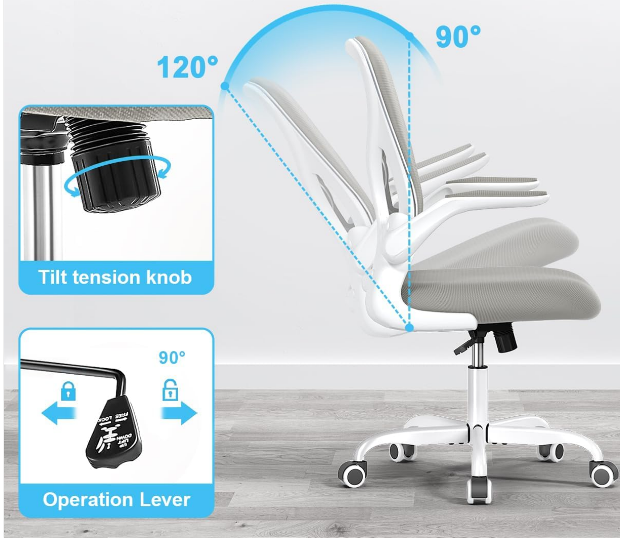
Image: Close-up of the tilt tension knob and operation lever on the Sytas Ergonomic Desk Chair.