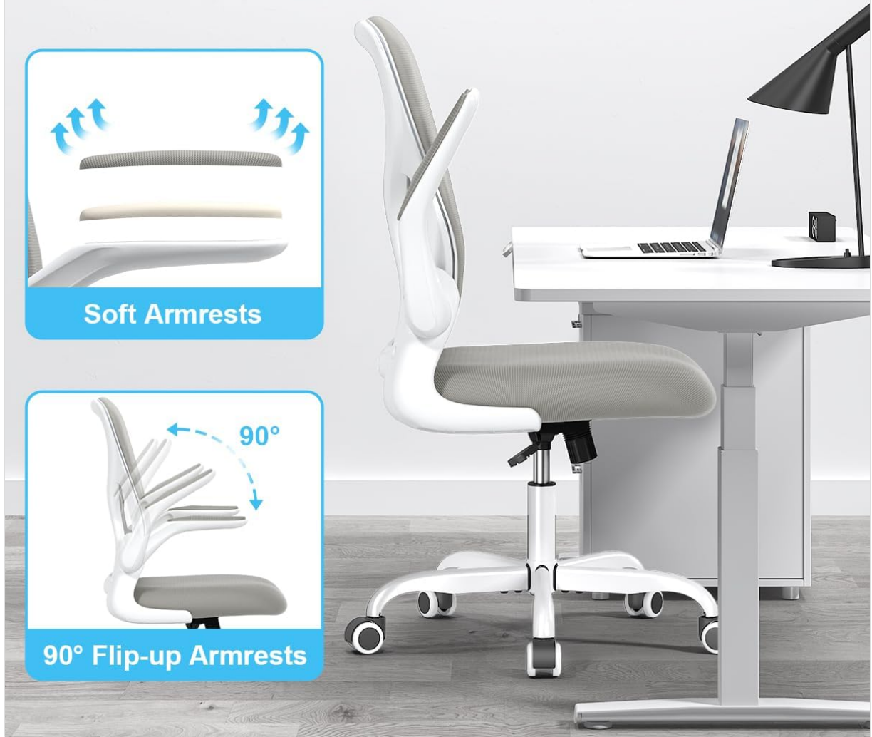
Image: The Sytas Ergonomic Desk Chair demonstrating its adjustable armrests and height adjustment lever.