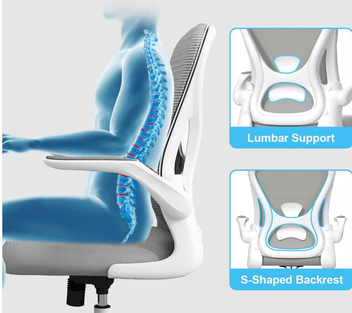
Image: The Sytas Ergonomic Desk Chair highlighting its S-shaped backrest and integrated lumbar support.