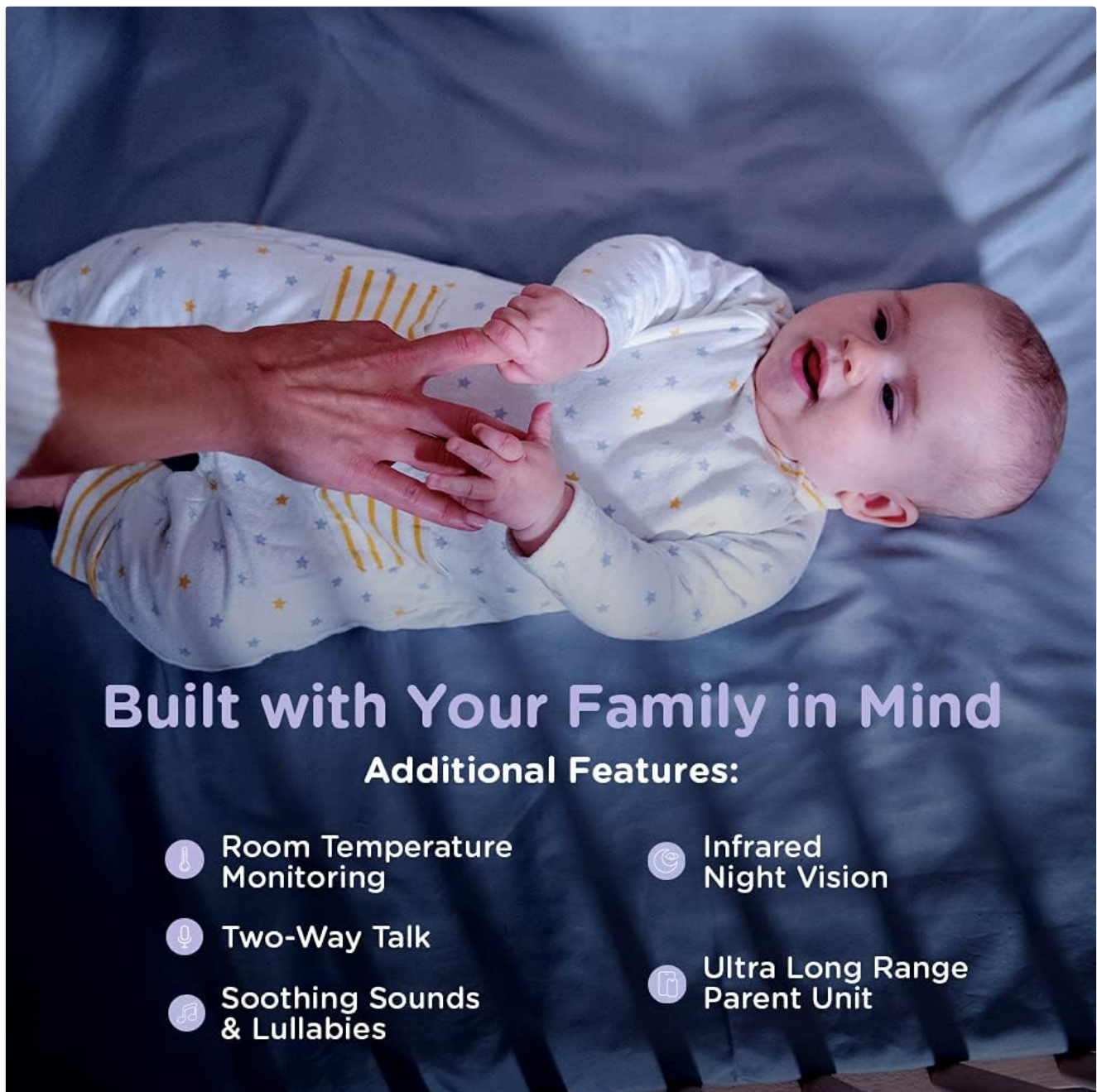
Image: Key features including infrared night vision and room temperature monitoring.