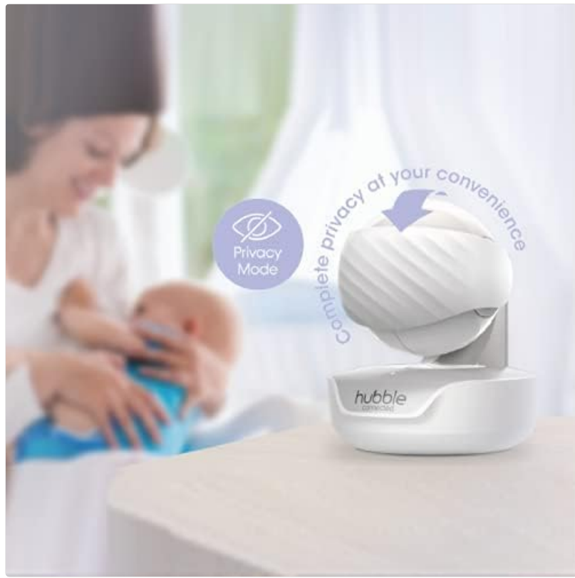
Image: The camera unit demonstrating the manual privacy mode by closing the lens cover.