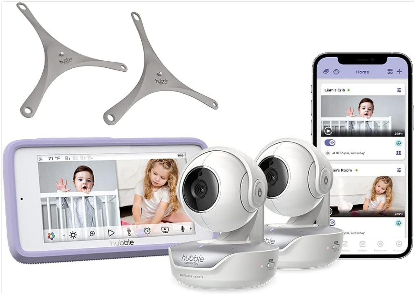
Image: Complete package contents of the Hubble Connect Touch Twin 5-inch Smart Baby Monitor system.