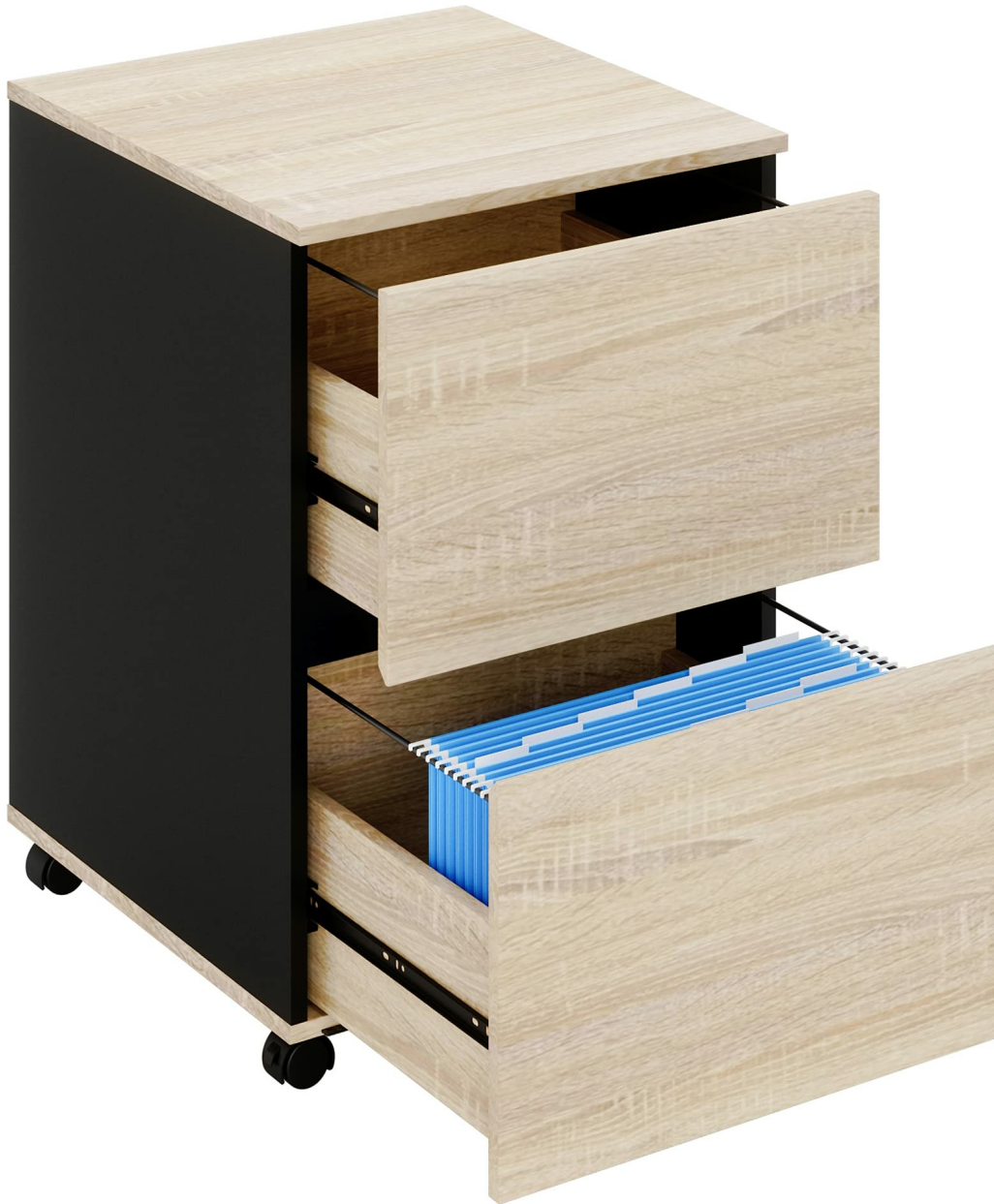
Image: The Bestier 2-Drawer Mobile File Cabinet in an office environment, showcasing its design and mobility.