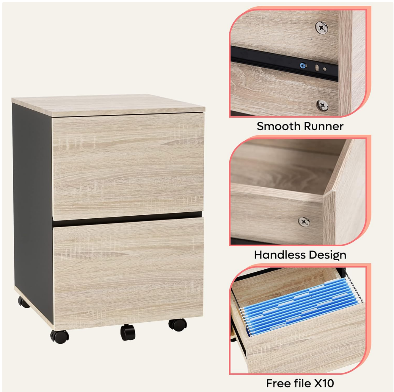
Image: Close-up showing the smooth drawer runners, the integrated handleless design, and the internal file hanging frames with included A4 file holders.