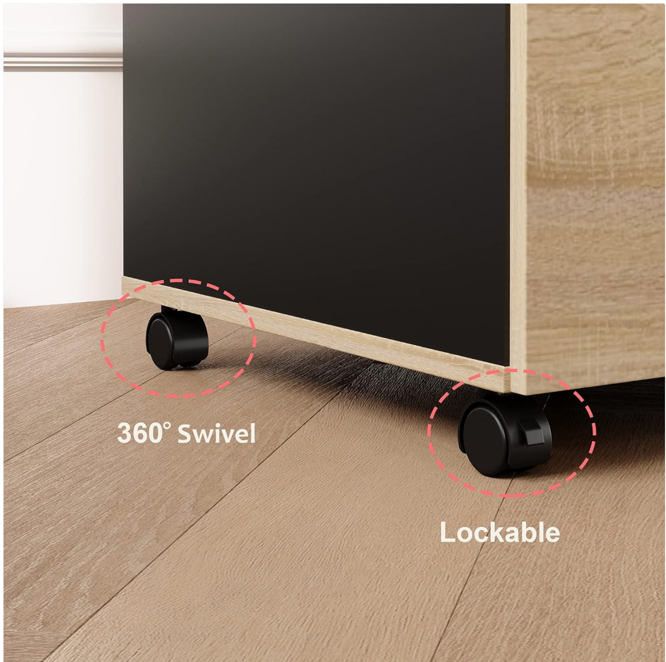
Image: A detailed view of the cabinet's wheels, highlighting their 360-degree swivel capability and the locking mechanism for stability.