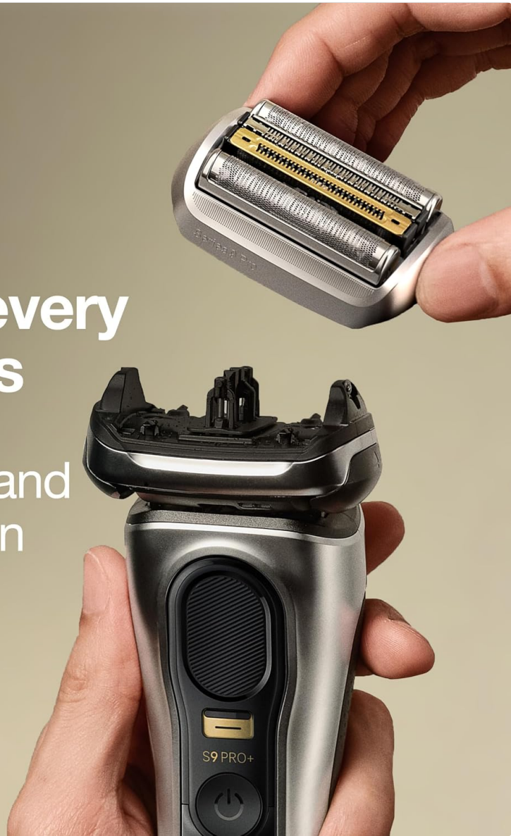
Figure 5: Recommended replacement interval for the shaver head is every 18 months to maintain a close shave and prevent irritation.

Replace every 18 months to maintain close shave and avoid irritation