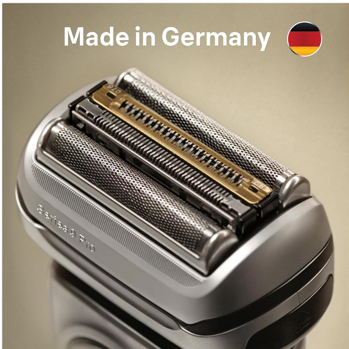
Figure 6: The Braun 94M shaver head is crafted with 100% German quality.