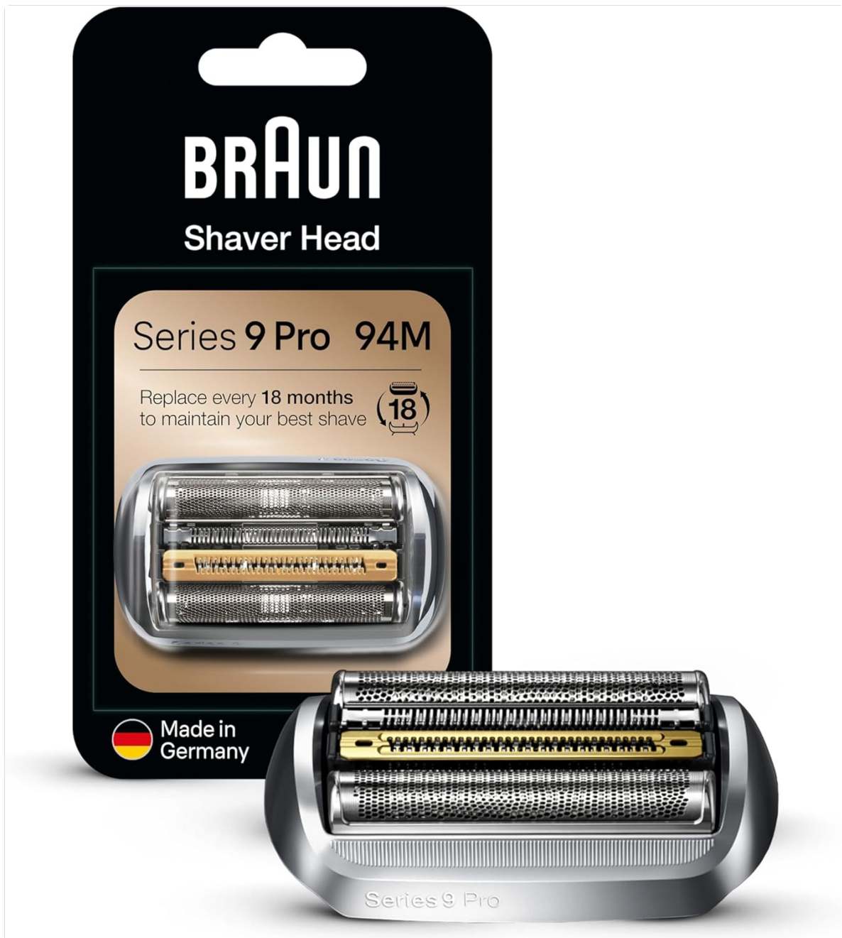
Figure 1: Braun Shaver Head Replacement Part 94M in its retail packaging.