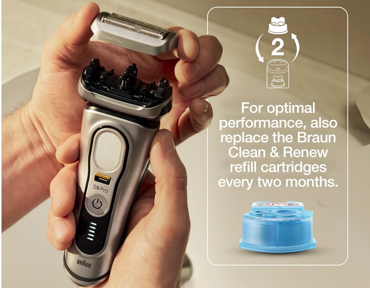
Figure 3: Replacing the shaver head is a simple click-on process.