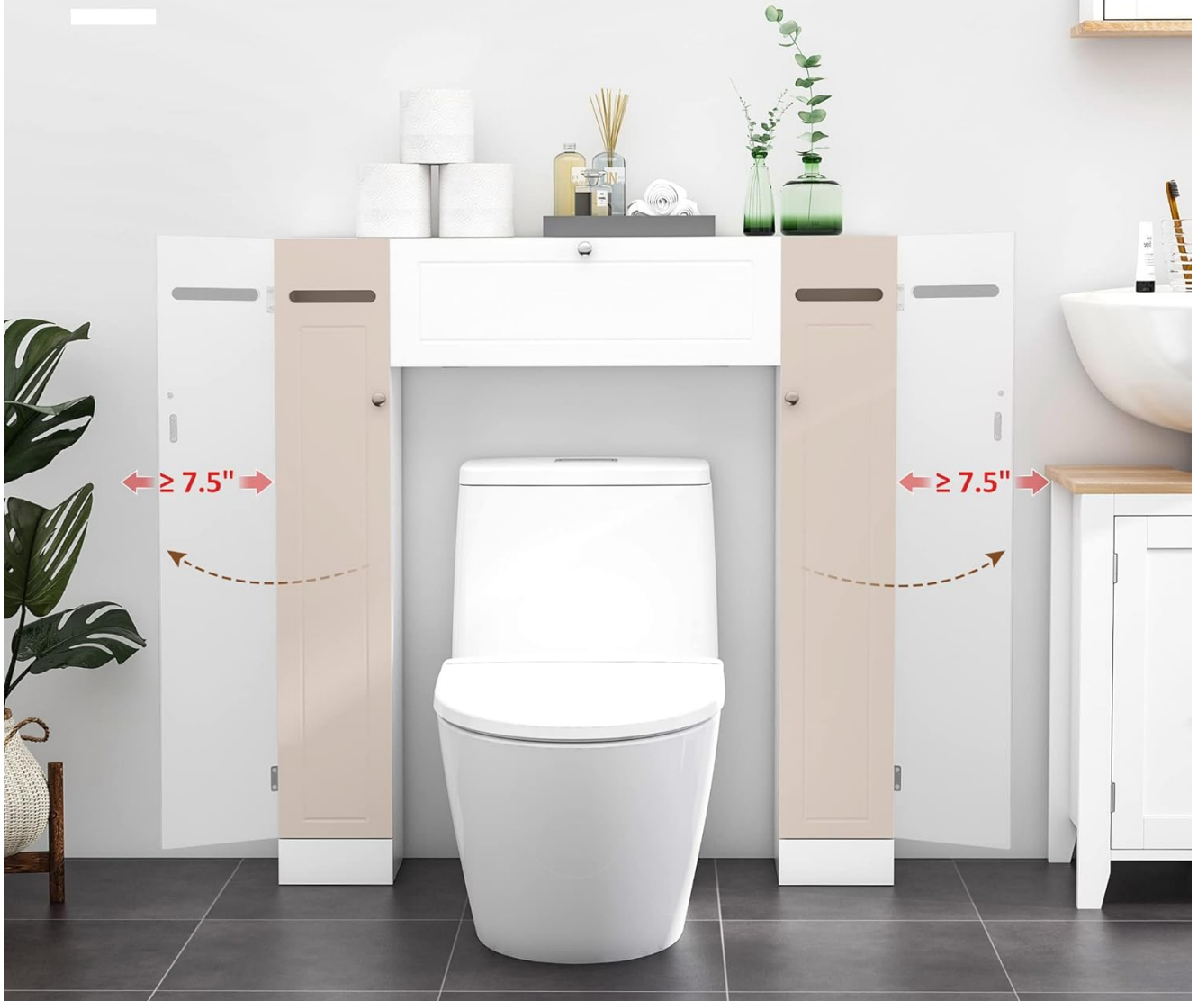
Image: Important note on side clearance for door operation.

7.5" must be reserved on both sides of the cabinet to prevent the cupboard door from hitting the washbasin/bathtub