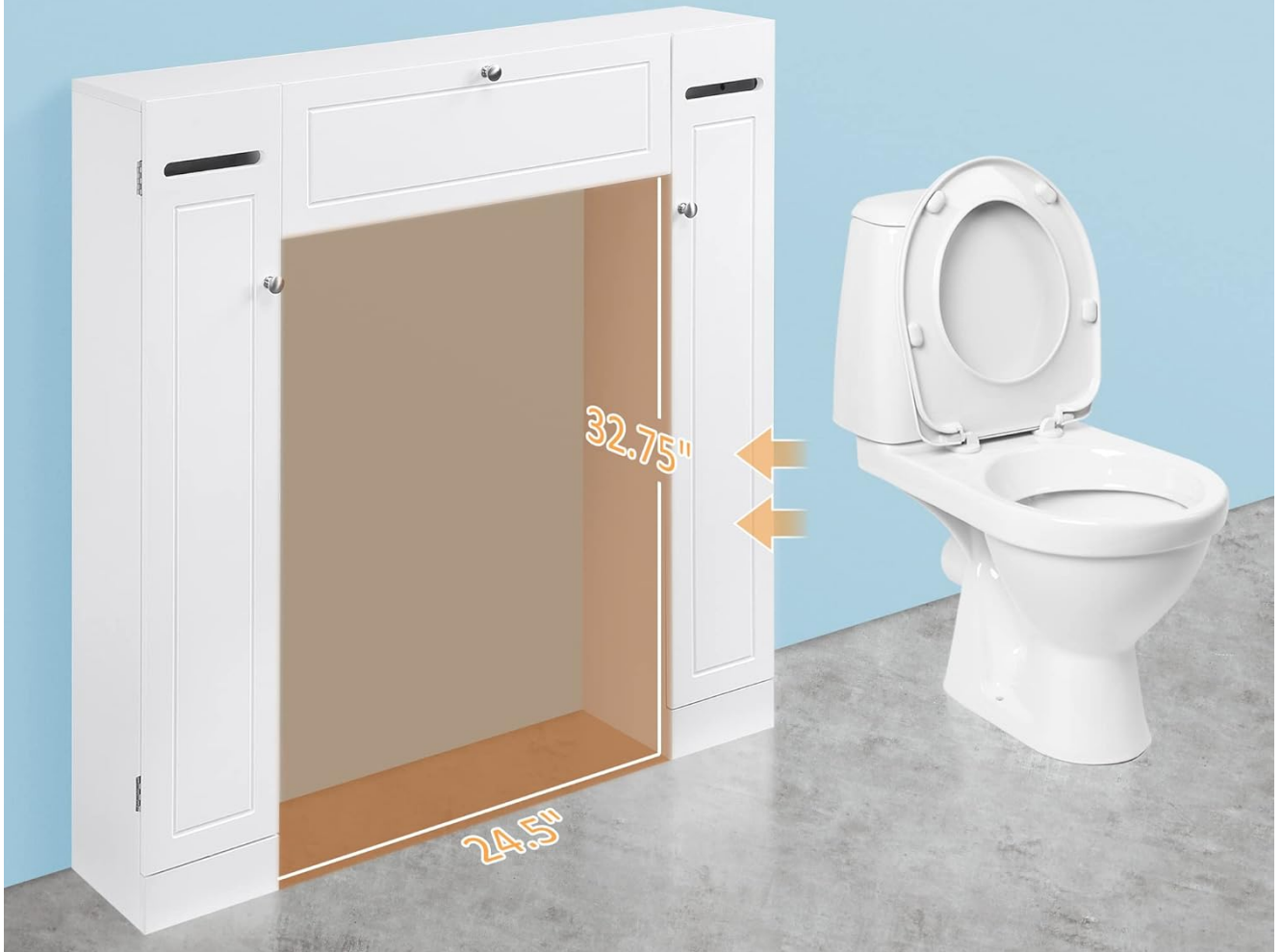
Image: Over-the-toilet design with clearance dimensions.

Check the size carefully before buying to see if it matches the height of your toilet