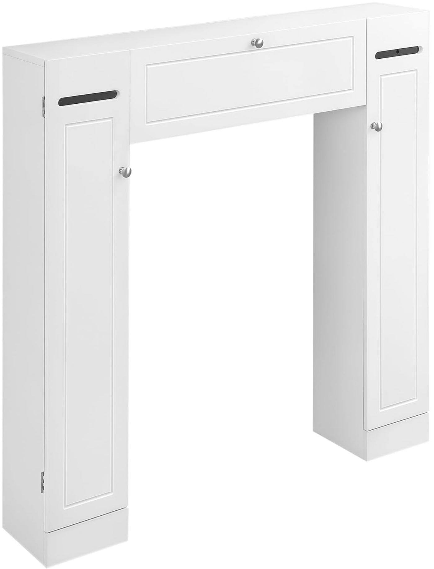
Image: The kleankin Over The Toilet Storage Cabinet.