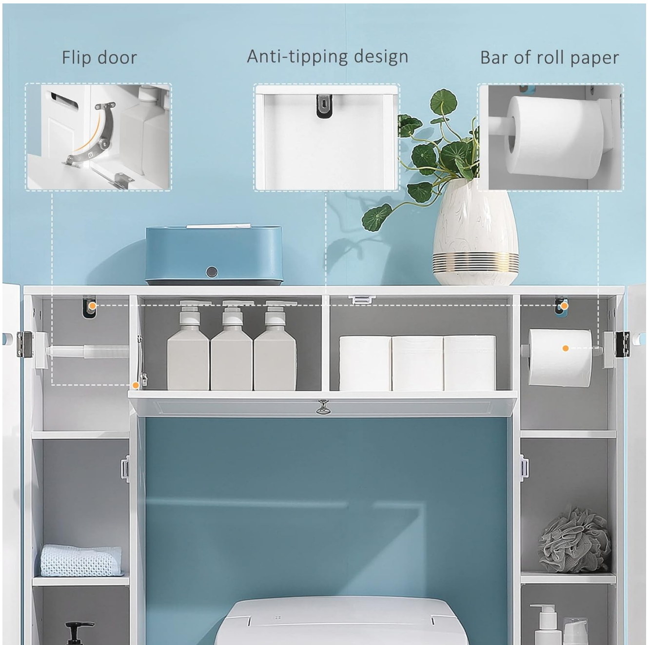
Image: Detail of the anti-tipping hardware.