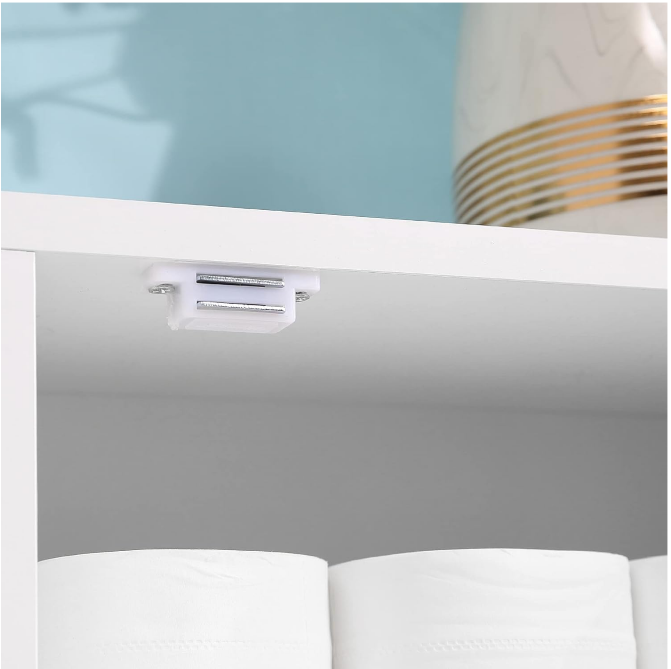
Image: Magnetic door catch.