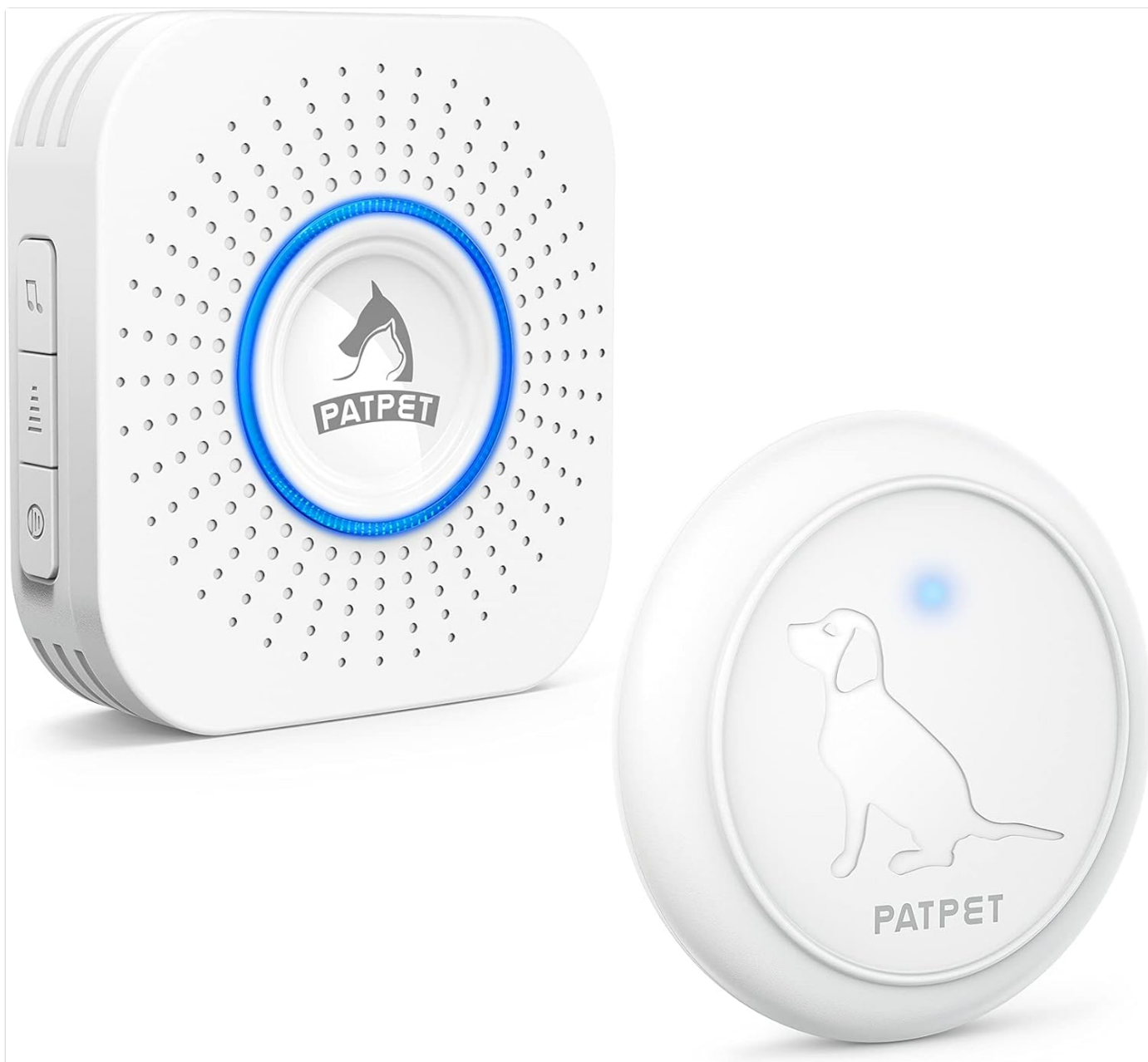
The main components of the wireless dog doorbell system: the receiver (left) and the touch button (right).