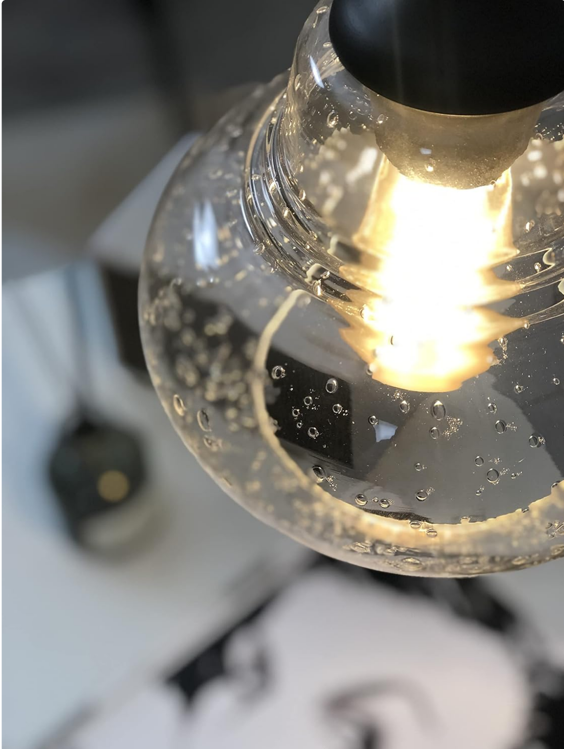
Image: A detailed close-up of the hand-blown seeded bubble glass shade, highlighting its unique texture.