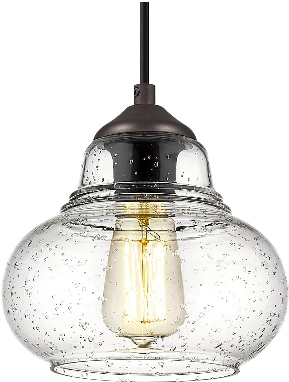
Image: The ELYONA 8 Inch Pendant Light Fixture, showcasing its unique seeded bubble glass and oil-rubbed bronze components.