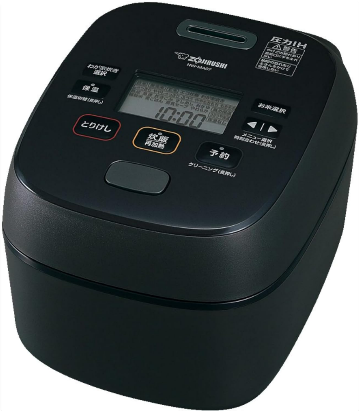
Figure 3.1: Zojirushi NW-MA07-BA Pressure IH Rice Cooker (Black)

maintenance. It features advanced cooking technology and user-friendly design.