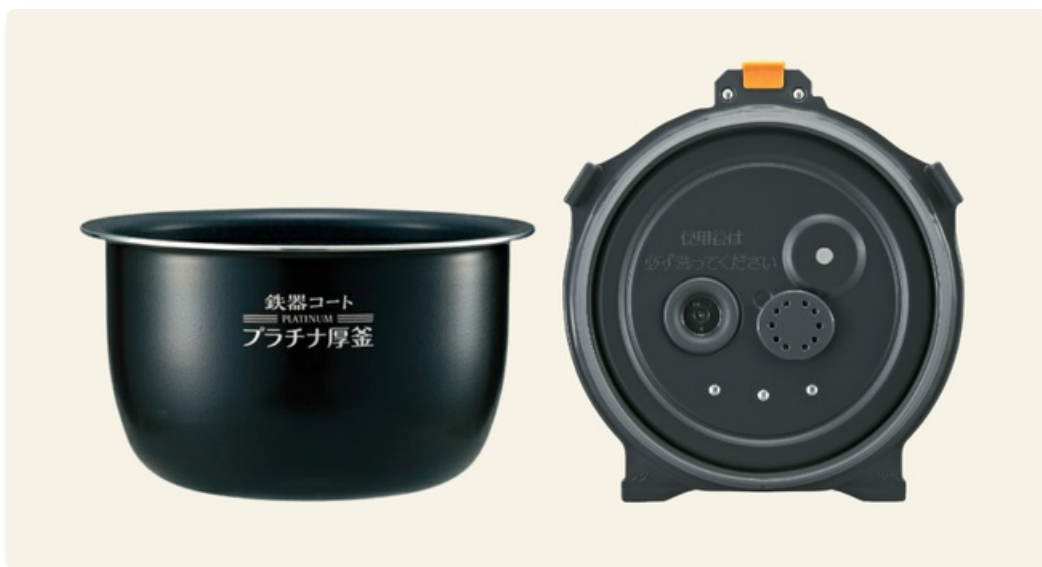
Figure 6.2: Detachable inner lid and inner pot for easy washing.