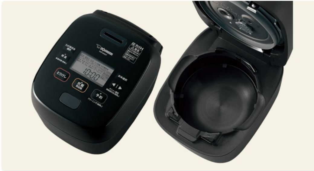
Figure 6.3: The flat interior design simplifies wiping down the main unit.