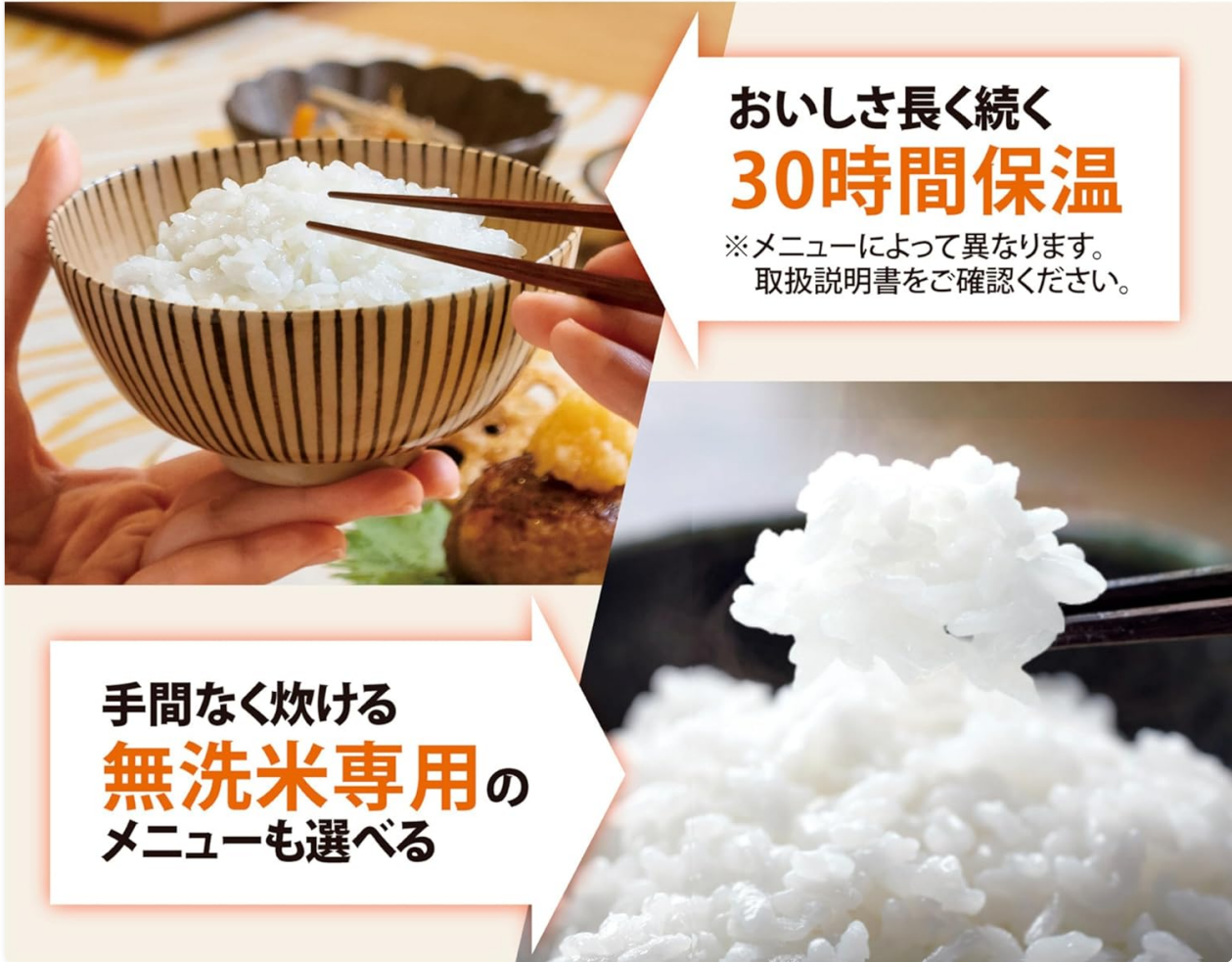
Figure 5.3: Visual representation of the 30-hour keep-warm function and rinse-free rice menu.