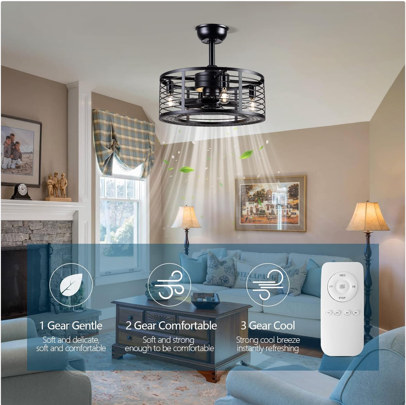
Figure 6.1: Fan Speed Settings and Remote Control

Utilize the 8-hour intelligent timing function to set the fan to automatically turn off after a specified duration. This feature helps conserve energy and provides convenience for overnight use.