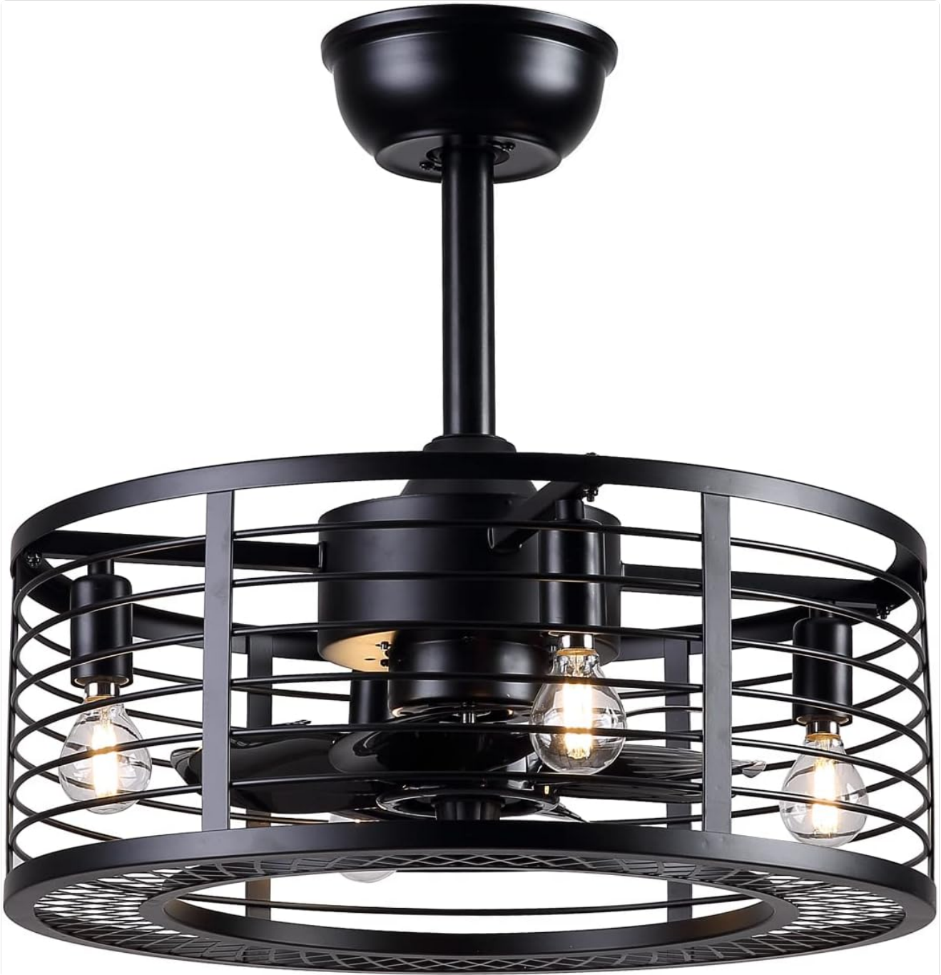
Figure 1.1: Dannilong Modern Enclosed Ceiling Fan (Stripped)