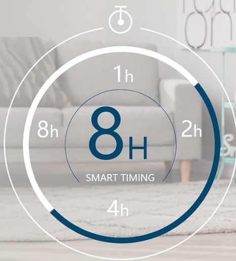
Figure 6.2: 8H Intelligent Timing Feature