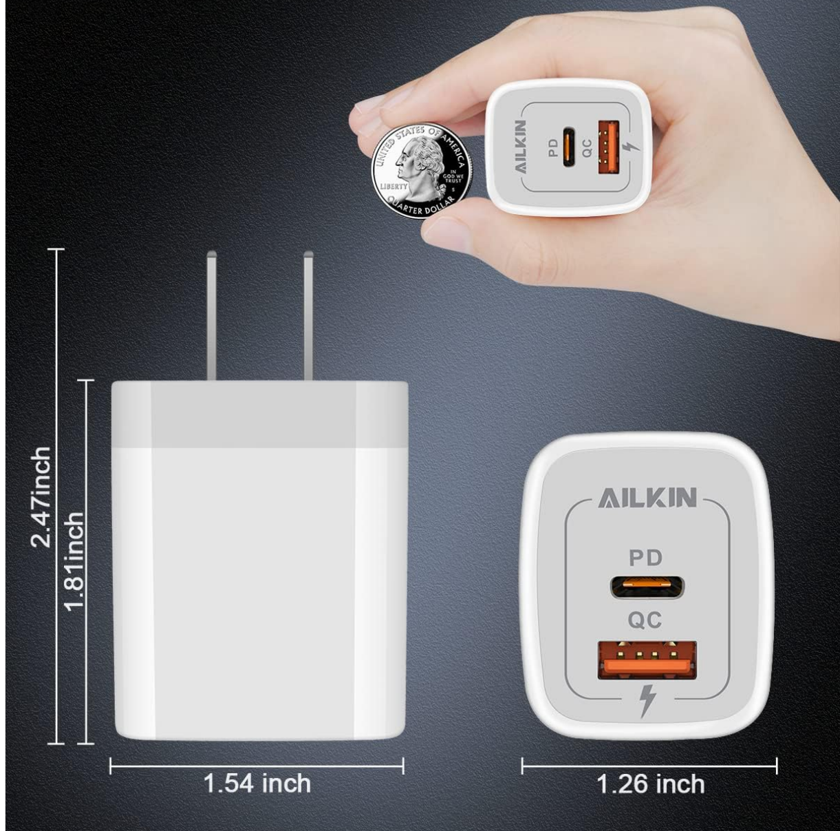
Image 9.1: Dimensions of the AILKIN charger, highlighting its compact and portable design.

Compact, lightweight, portable, stylish and perfect for travel