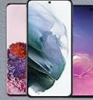
Samsung S21/S20 Mobile Accessories