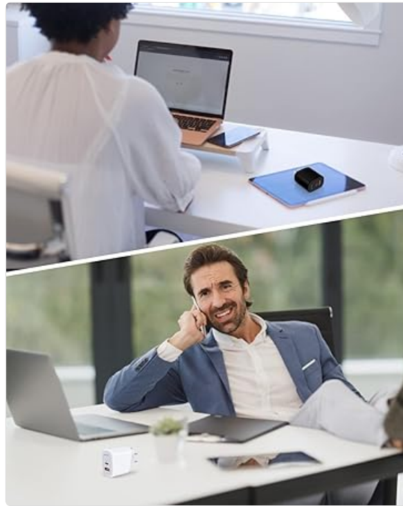
Image 5.2: The charger providing high-speed charging to a Samsung phone via its USB-A QC3.0 port.