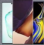
Samsung Note 8 Mobile Accessories