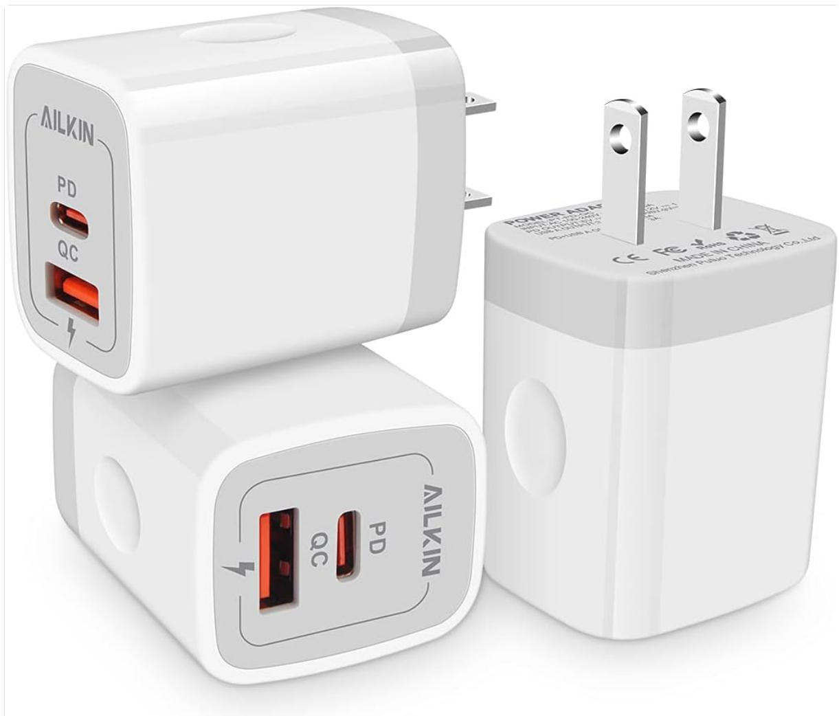
Image 2.1: The AILKIN 20W Dual Port USB-C Wall Charger, showing both USB-C (PD) and USB-A (QC) ports.