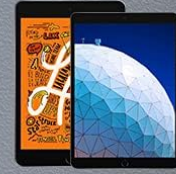
iPad mini/ Air/ iPad Pro