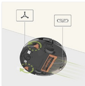
Image: Visual representation of the robot's various cleaning modes and scheduling options.