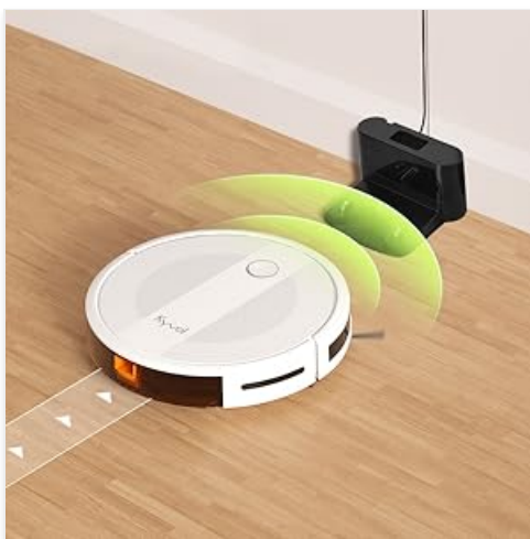
Image: The robot vacuum automatically docking with its charging station.

Place the robot vacuum onto the charging base. The indicator light on the robot will show charging status. For first-time use, fully charge the robot for at least 5-6 hours.