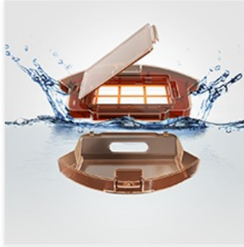
Image: Illustration of the robot vacuum's multi-stage filtration system, capturing dust and allergens.

Remove the filter from the dustbin. Tap off loose debris. The filter can be rinsed with water; ensure it is completely dry before reinstallation. Replace the filter every 3-6 months, depending on usage.