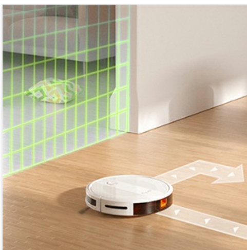
Image: The robot vacuum detecting and avoiding a boundary tape, illustrating its ability to respect no-go zones.

To prevent the robot from entering certain areas, place the magnetic boundary tape on the floor. Ensure the tape is laid flat and securely. The robot will detect the tape and avoid crossing it.