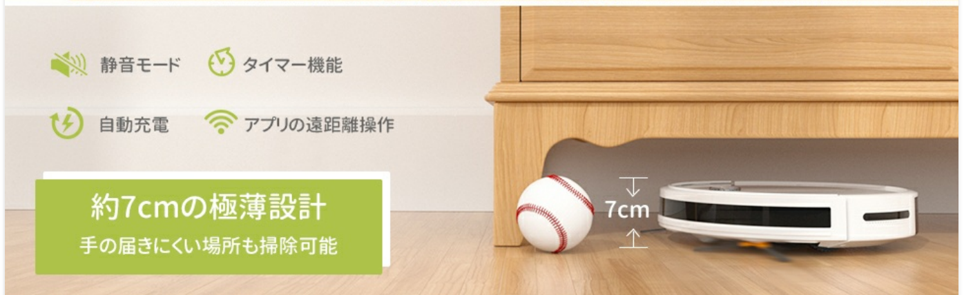
Image: The KYVOL E20 Robot Vacuum Cleaner actively cleaning a floor, illustrating its powerful 2500Pa suction.