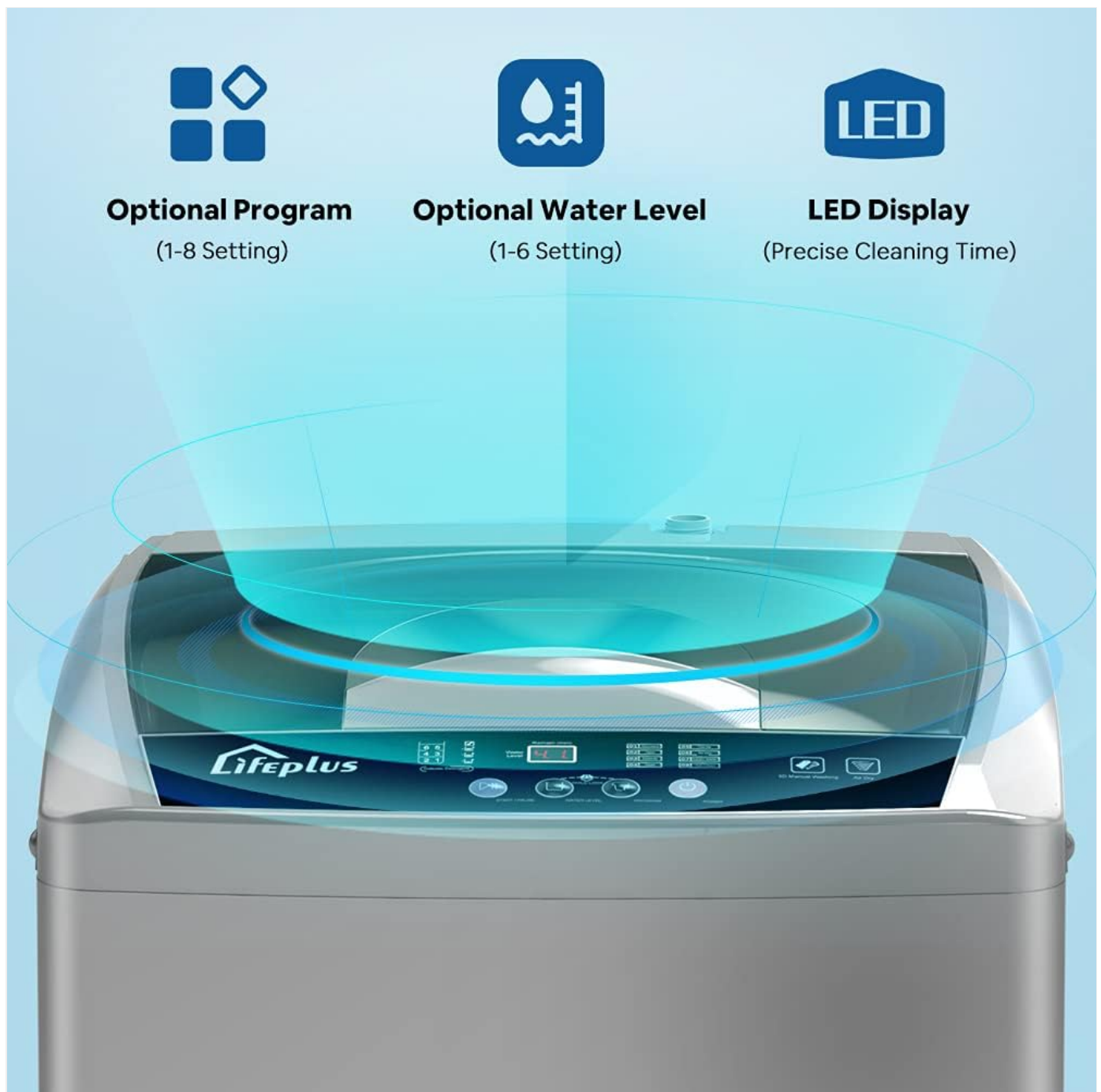
Figure 3.2: Control Panel Overview. The control panel features an LED display for precise cleaning time, along with buttons for selecting 8 optional programs and 6 optional water levels.