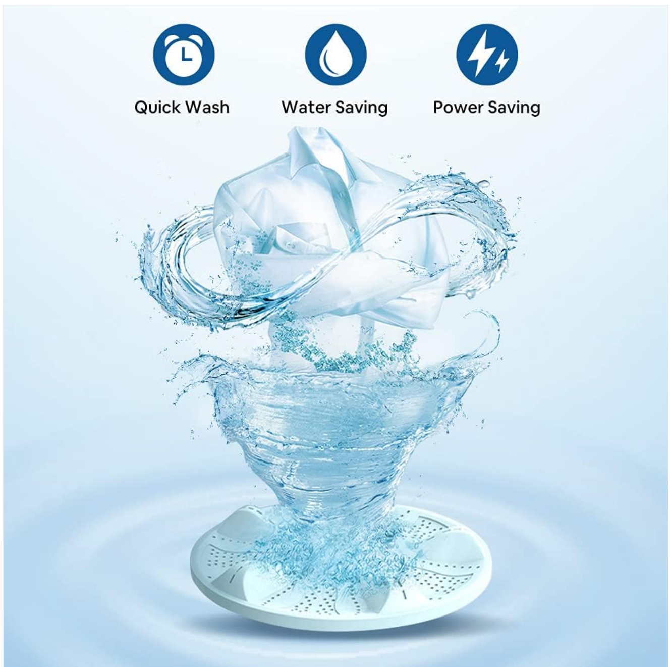
Figure 5.2: Efficient Washing Features. This graphic highlights the machine's capabilities for quick wash cycles, water saving, and power saving, contributing to an efficient laundry process.