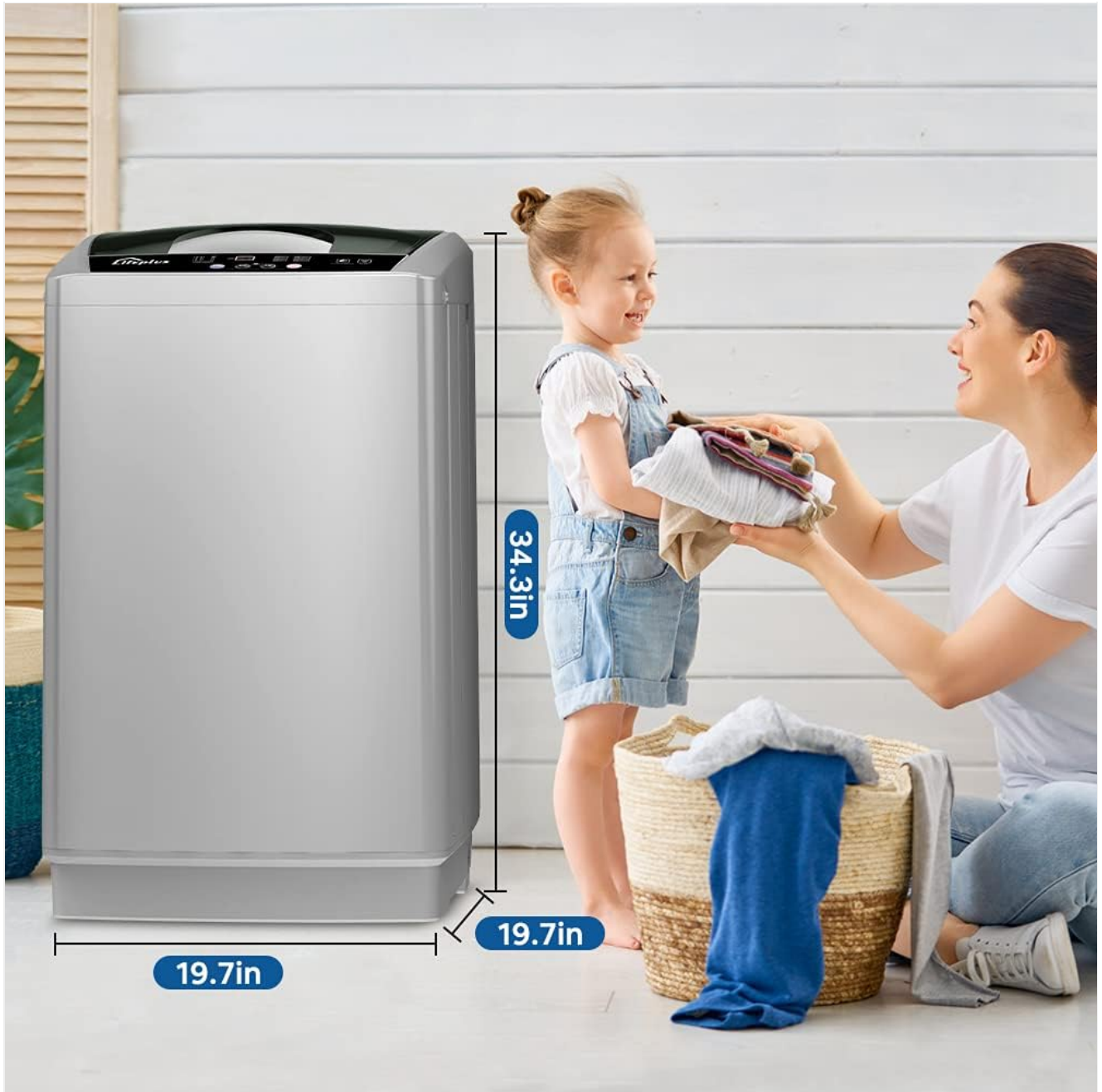
Figure 4.1: Product Dimensions. The image illustrates the compact dimensions of the washing machine: 19.7 inches (width) x 19.7 inches (depth) x 34.3 inches (height), making it suitable for various spaces.