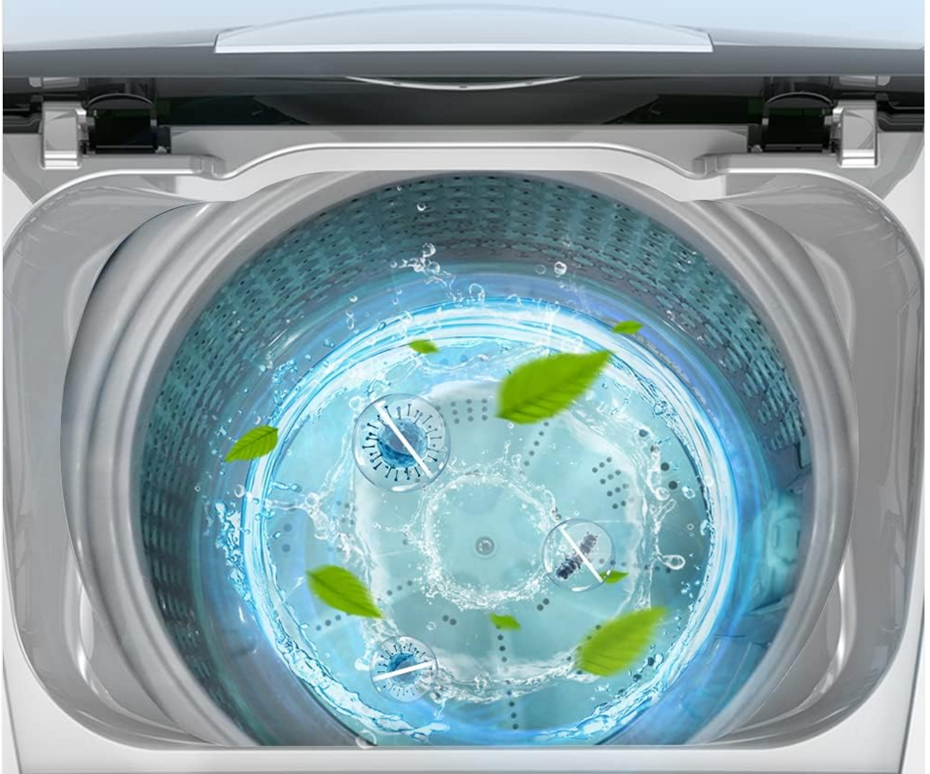
Figure 6.1: Auto Tub Cleaning Function. This image shows the interior of the washing machine tub with water and bubbles, illustrating the automatic tub cleaning feature designed to maintain hygiene and performance.