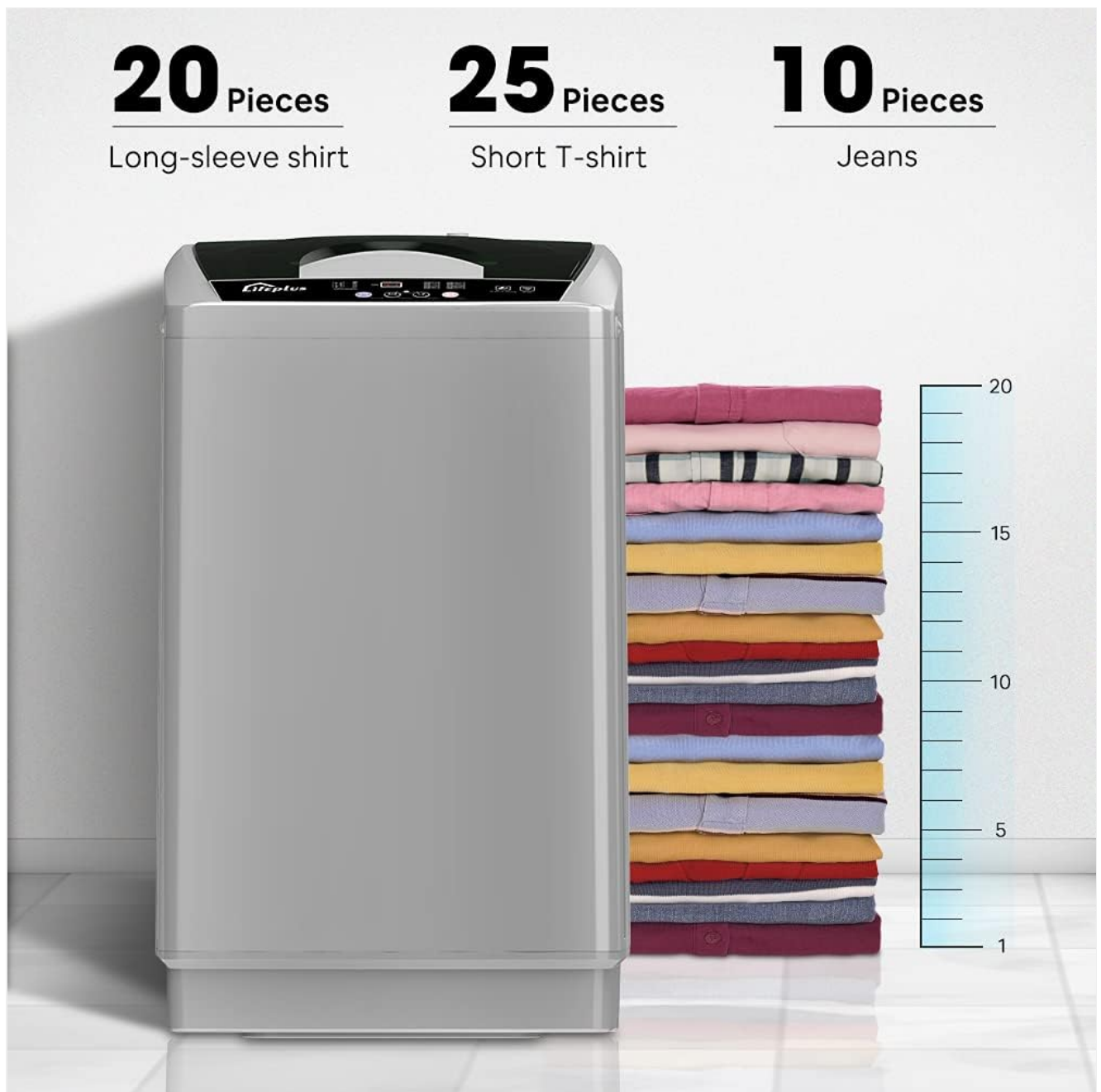
Figure 5.1: Laundry Capacity Guide. This image provides a visual guide for the machine's capacity, indicating it can hold approximately 20 long-sleeve shirts, 25 short T-shirts, or 10 pairs of jeans.