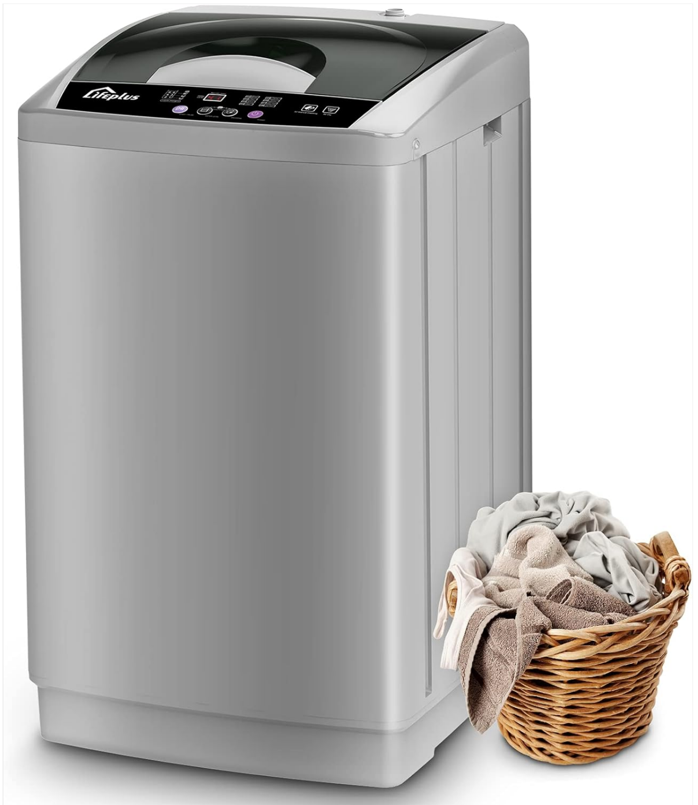
Figure 3.1: LifePlus Full Automatic Washing Machine. This image shows the compact design of the washing machine next to a laundry basket, highlighting its suitability for smaller living spaces.