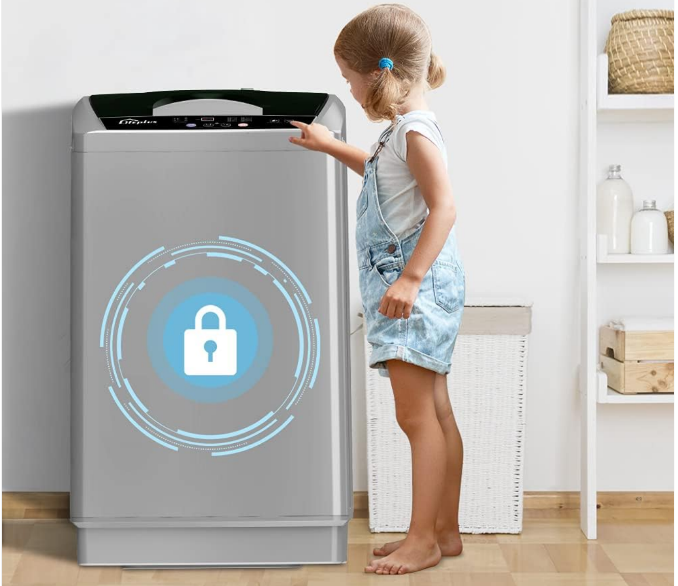
Figure 5.3: Safe Child Lock Feature. This image demonstrates the child lock function, which secures the control panel to prevent unintended operation by children, enhancing household safety.