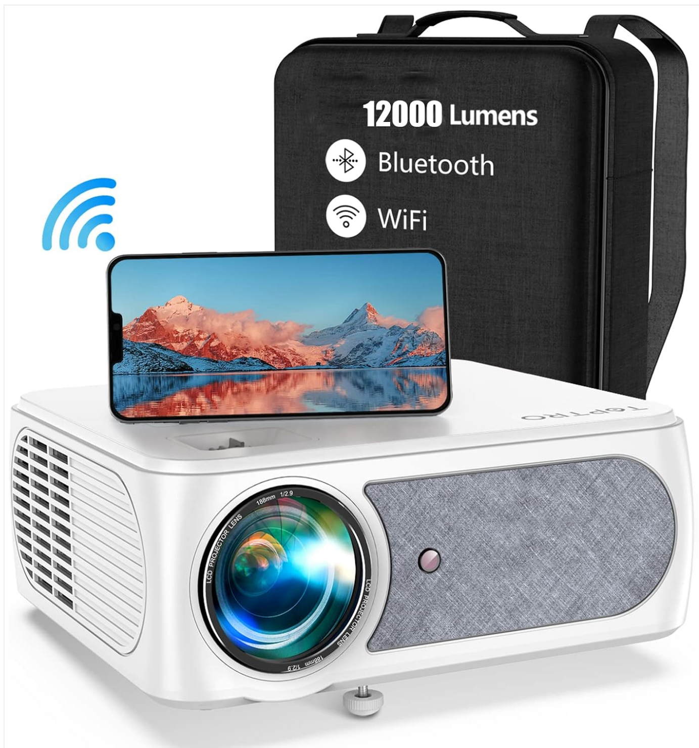
Image: The TOPTRO X3 Native 1080P Projector, a compact and versatile device for home entertainment.