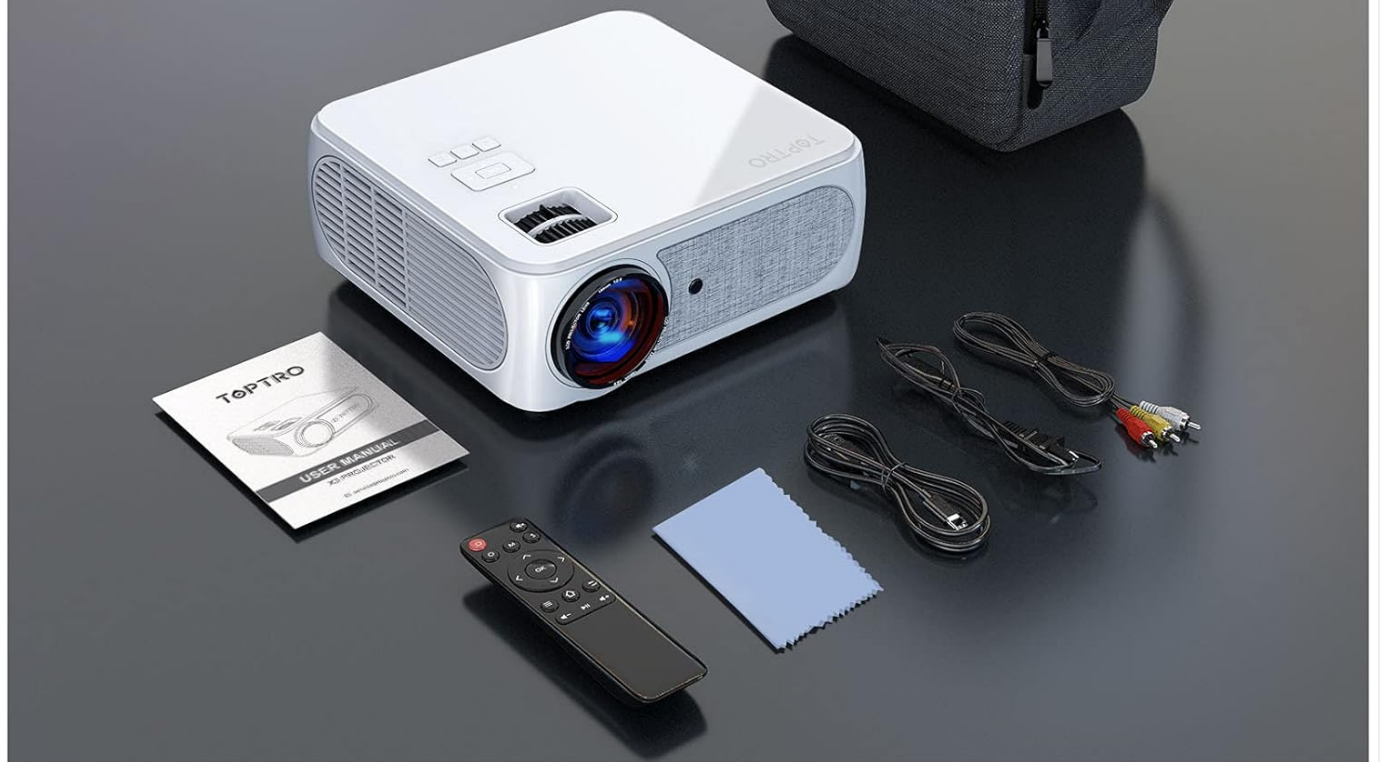
Image: Contents of the TOPTRO X3 Projector package, including the projector, cleaning cloth, backpack, instructions, remote control, AV cable, HDMI cable, and power cord.