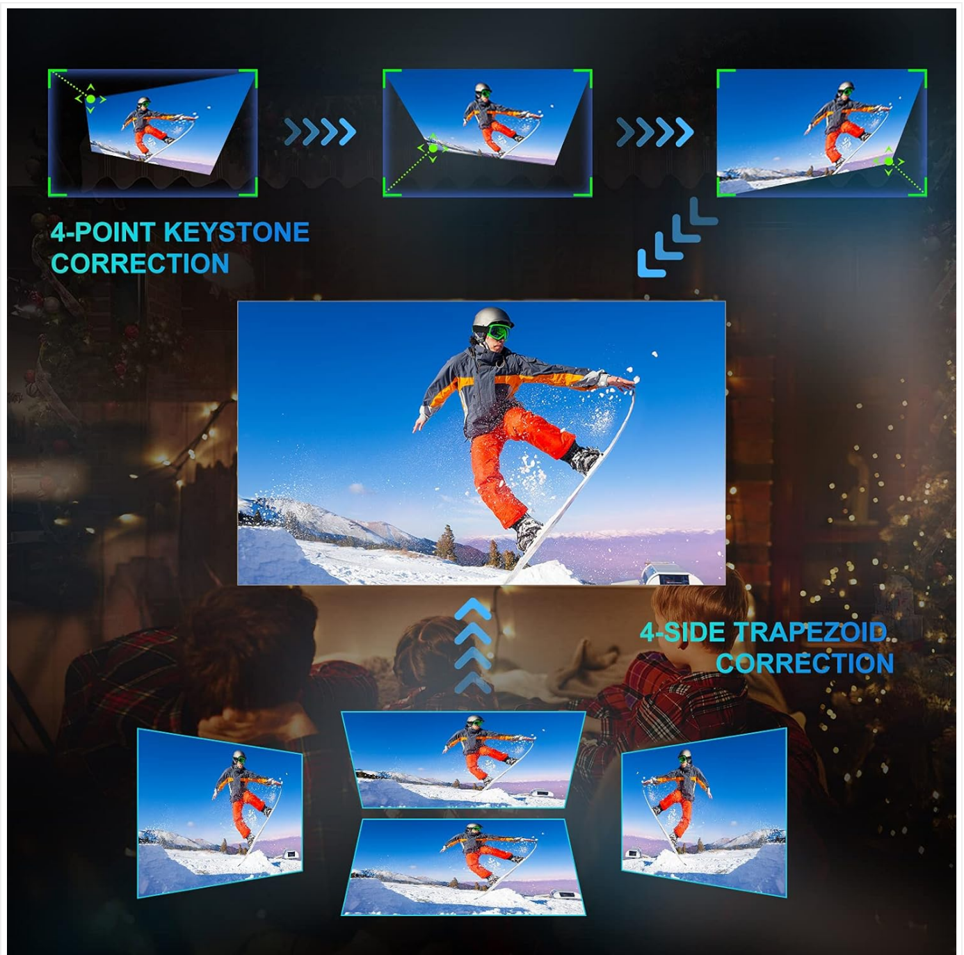
Image: Diagram illustrating 4-point and 4-side keystone correction features of the TOPTRO X3 Projector.