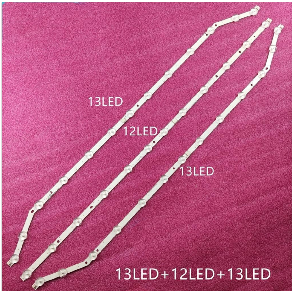
Figure 2: The set of three LED backlight strips, illustrating the number of LEDs on each strip (13, 12, and 13 LEDs respectively).