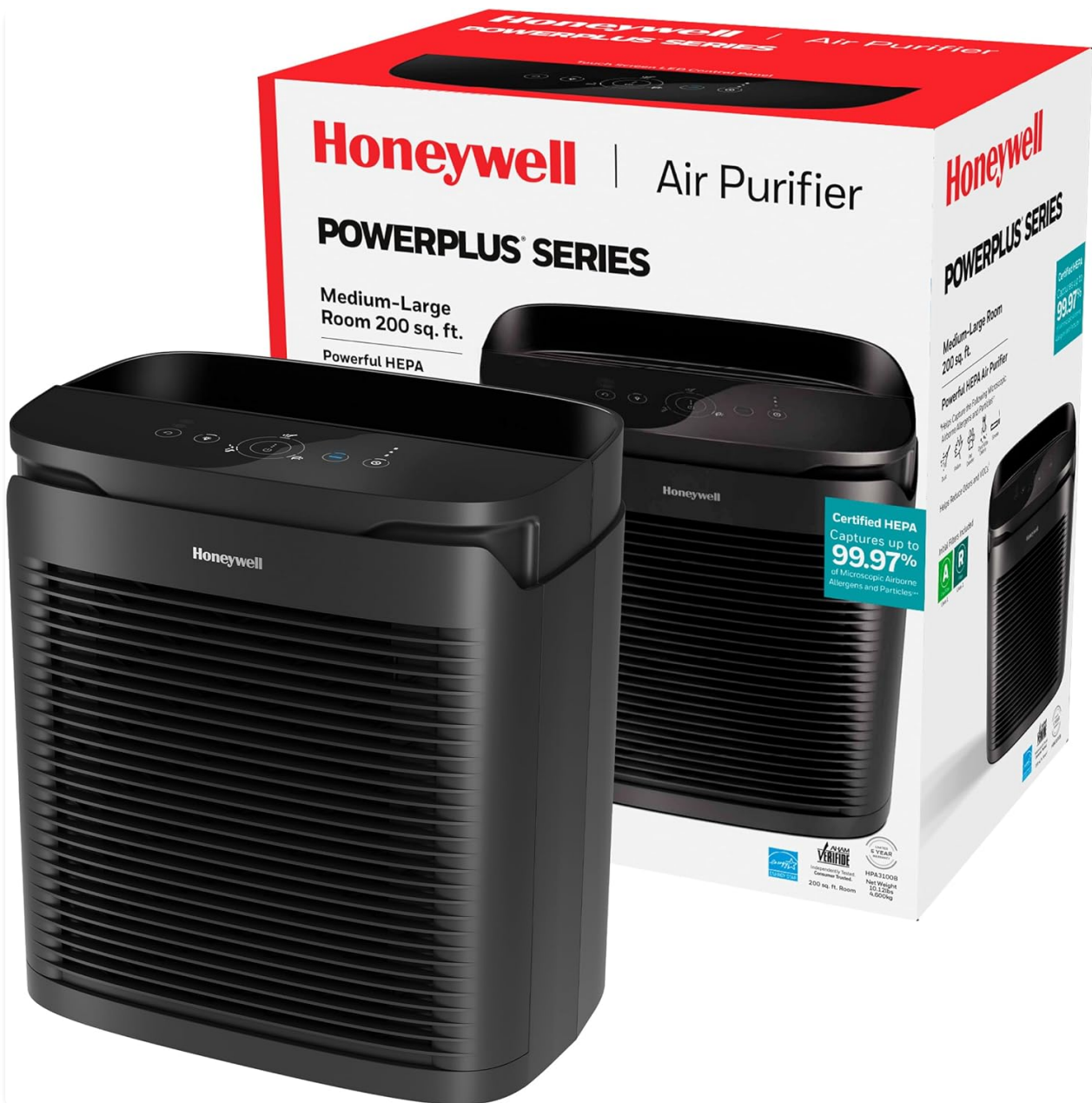
Image 1.1: The Honeywell PowerPlus HEPA Air Purifier HPA3100, shown with its retail packaging.