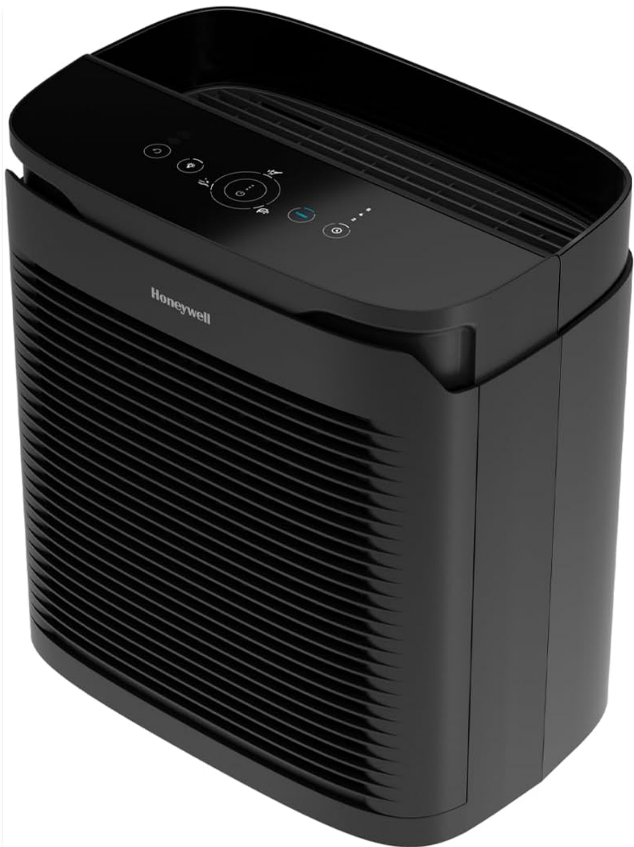
Image 5.1: Top view of the air purifier, highlighting the control panel.