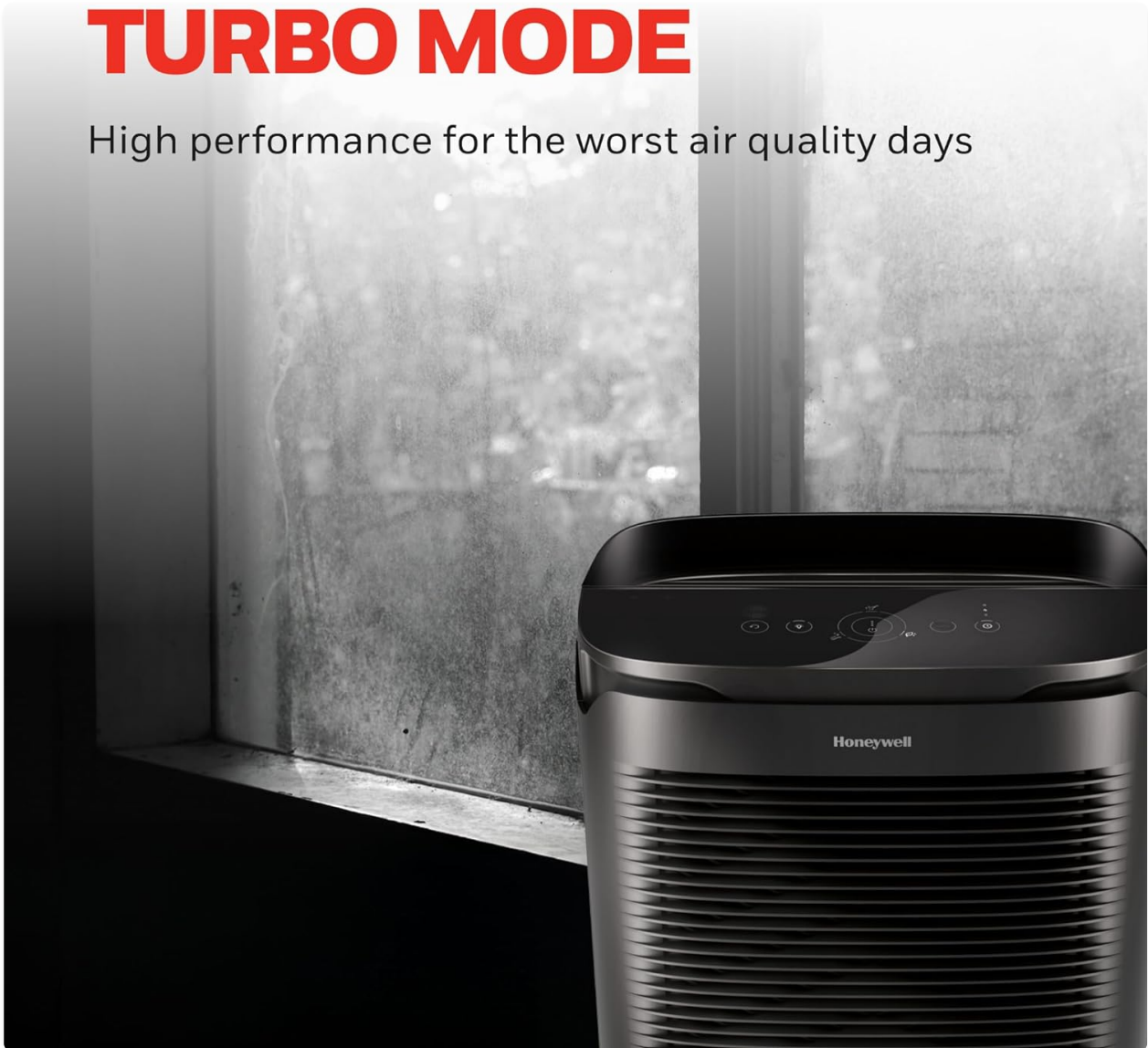
Image 5.2: The air purifier operating in Turbo Mode, designed for high performance.

High performance for the worst air quality days