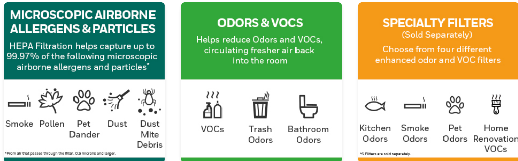
Images 6.1-6.3: Visuals detailing the types of particles and odors captured by the filters, including optional specialty filters.

Always use genuine Honeywell replacement filters for reliable air cleaning.