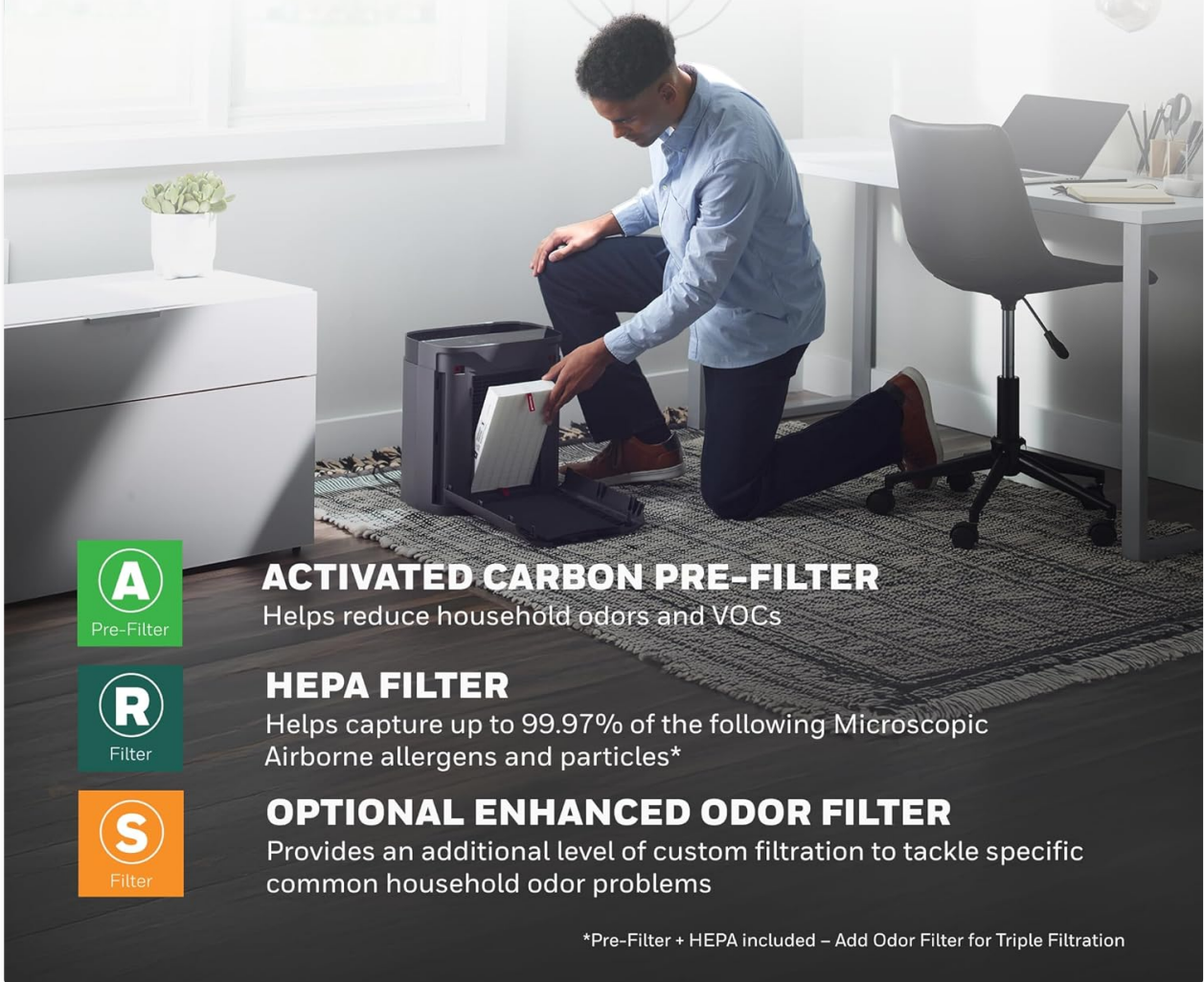
Image 4.1: Illustration of filter installation, showing the placement of the pre-filter (A), HEPA filter (R), and optional specialty filter (S).