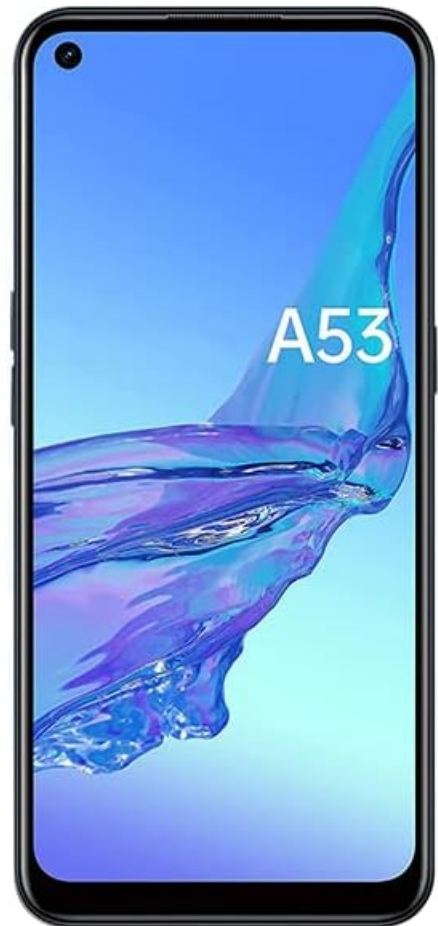
Image 2.1: Visual confirmation of compatible Oppo models with the BLP601 battery.