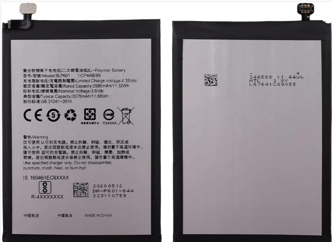
Image 5.1: Detail of the battery connector, which must be carefully handled during installation.

Note: Detailed visual instructions for battery replacement are widely available on video platforms like YouTube. Search for '[Your Phone Model] battery replacement' for step-by-step guides.