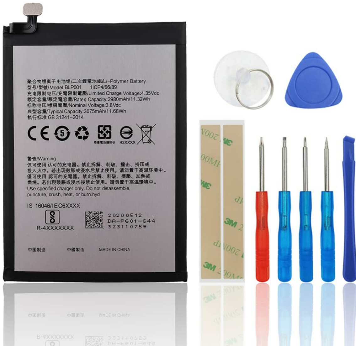
Image 1.1: Front and back view of the SwarKing BLP601 replacement battery, showing specifications and regulatory marks.