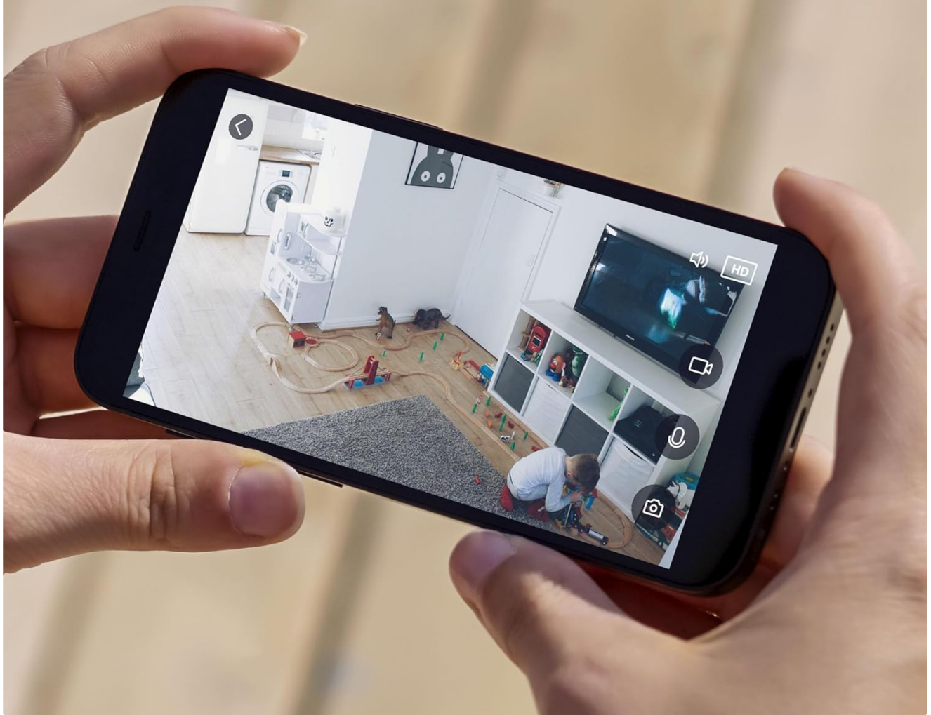
Image: A smartphone held in hands, showing a live video feed from the Geeni camera, emphasizing the ability to watch live video from home.

Watch live video of your home, anytime, anywhere, right from your smartphone.