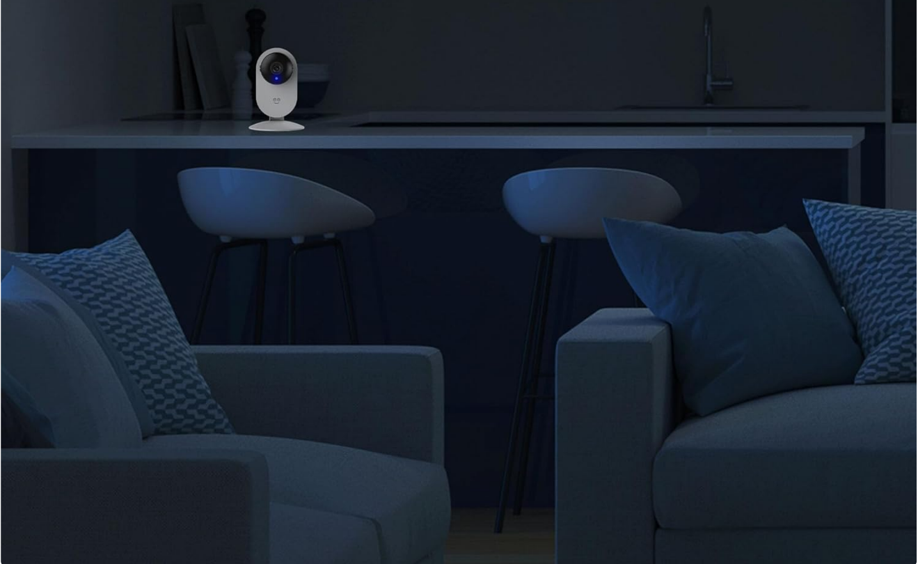
Image: A Geeni camera mounted on a wall, demonstrating its swivel-designed neck for flexible positioning and finding the perfect angle.

Keep an eye on your space at all times with high-quality night vision for seamless nighttime surveillance.