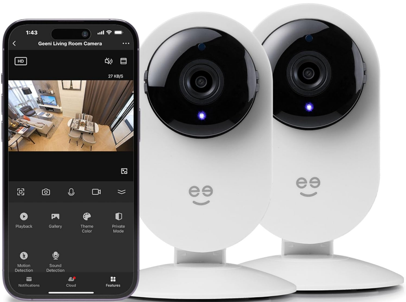
Image: Geeni Glimpse 1080p Smart Indoor Camera shown alongside a smartphone displaying its live feed, highlighting its remote monitoring capability.