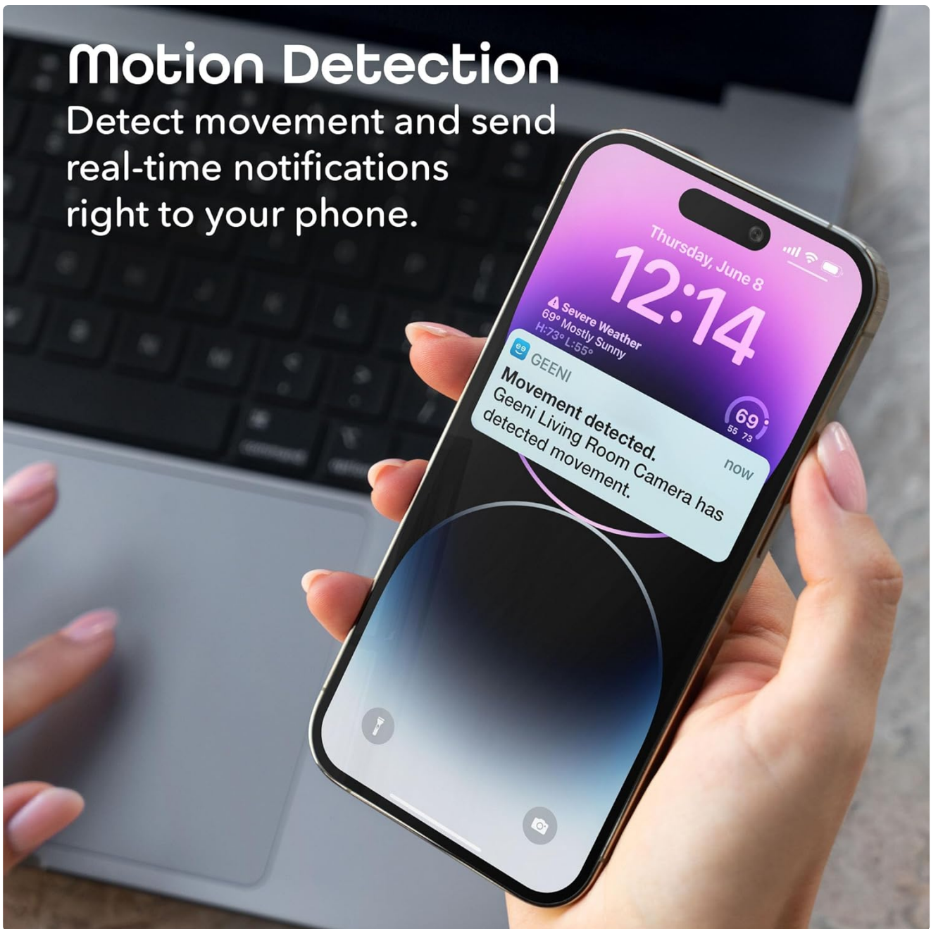
Image: A smartphone screen showing a notification from the Geeni app indicating "Movement detected," illustrating the motion detection feature.

Detect movement and send real-time notifications right to your phone.