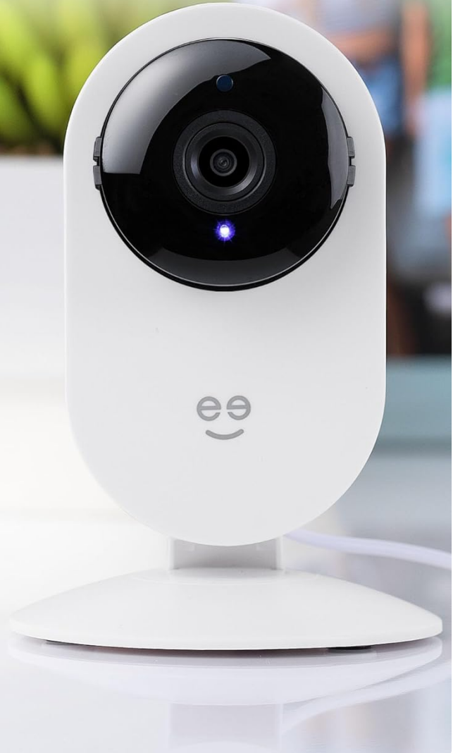
Image: An infographic illustrating the main features of the Geeni Glimpse camera, including HD Live Video, Motion Sensor, 2-Way Audio, Night Vision, Swivel Design, Motion Zone, MicroSD Slot, Cloud Storage, and Multiview.