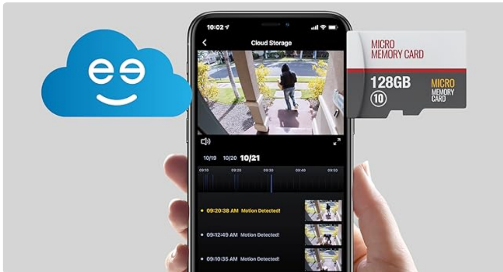
Image: A smartphone screen showing cloud storage options and a MicroSD card icon, indicating flexible storage solutions for camera footage.