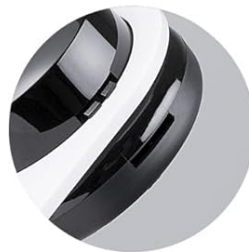
microSD Card Slot