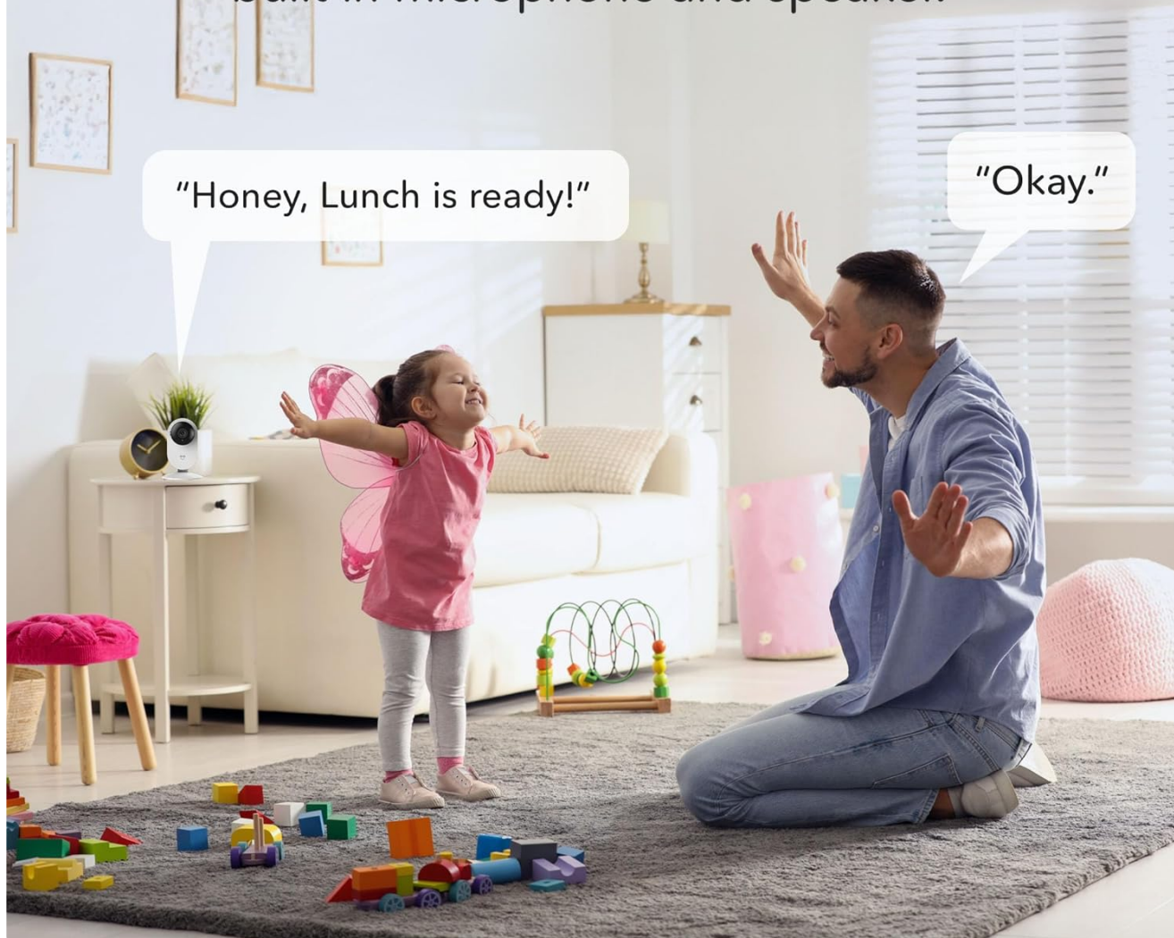
Image: An adult and a child in a living room setting, with speech bubbles demonstrating the instant two-way audio feature of the camera.

Talk to anyone on camera instantly using the built-in microphone and speaker.