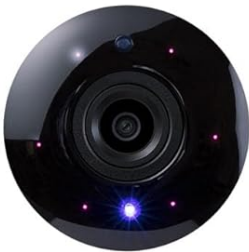
IR Night Vision