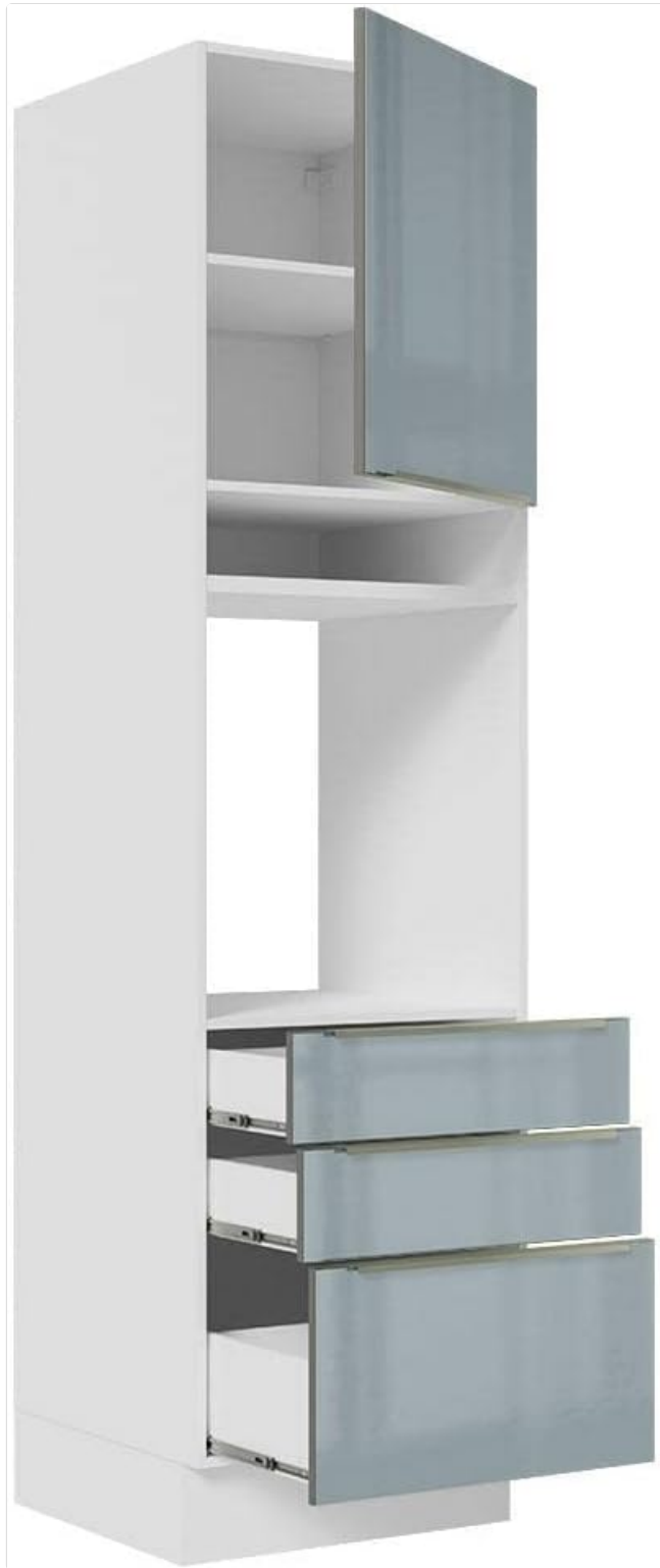
Image 4.3: View of the Madesa Lux 60 cm Hot Tower with the upper door and three lower drawers open.