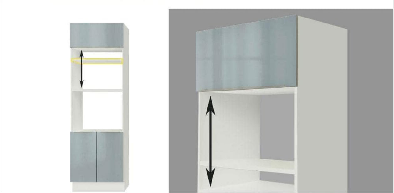
Image 5.1: Detail showing the adjustable shelf feature in the upper compartment.

Torre quente possui prateleira com altura regulável