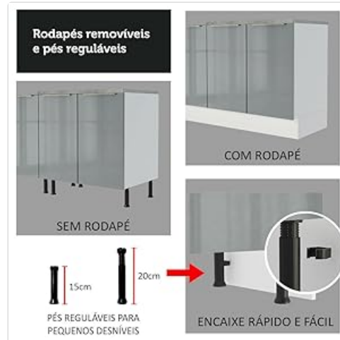
Image 7.1: Detail of the adjustable feet for leveling the cabinet.