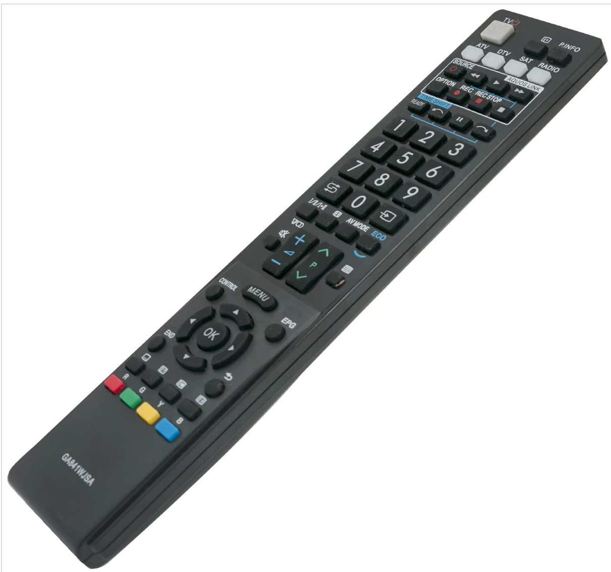
Image 2: Front view of the ALLIMITY GA841WJSA remote control, displaying its layout and button functions.