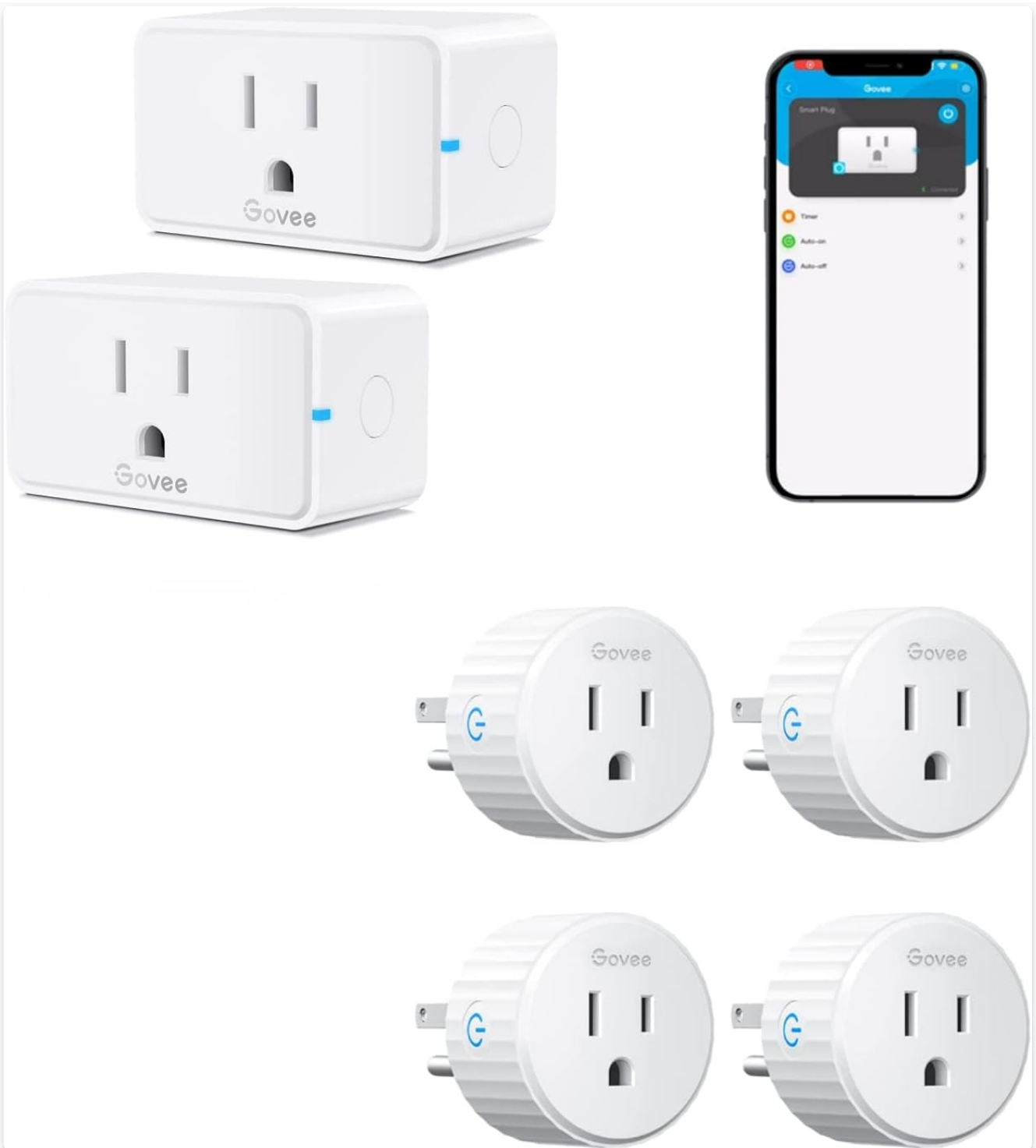
Govee Smart Plugs and the Govee Home app interface.