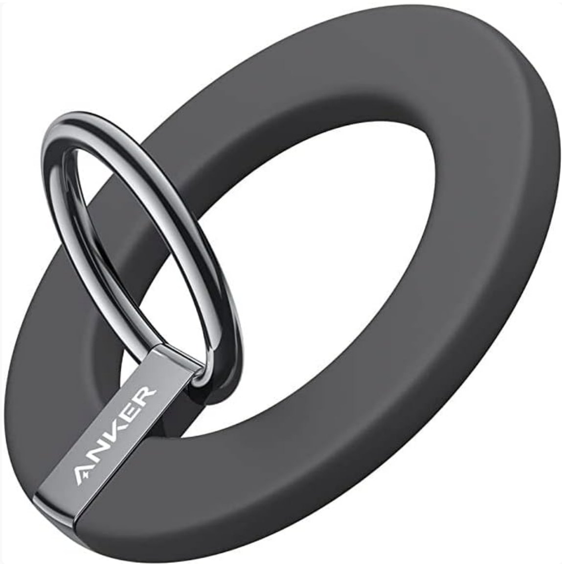
Image: The Anker 610 Magnetic Phone Grip (MagGo) in Interstellar Gray, showcasing its sleek design.