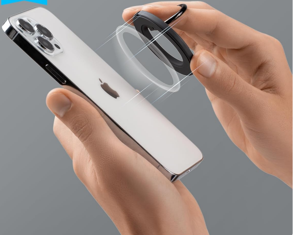
Image: A user demonstrating the easy snap-on attachment of the Anker MagGo grip to an iPhone,