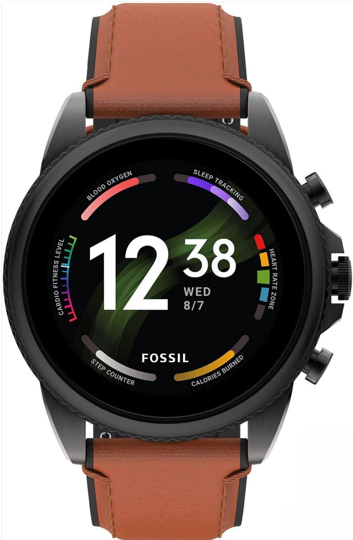
Image: Front view of the Fossil Gen 6 Smart Watch, displaying the time and various health metrics on its circular screen.