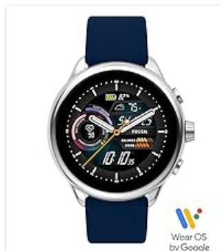
Image: Close-up of the Fossil Gen 6 Smart Watch face showing various health metrics and tracking indicators.

The watch is also swimproof , allowing for use during swimming and other water activities.