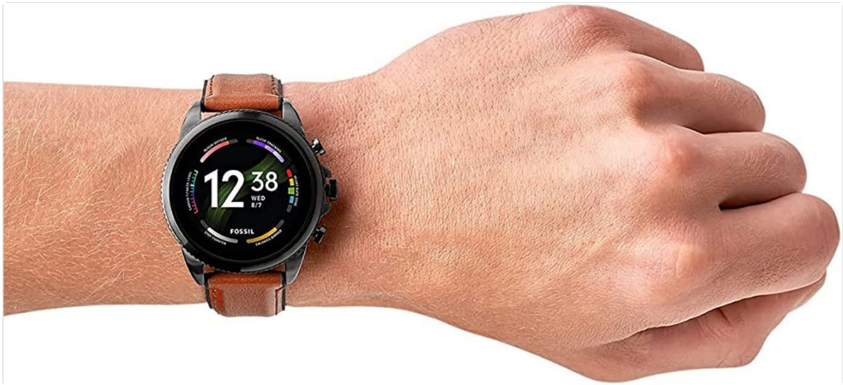
Image: The Fossil Gen 6 Smart Watch worn on a wrist, displaying a vibrant and personalized watch face.