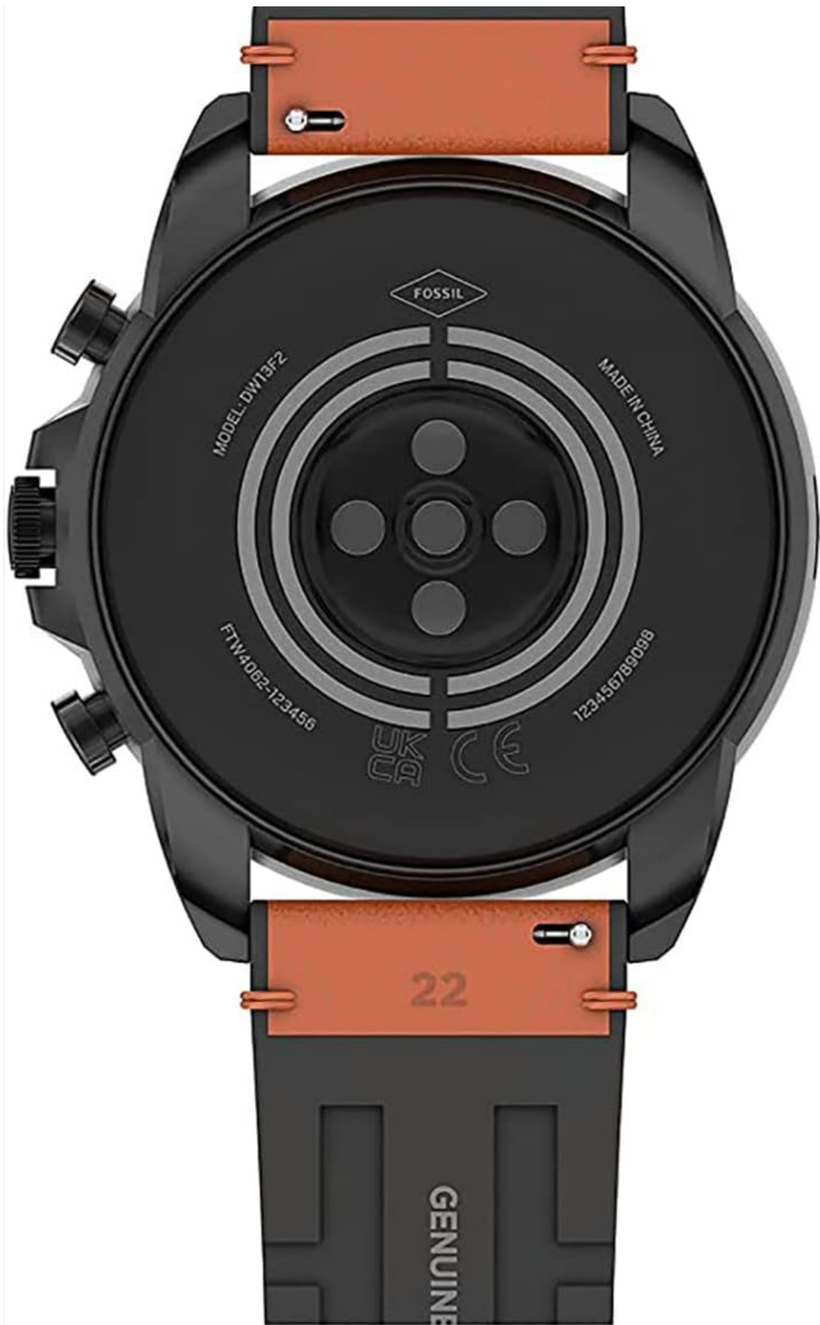
Image: Rear view of the Fossil Gen 6 Smart Watch, highlighting the magnetic charging contacts.

Important: To prevent damage, use only the included charger. Do not use USB hubs, splitters, Y-cables, battery packs, or other peripheral devices for charging.