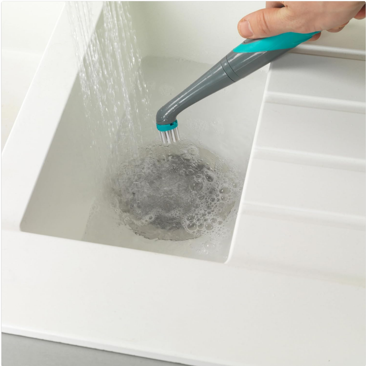
Image: The Beldray brush cleaning around a sink drain, demonstrating its precision.