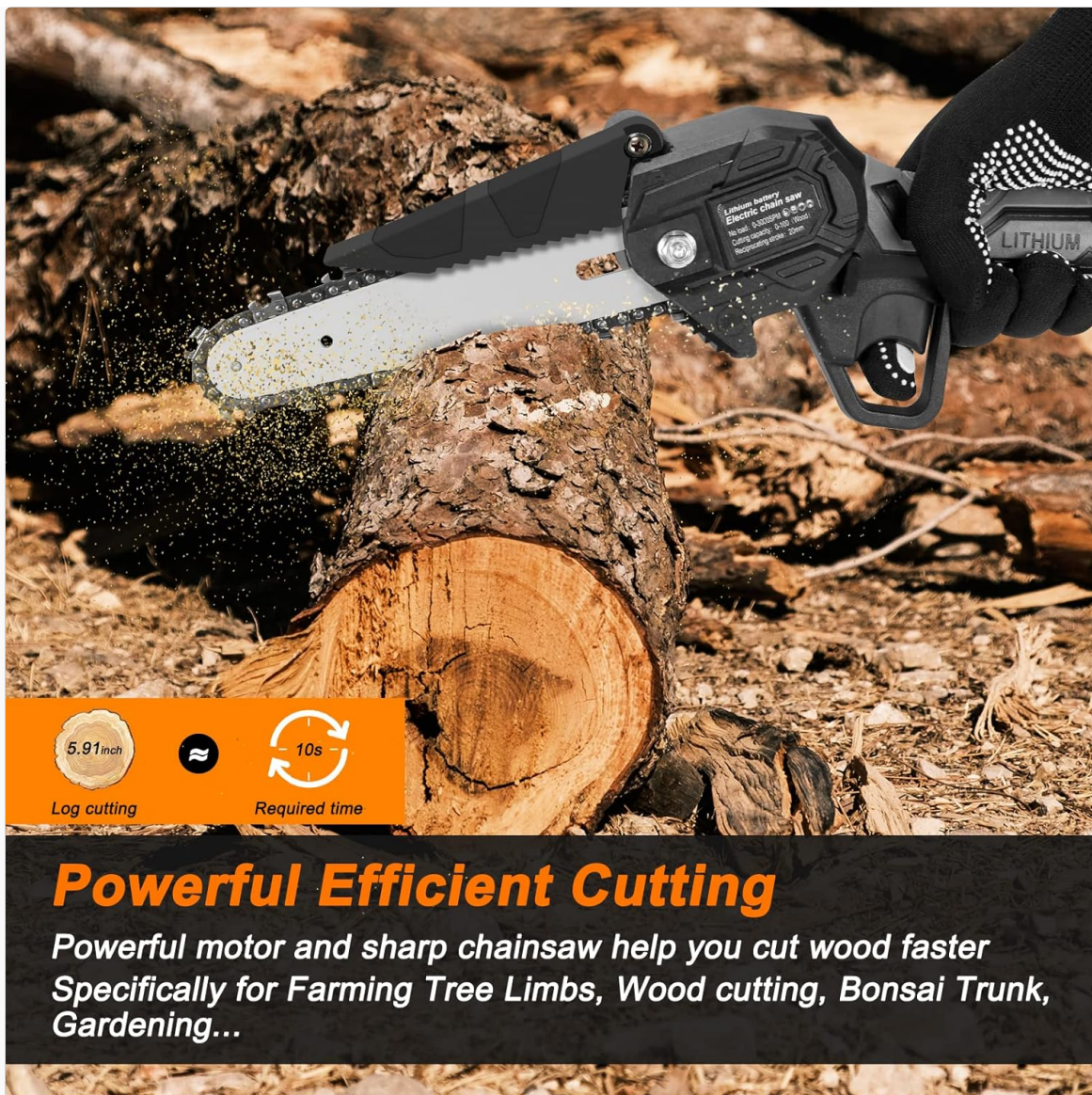
Image: The chainsaw in action, demonstrating its capability for log cutting.